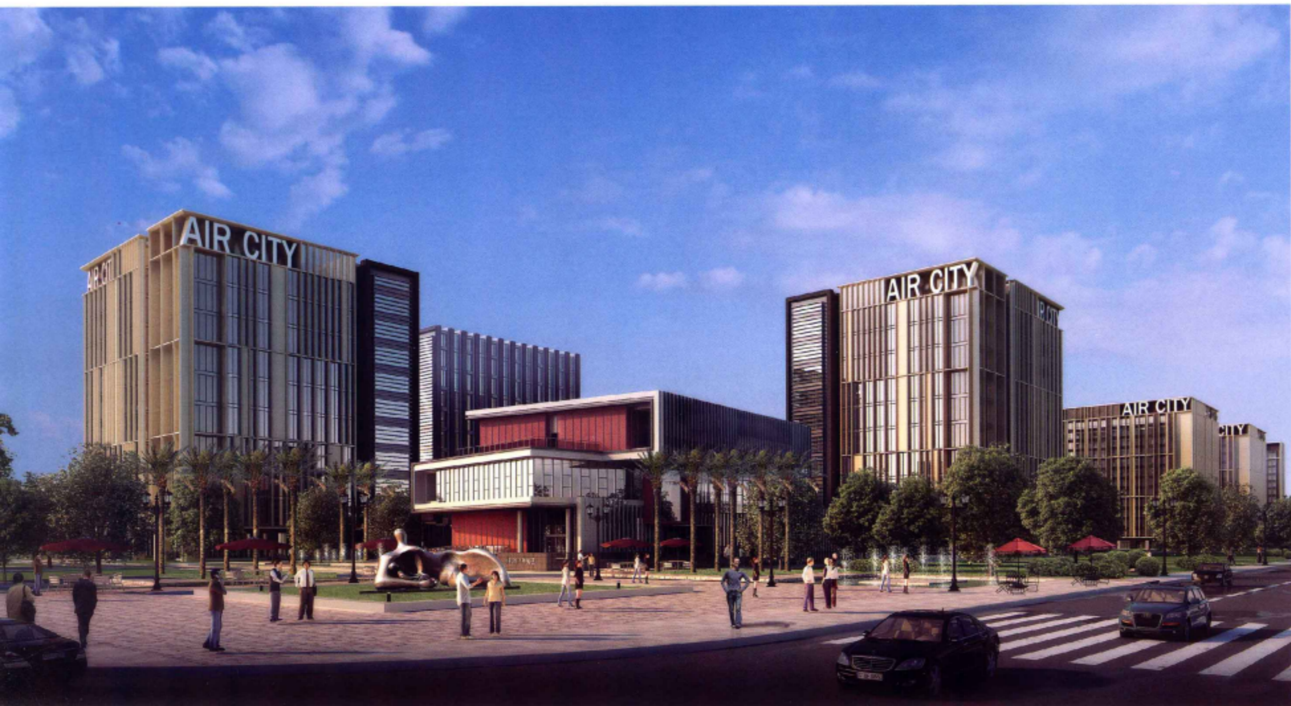
top left and right exterior view/外景图