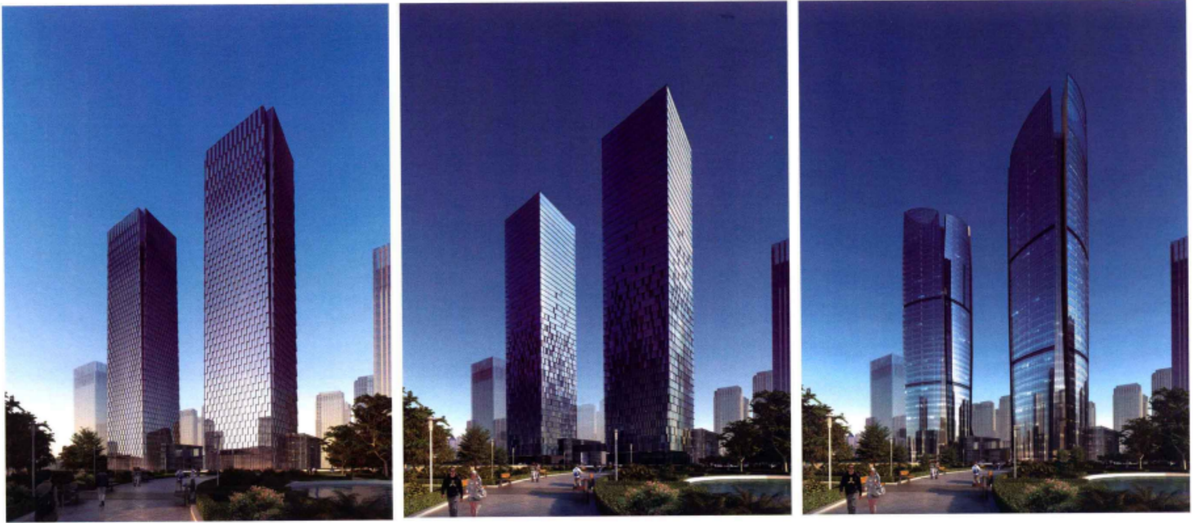
above concepts contrast/多方案对比 below tower plans/塔楼平面图 right conception result/概念成果