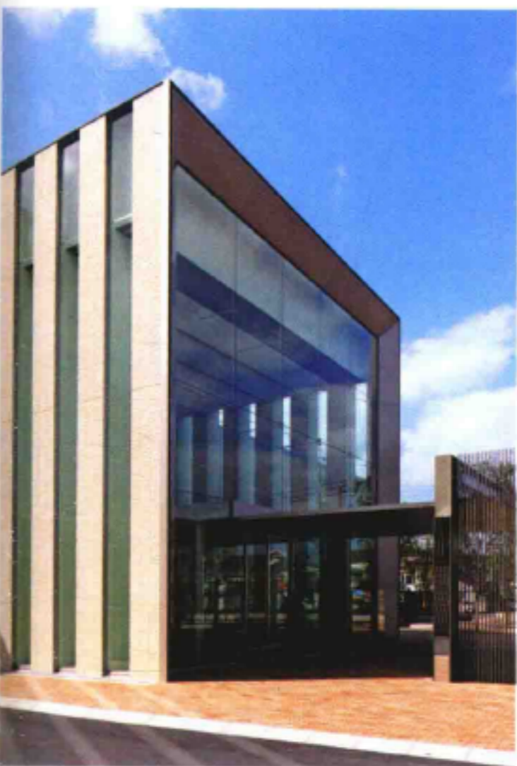
建筑正面 Front view