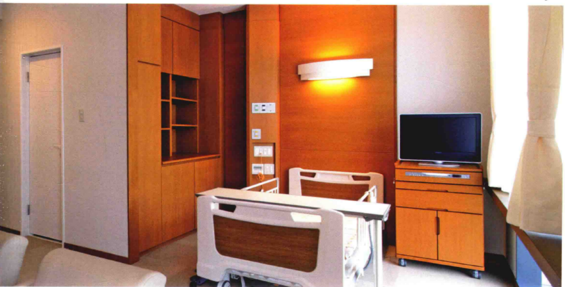
特殊私人病房 Special private room