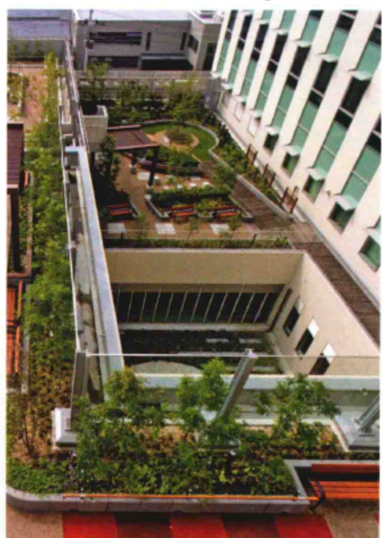
康复花园 Rehabilitation garden