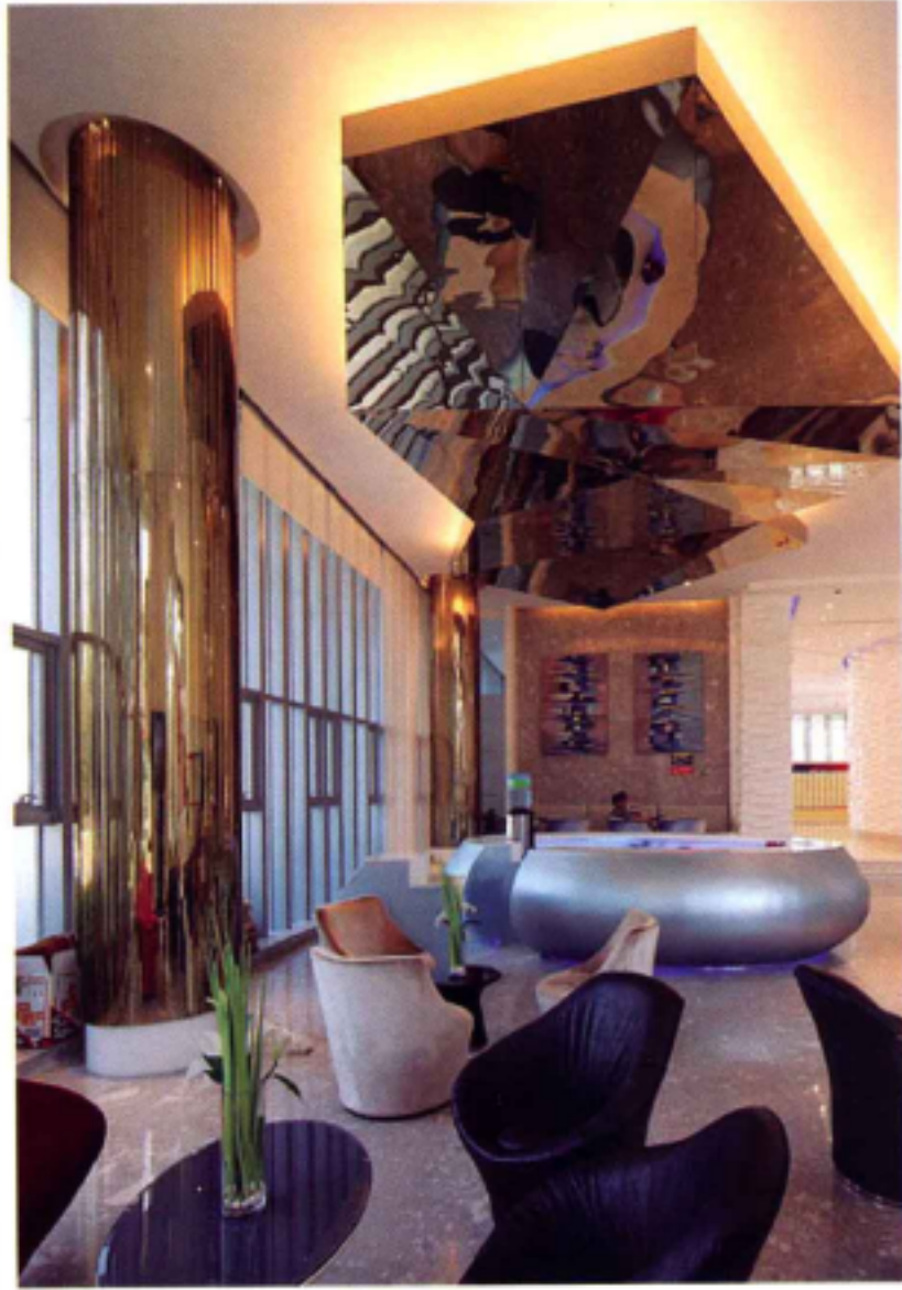
left interior spaces photos/内部空间实景图 right node section/节点详图