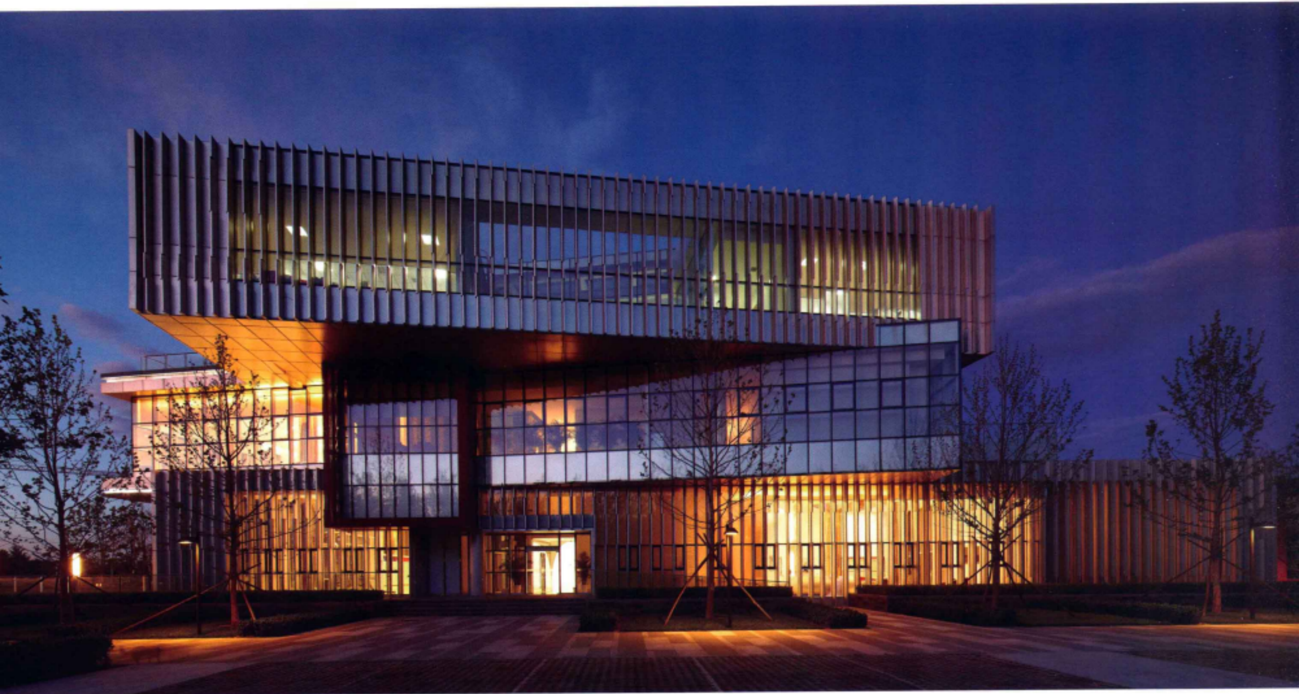
left and right exterior spaces photos/外部空间实景图