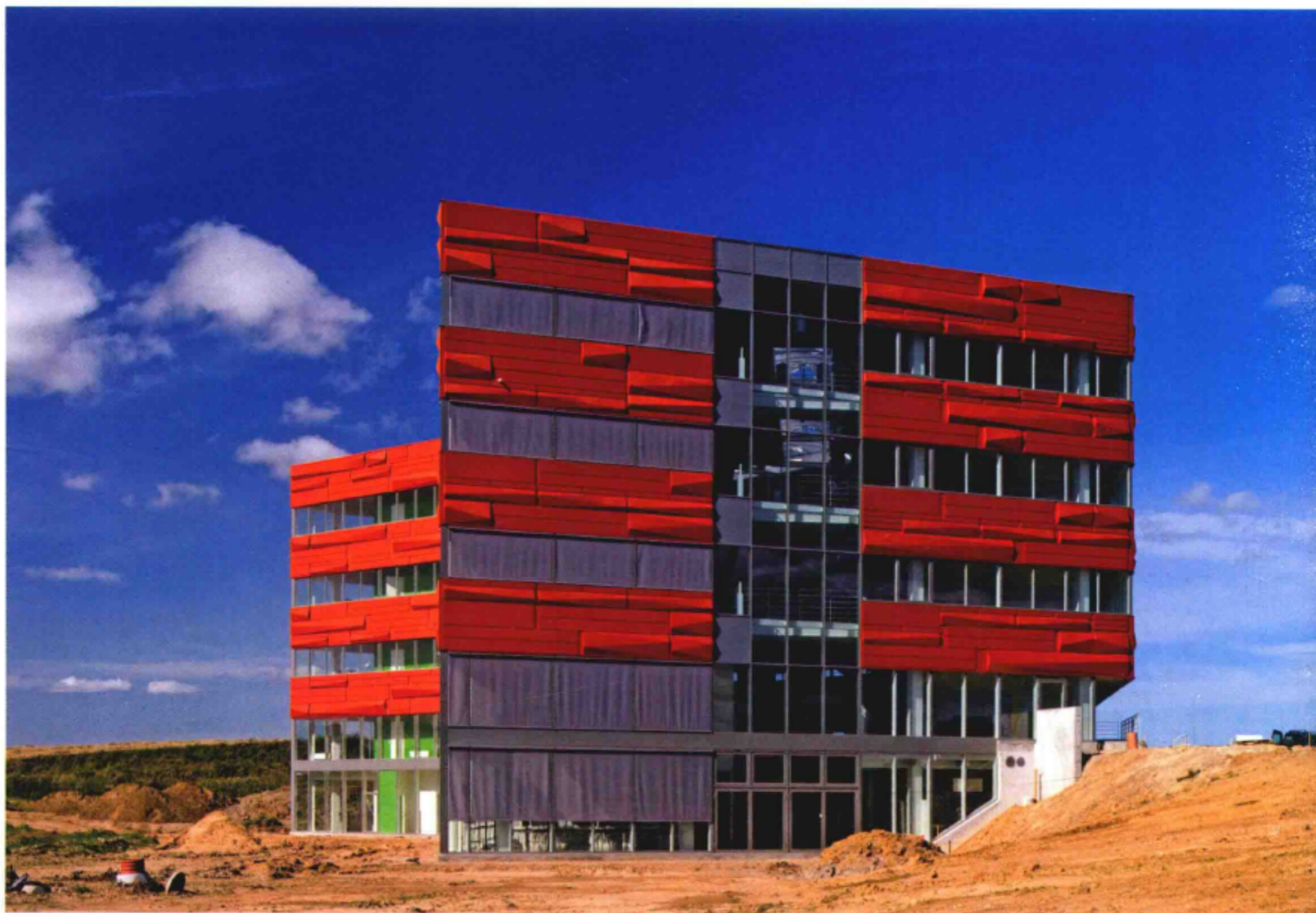
View from the south 建筑南侧外观