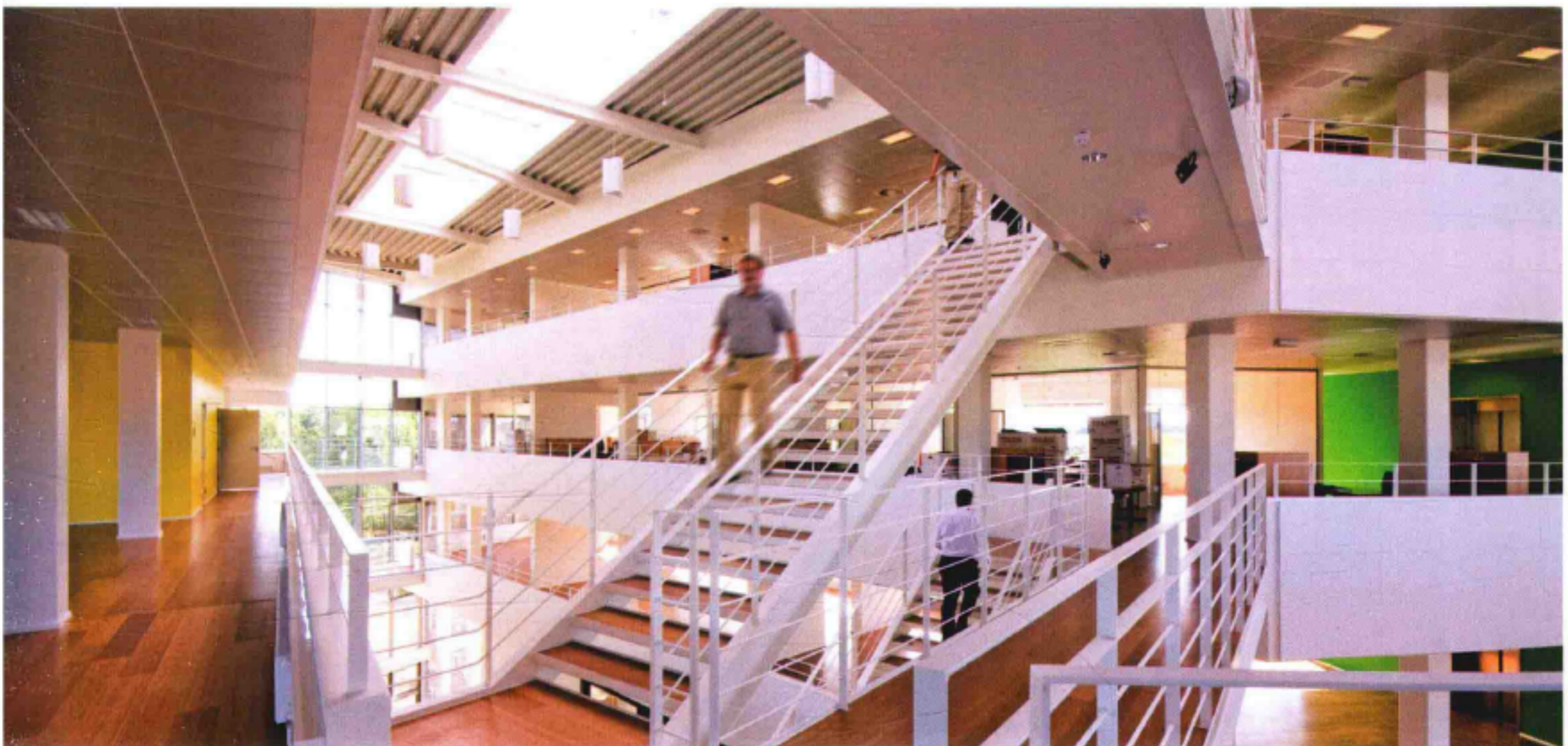
两翼办公楼由走道连接 The two wings connected by walkways