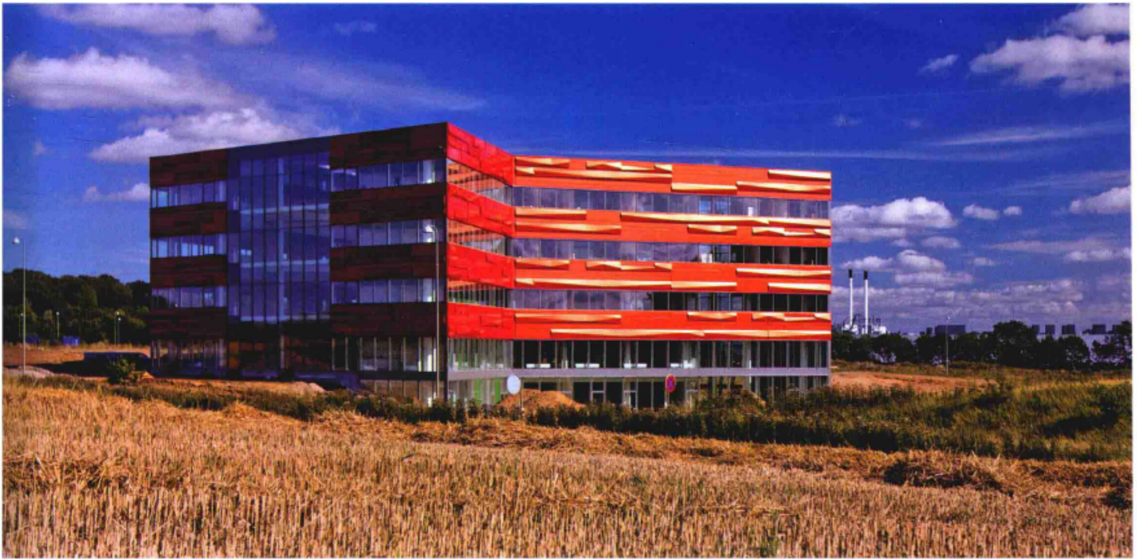
从高速公路上看建筑 Seen from the passing motorway