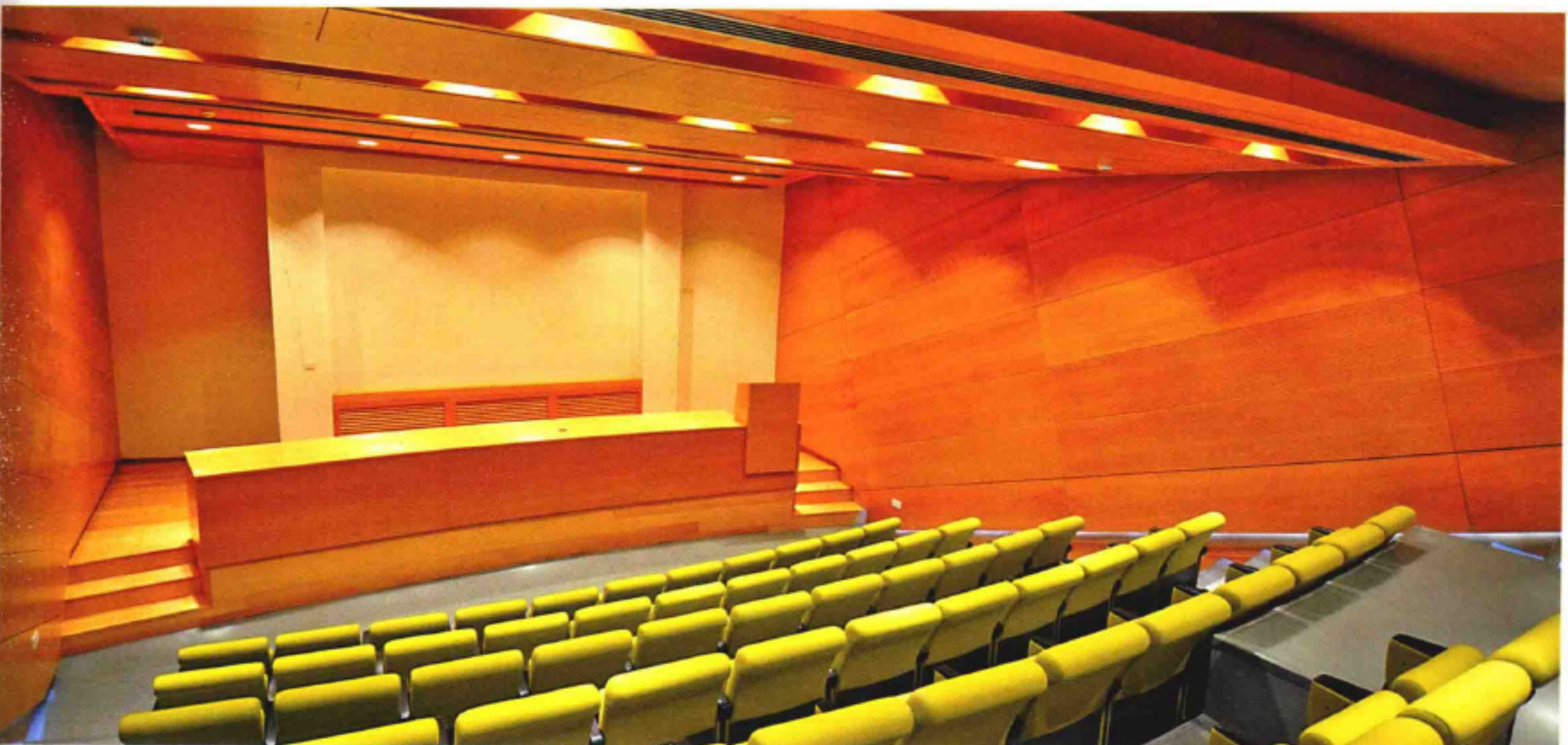
阶梯教室和礼堂 Lecture theatre and auditorium