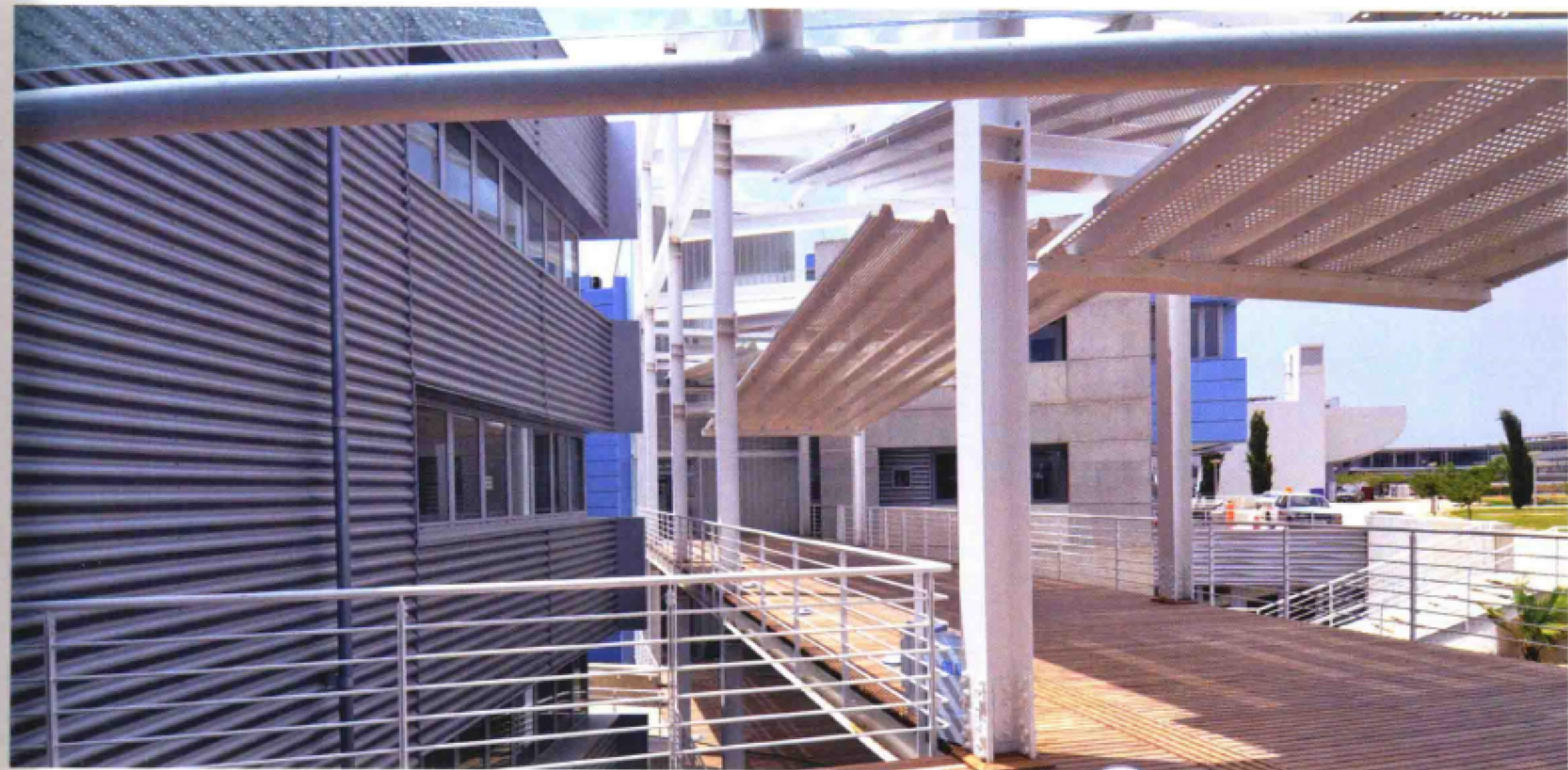
连接桥 Connecting bridges