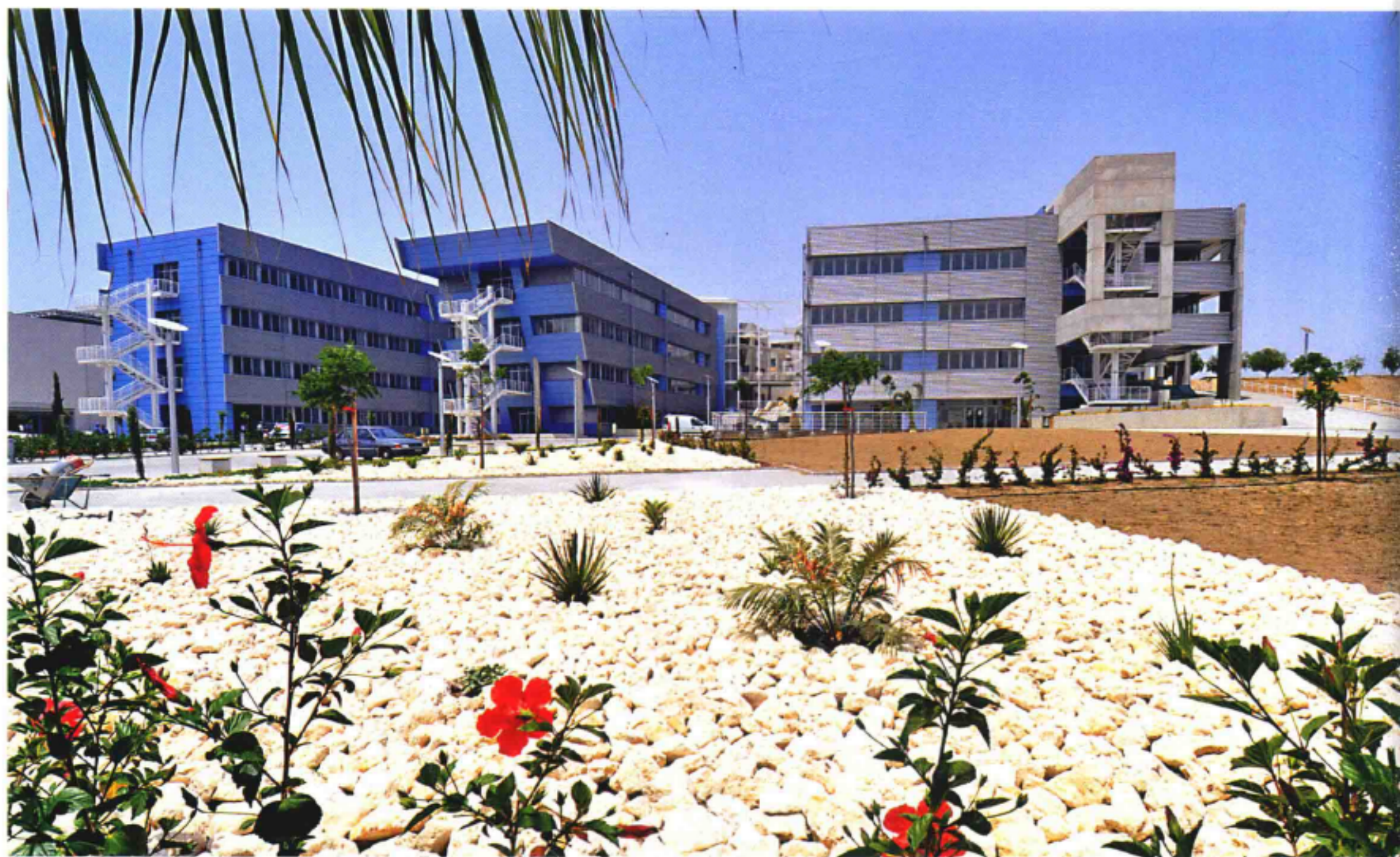
Buildings melt with nature 建筑融于自然之中