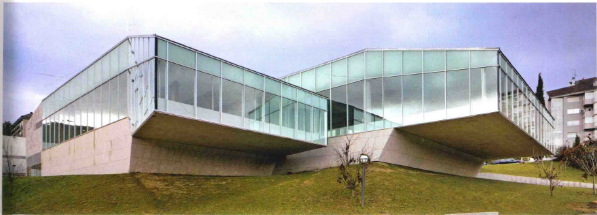
建筑全景 General view