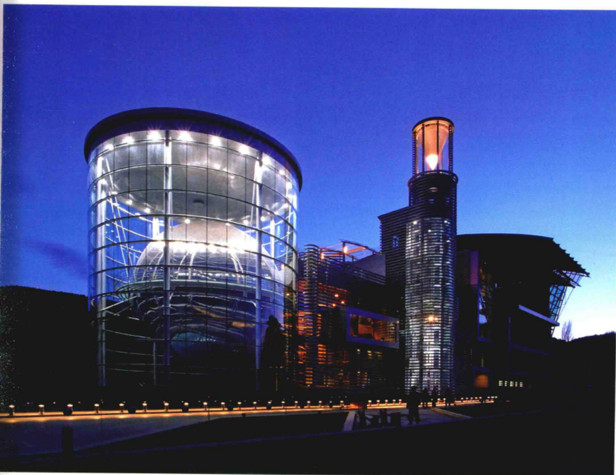
Photo: Shin Takamatsu + Shin Takamatsu Architect and Associates Co., Ltd.