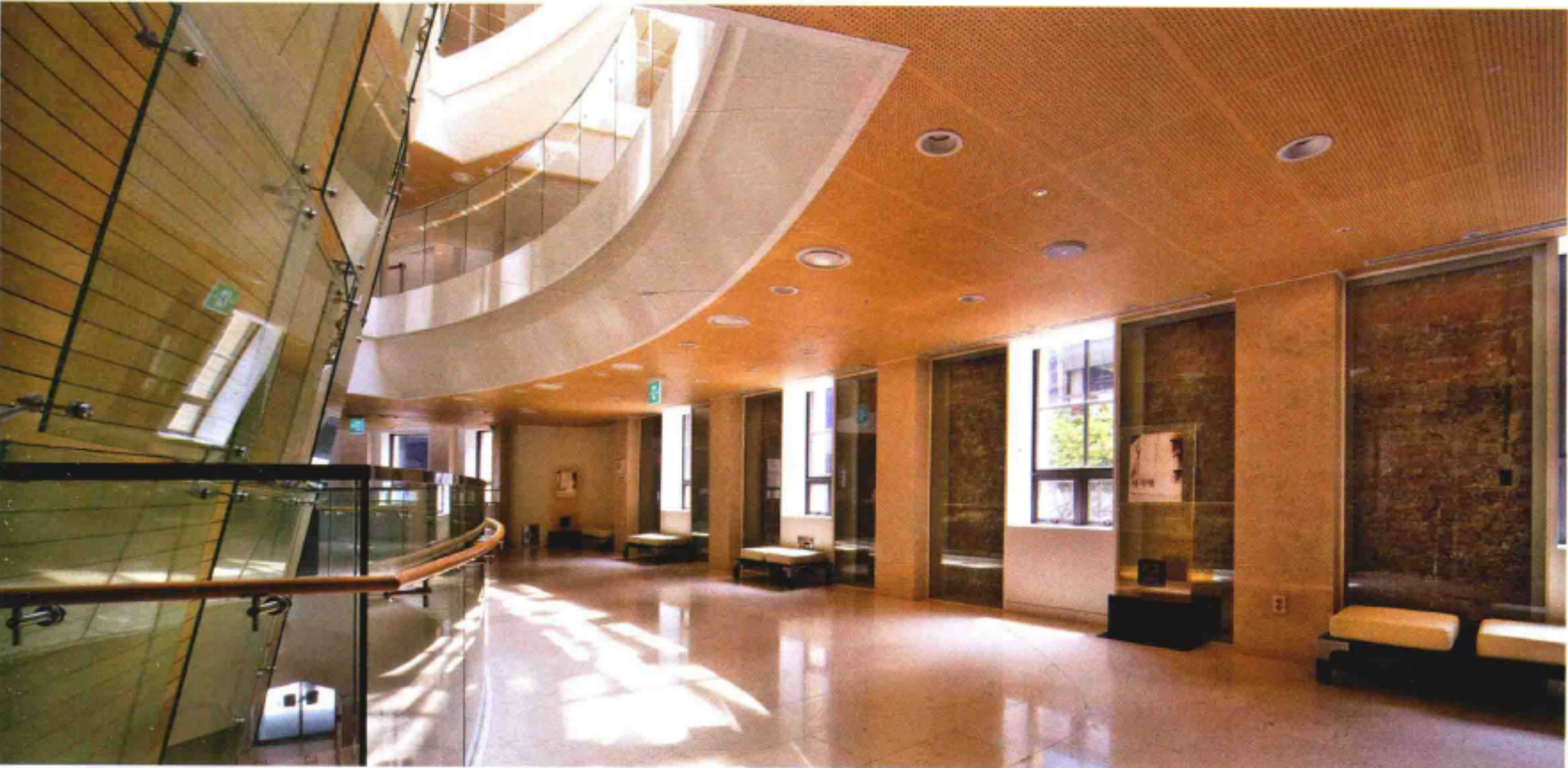
2层大厅，展示着保存下来的墙牌 2F Hall with showcase for preserved past wall