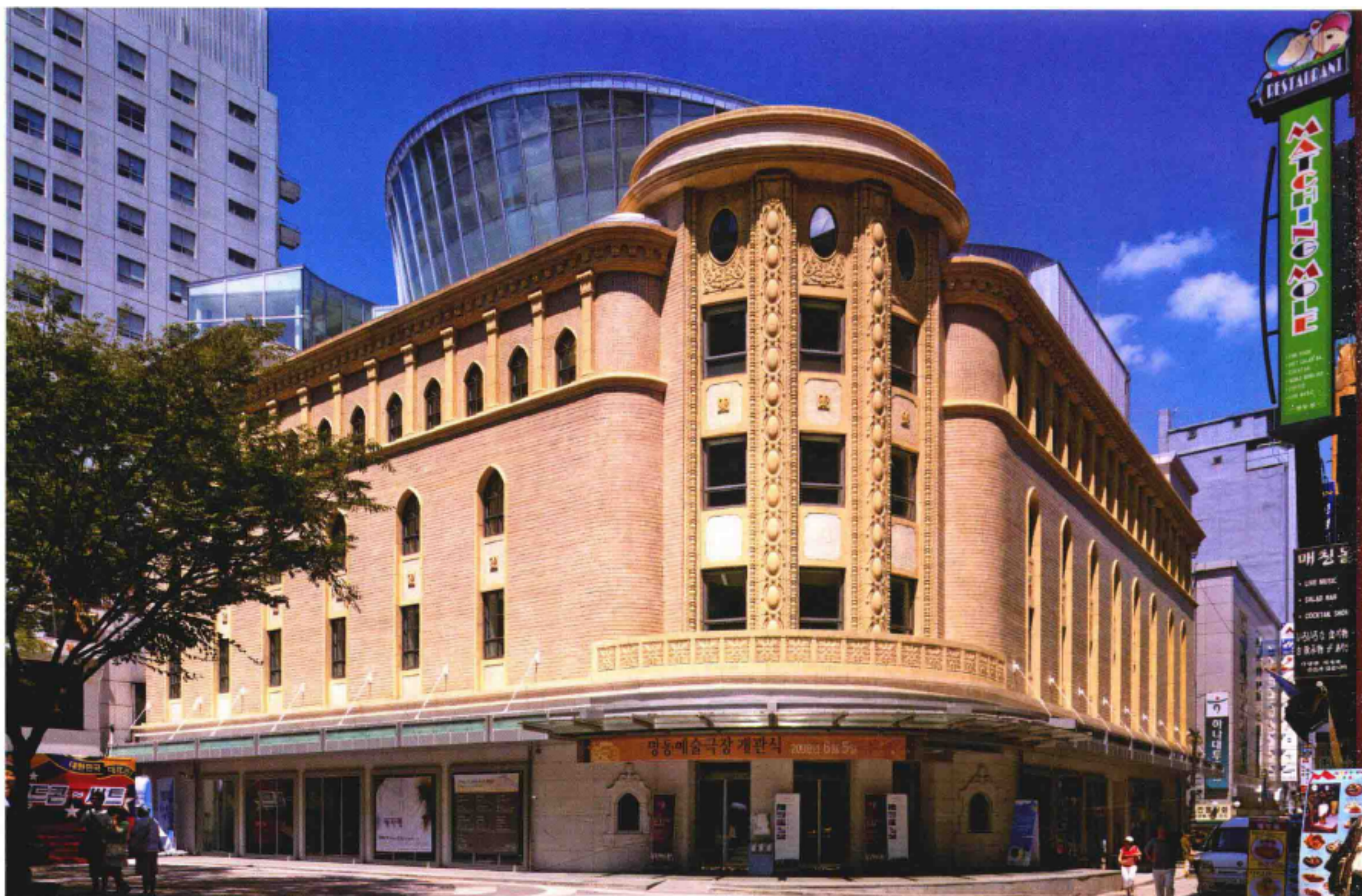
Daytime view from the street 日间街景