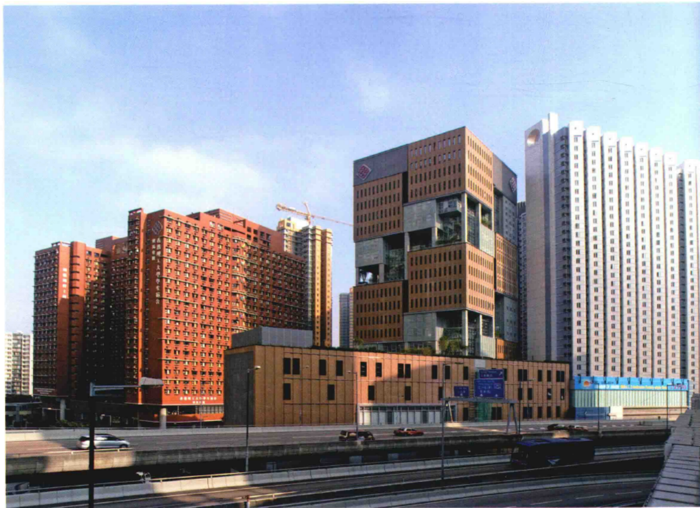
Distant view 远景

空中花园式设计的亮点之一。从建筑的外面就可以看到空中花园，这一特征使其独树一帜。空中花园便于学生探讨项目，也便于他们休闲集会。在密集的城市网格中，空中花园是难得的观景佳处，可以俯瞰红磡区和相对开放的红磡车站和大剧院。空中花园上种植竹子让阳光透过缝隙射入室内，而一些大型的树木则增添了生动愉悦的气氛。