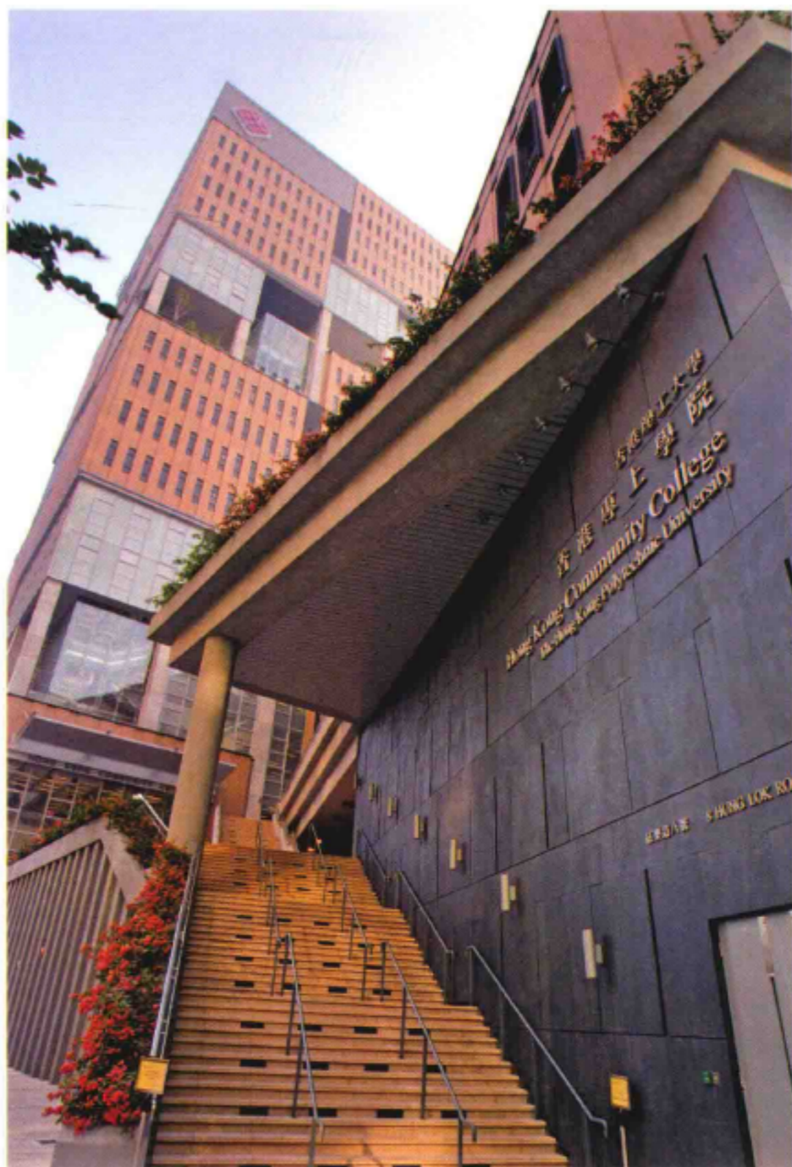
主入口 Main entrance