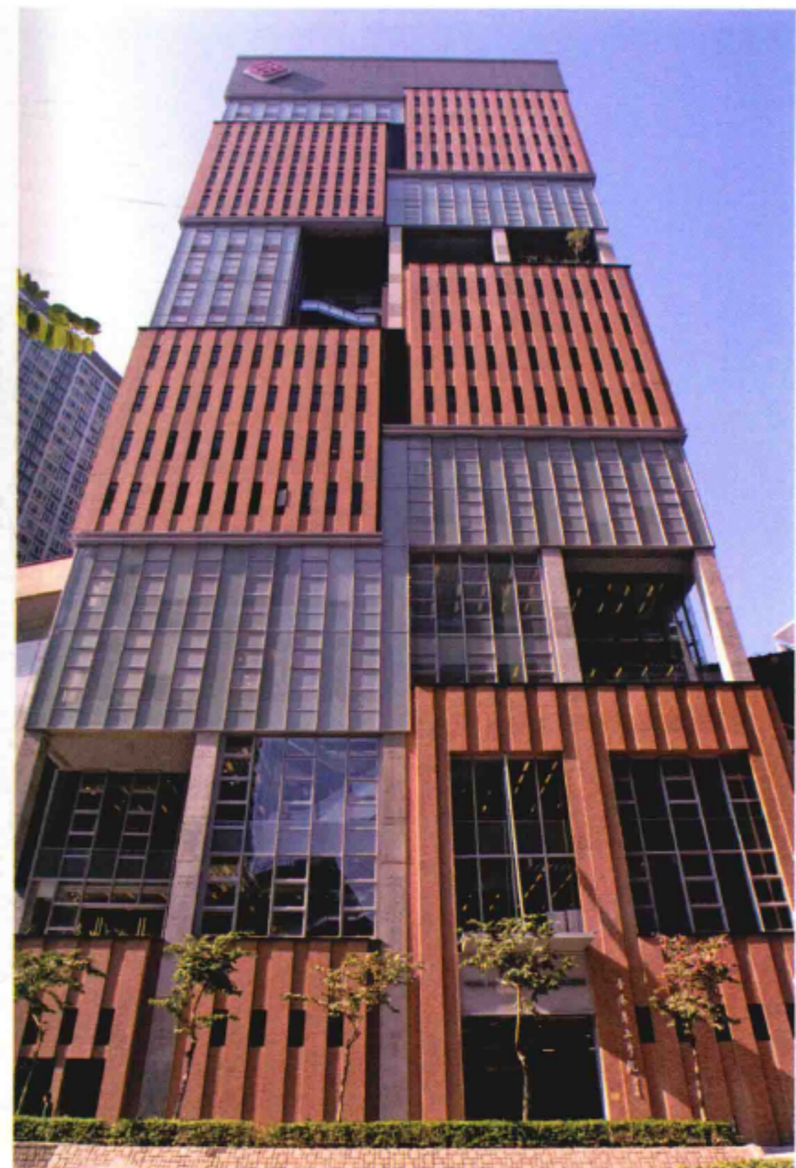
东立面 East elevation