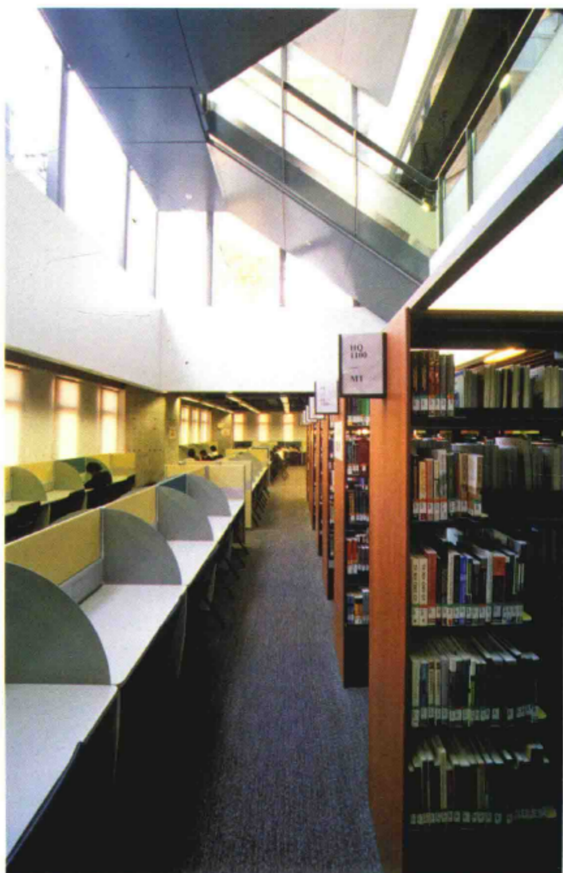
图书馆的自然采光 Natural daylight to library