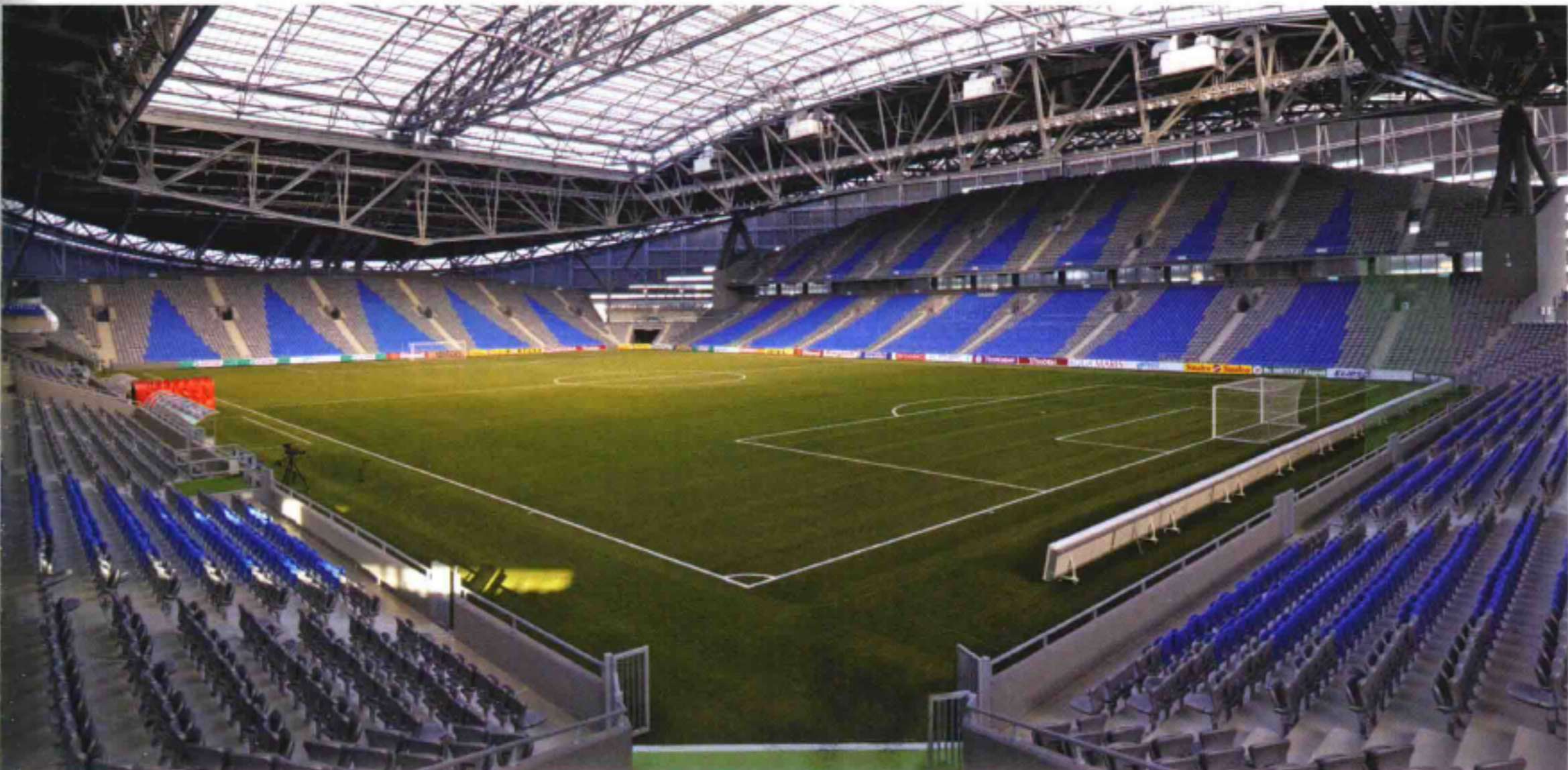
椭圆造型上方的可控制屋顶 Operable roof system over the elliptical outer form