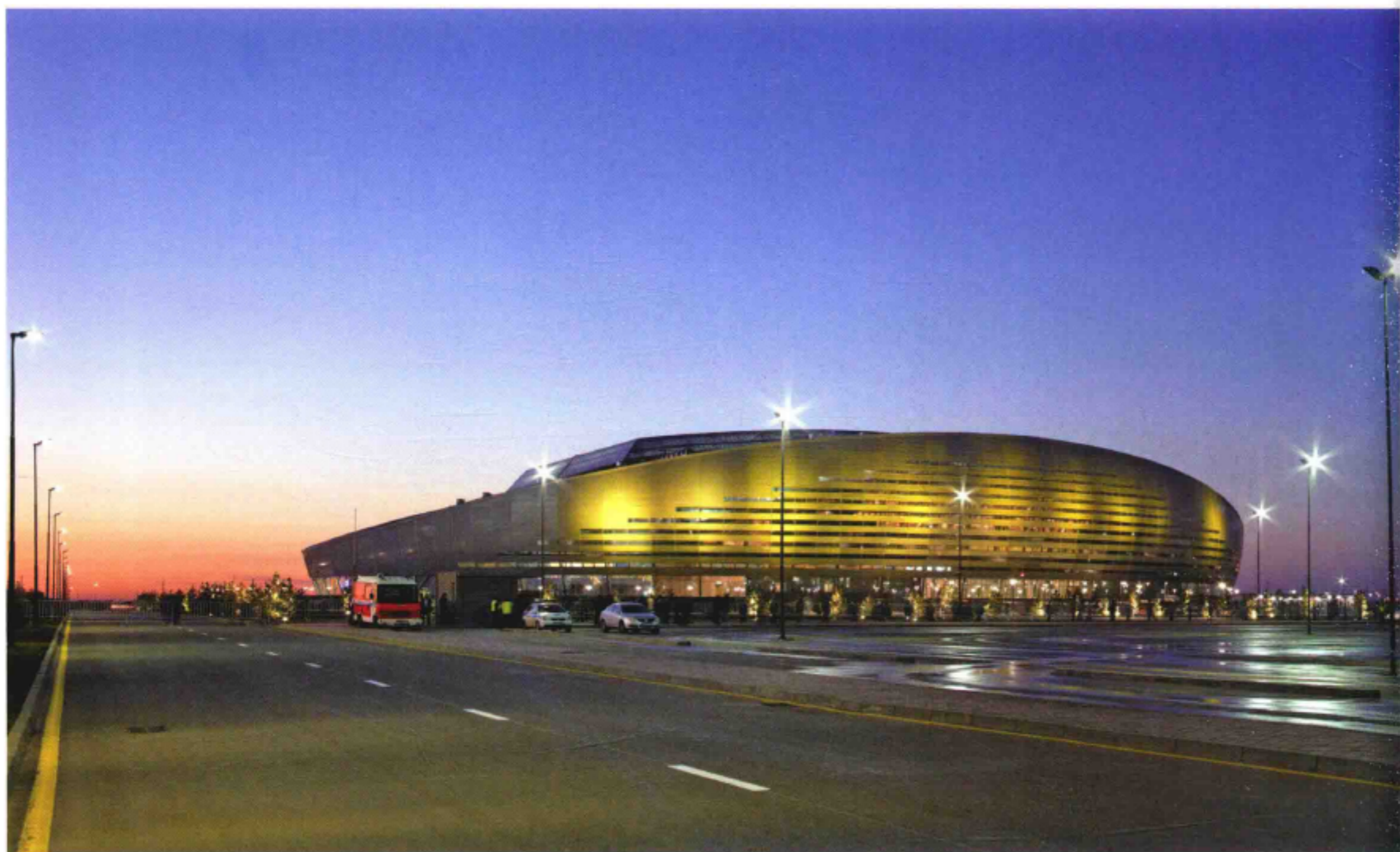
A new scene in Astana tallying with the synergy of sports, games, hospitality, nature and contemporary architecture 体育场是城市的新景观，这个现代建筑融合了比赛、运动、服务业、自然