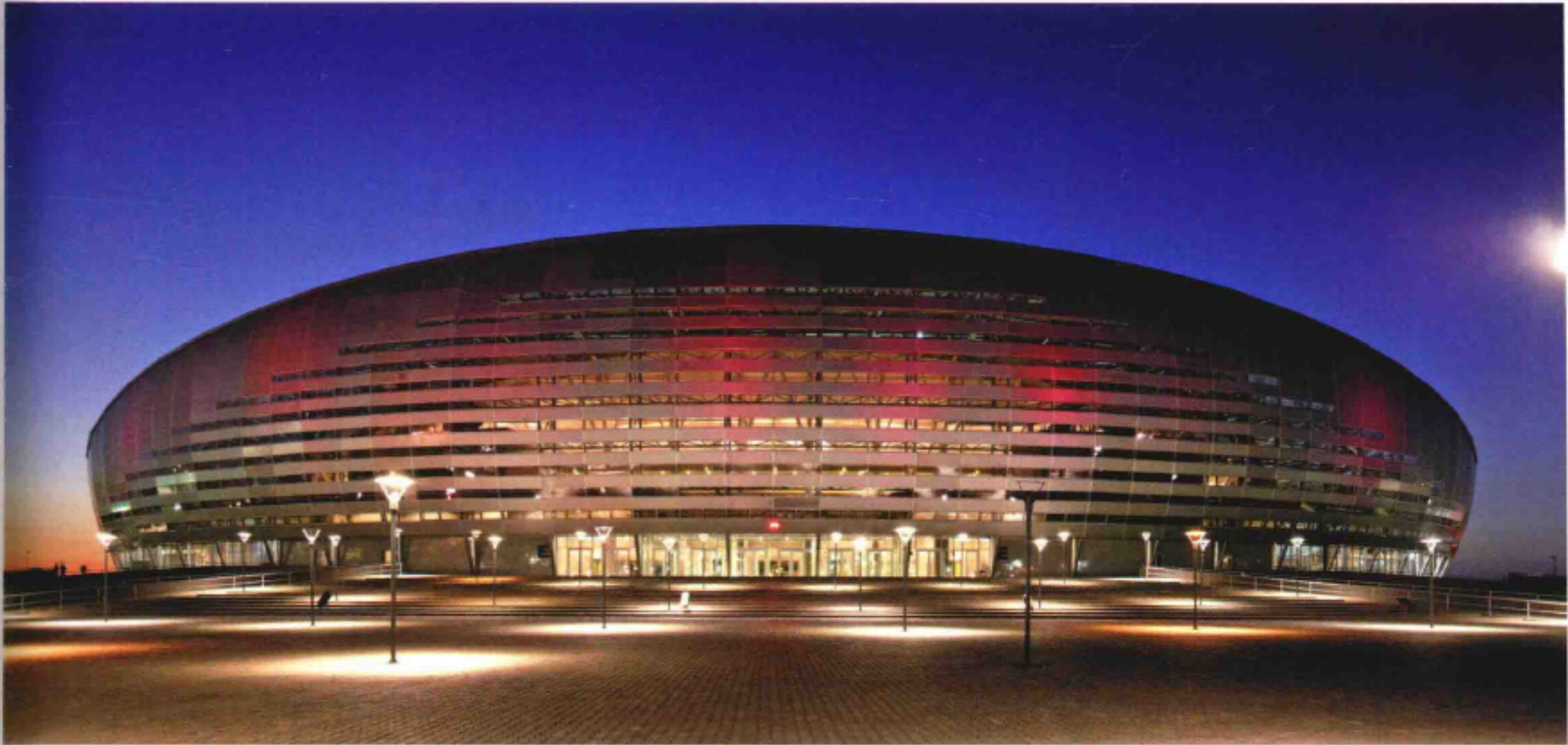
建筑反映了哈萨克斯坦新首都的现代化特征 A symbolic building that reflects the contemporary aspects of the new capital of Kazakhstan