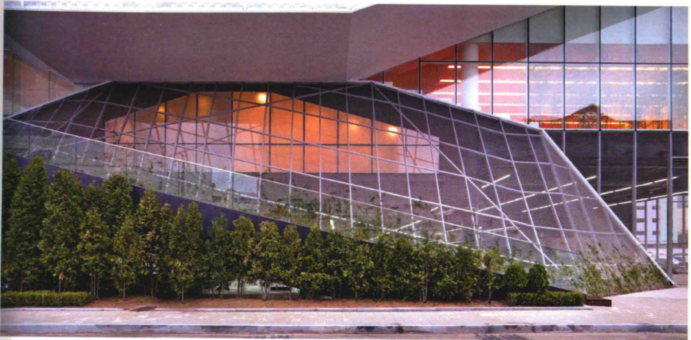
建筑正面 Building front