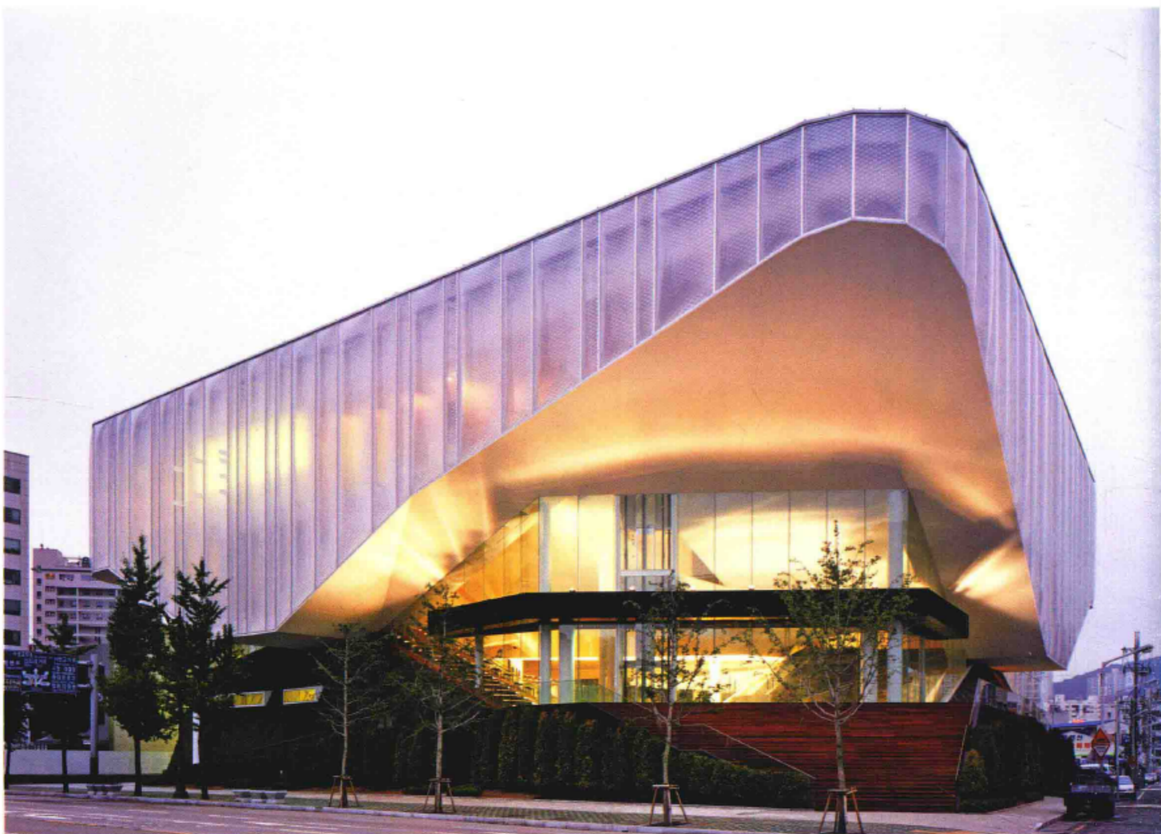
Night view 夜景