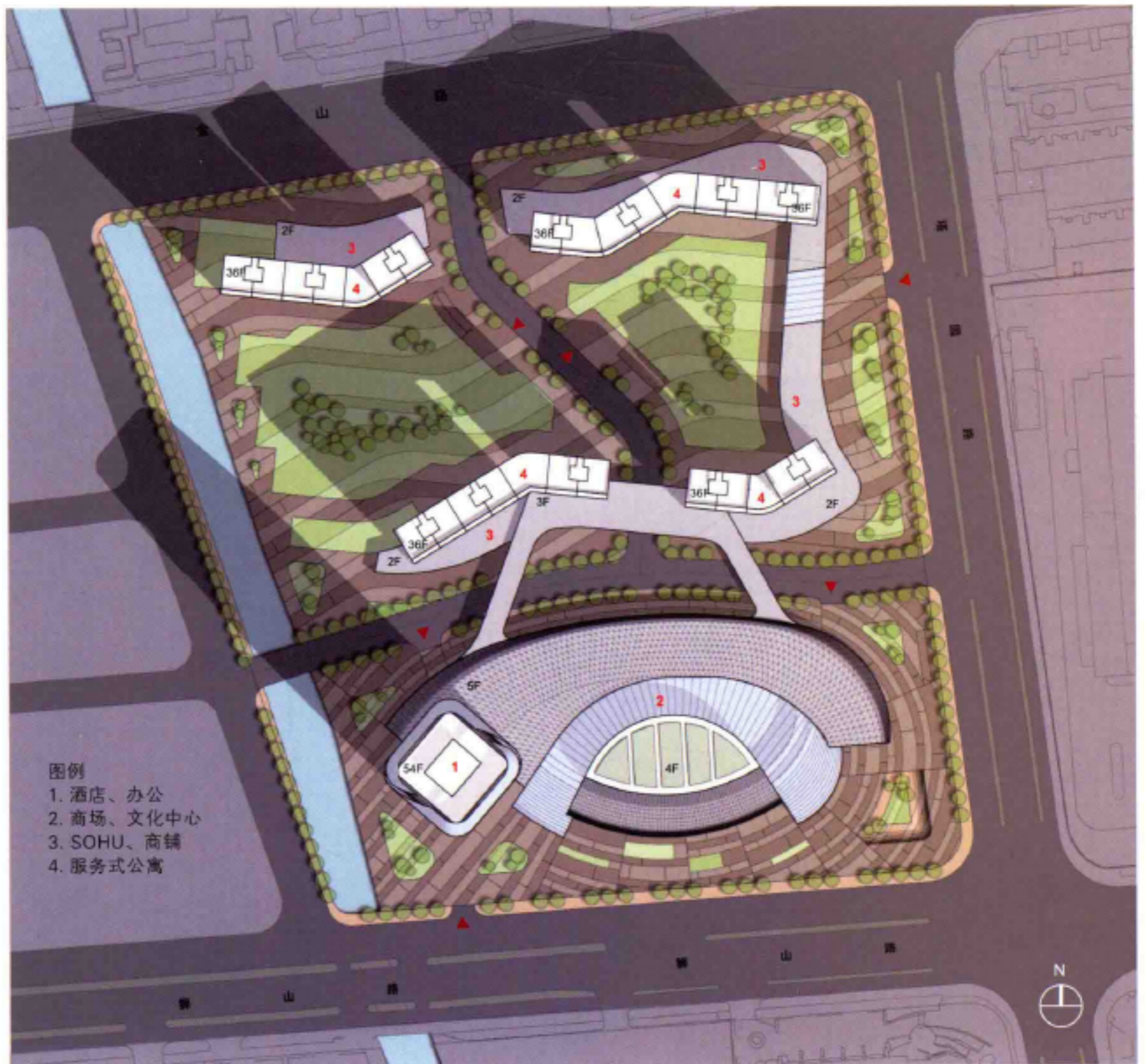
Site Plan 总平面图