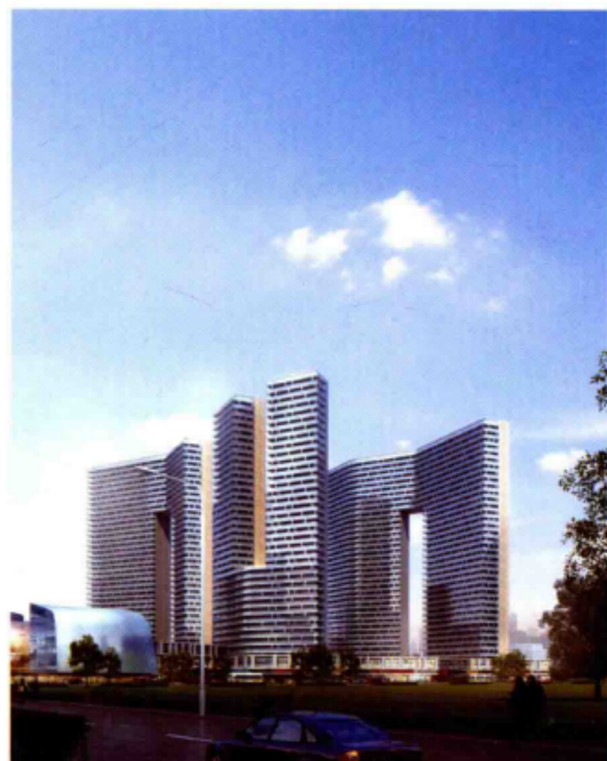
Soho Typical Floor Plan 服务式公寓标准平面图