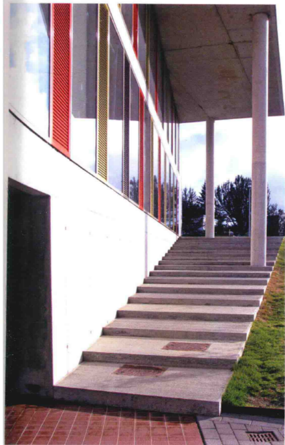
南面的台阶坡道和半盖 Stepped ramp and canopy on south side