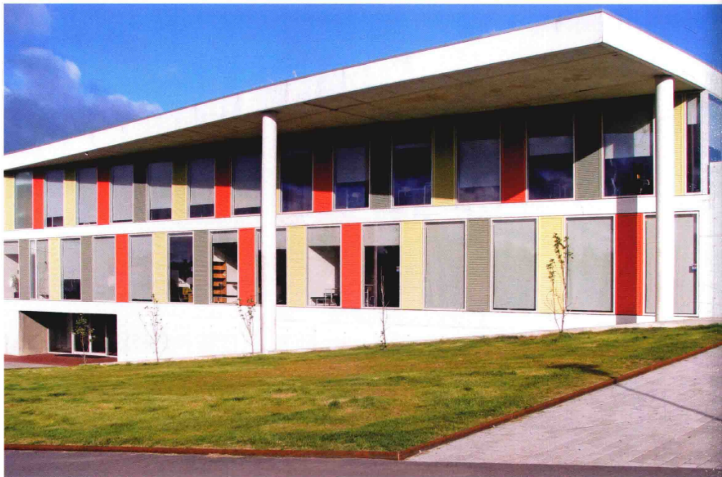
Stepped ramp and canopy on south side 南侧的台阶坡道和半盖