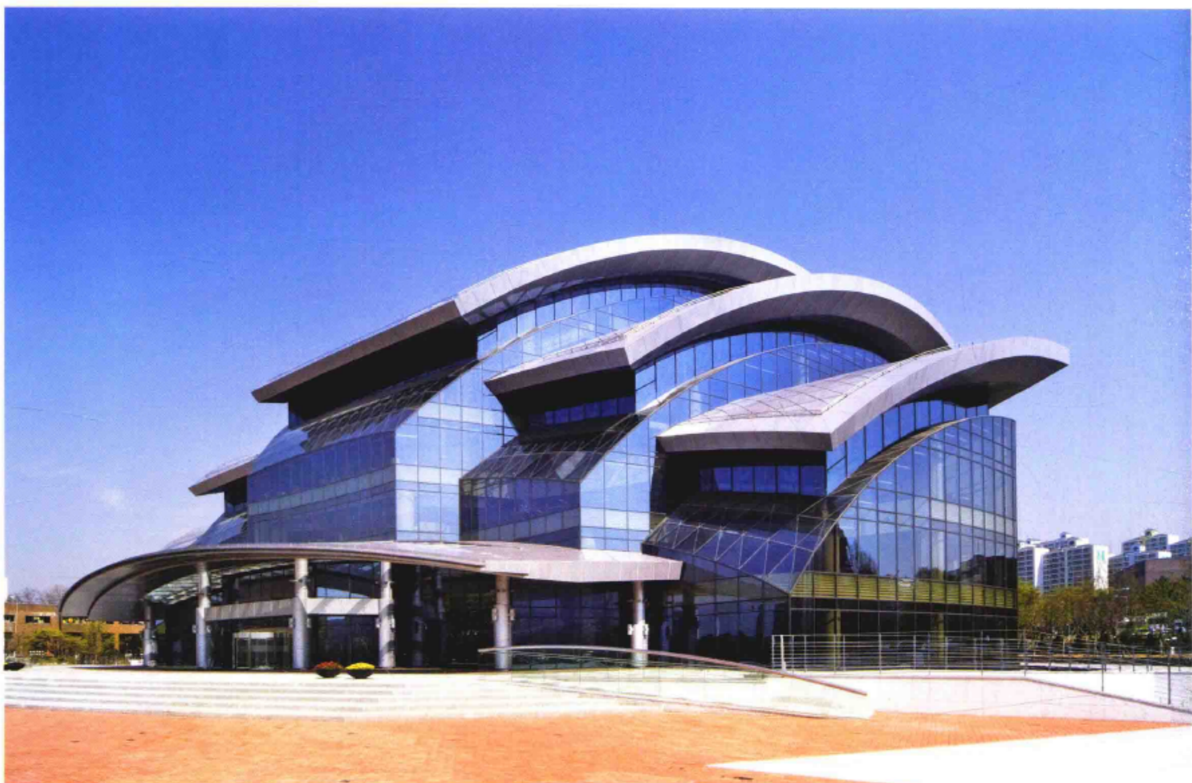
Daytime view 日间全景