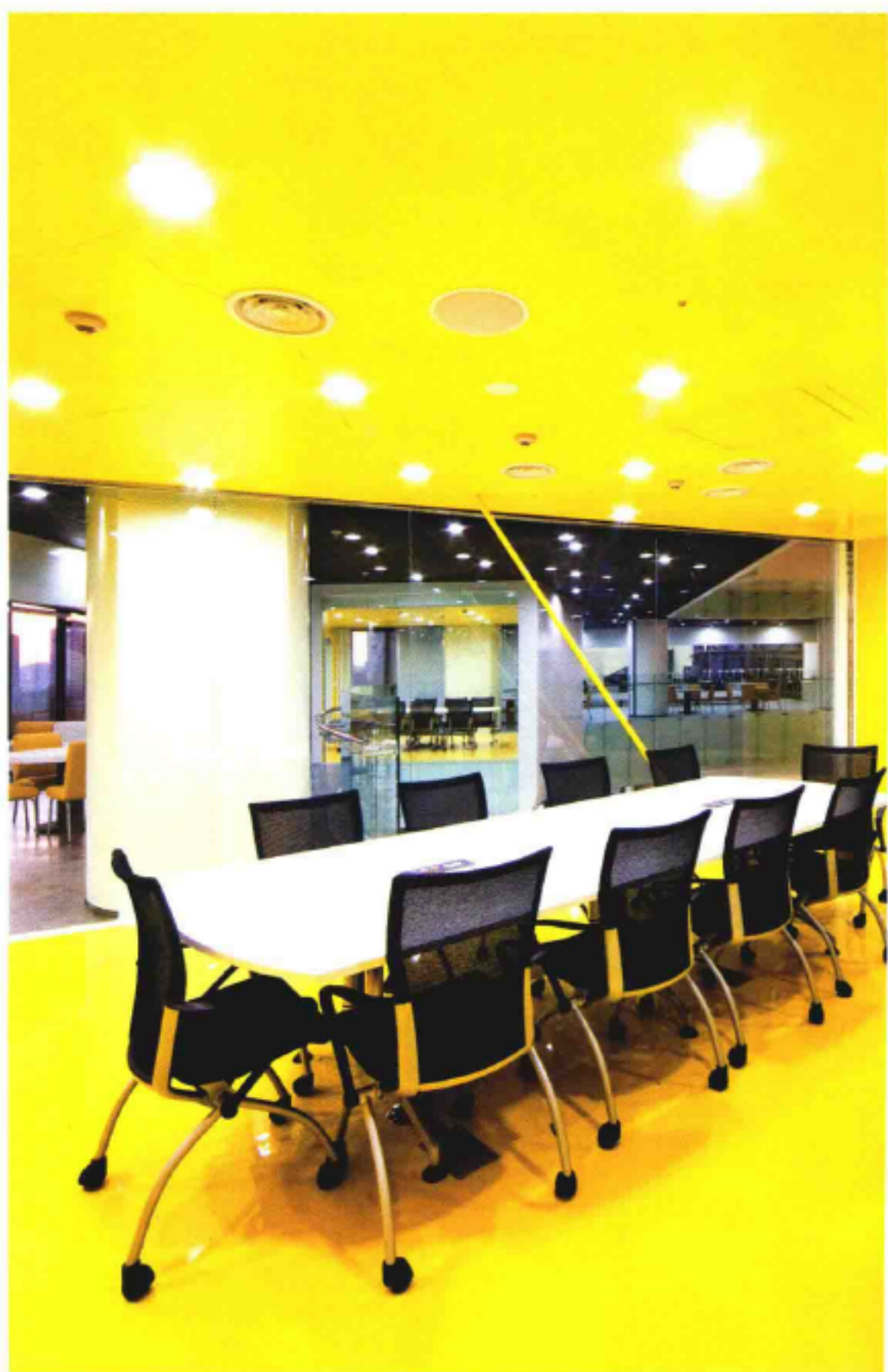
会议室 Meeting room