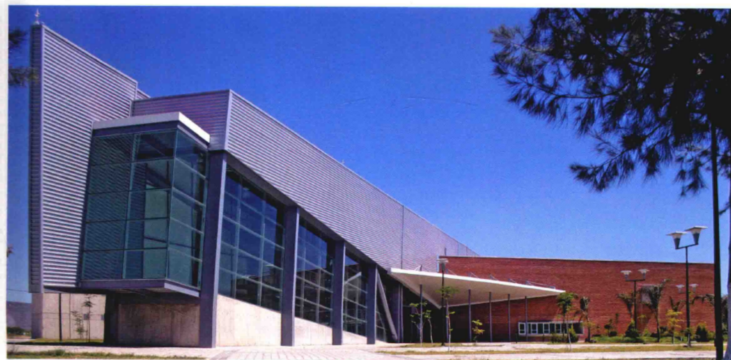
从广场看建筑正真 Main façade from plaza