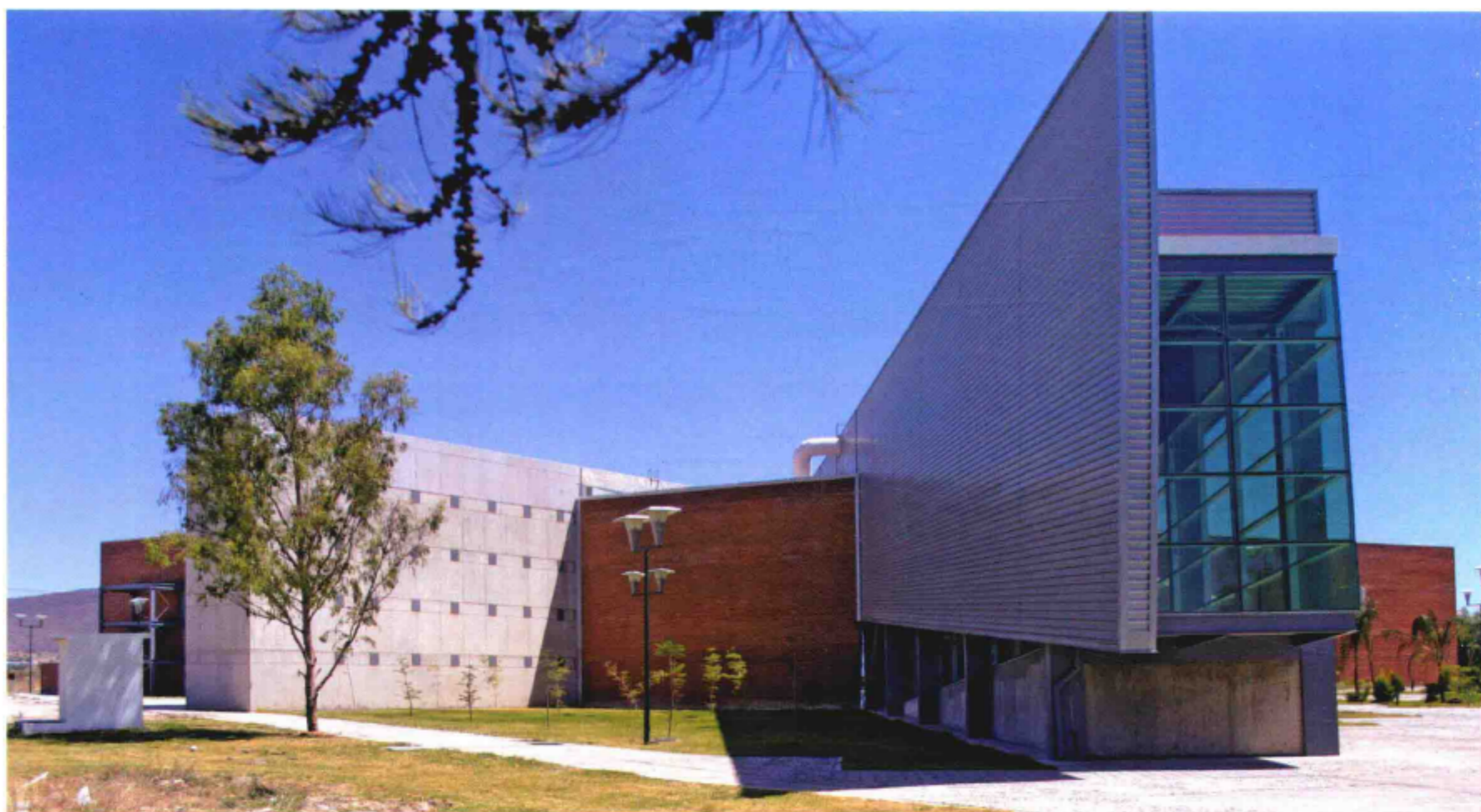
General view 建筑外观

项目计划以极少的预算建造一座功能齐全的建筑。大楼共分为三个部分，每一部分都采用了不同的材料，以增加各个部分的辨识度。阅读区采用了红砖结构，朝向北面开放，既可以获得最佳照明，又避免了阳光直射。藏书区采用了混凝土结构，从外面看，是一个全封闭的“盒子”。媒体中心采用了金属结构，运用了最先进的金属外墙和隔离技术。