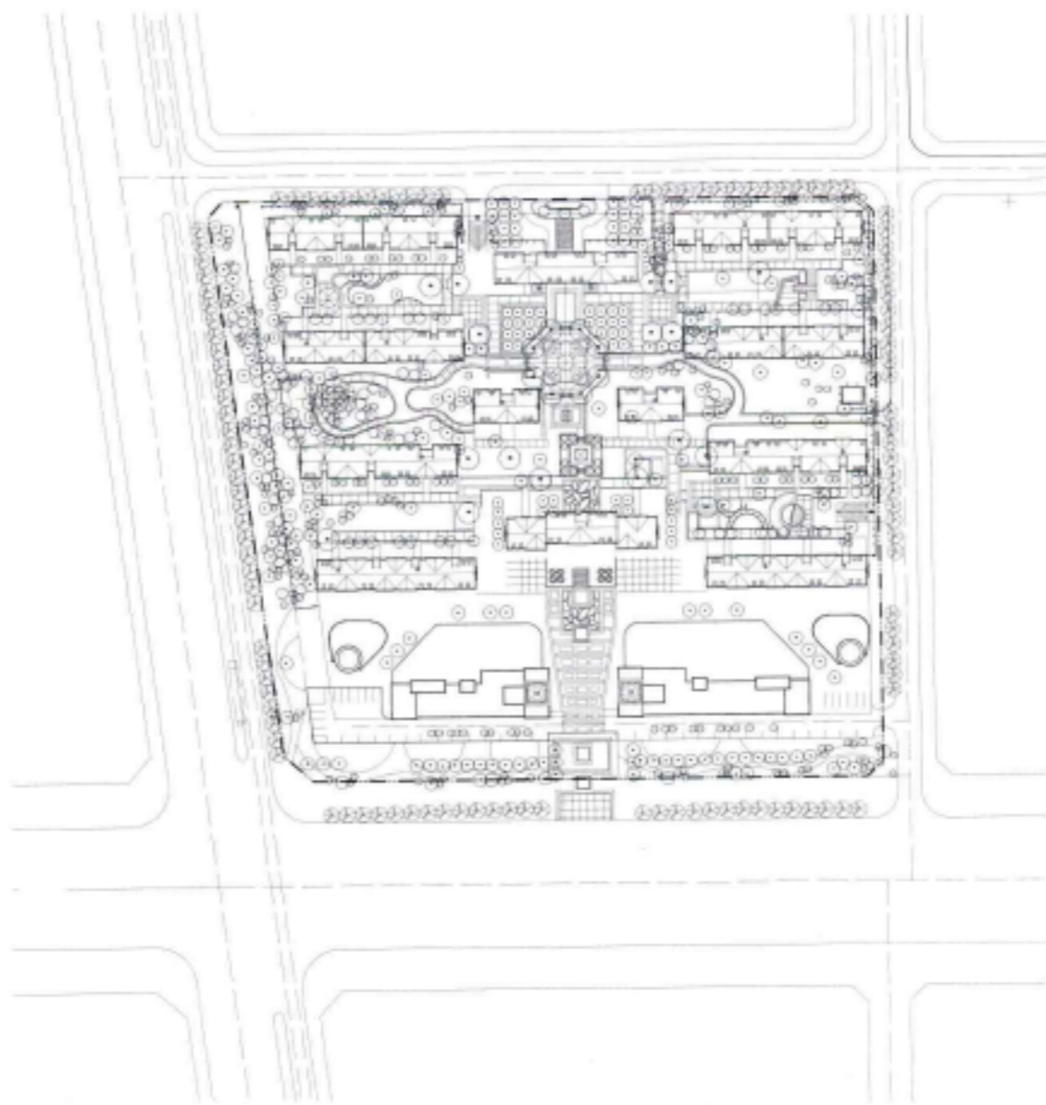
above site plan/总平面图 right architectural photo/建筑实景照图

Impression of Ying Lake, located in Changchun City of Jilin Province, spreads to West Ring Road at east, Guihua Road at south, planned site at west and Jingyang Road at north. The project is adjacent to Jingyang Road and West Ring Road, which are two trunk roads connecting the downtown area. Jingyang Road, a main transportation link, passes through urban hub from south to north and is called by Changchun citizens as "the Second Renmin Avenue", while West Ring Road is an external ring trunk road in Changchun and it is also a main passage connecting the downtown area to the plant of FAW Group.