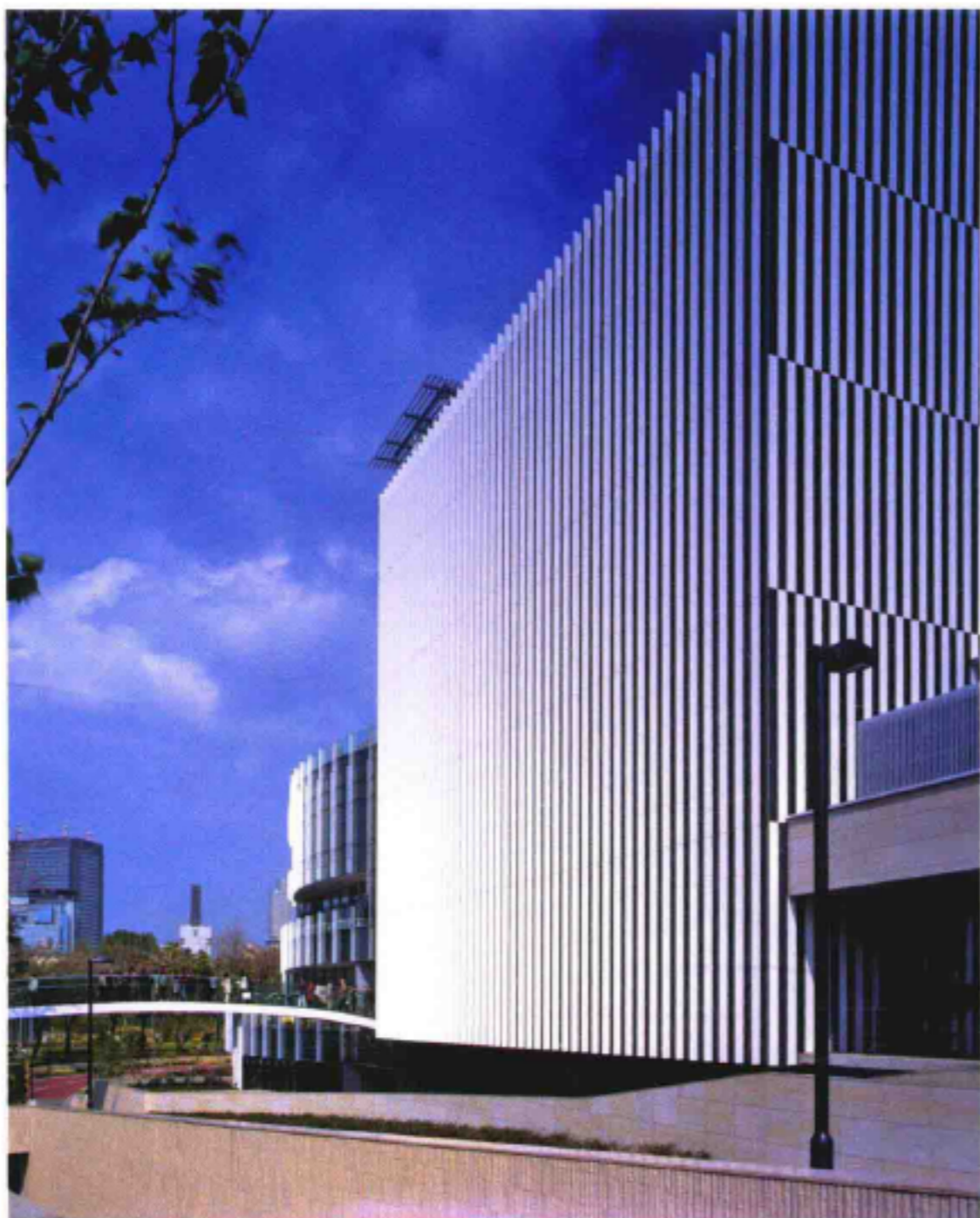
Front façade 建筑正面