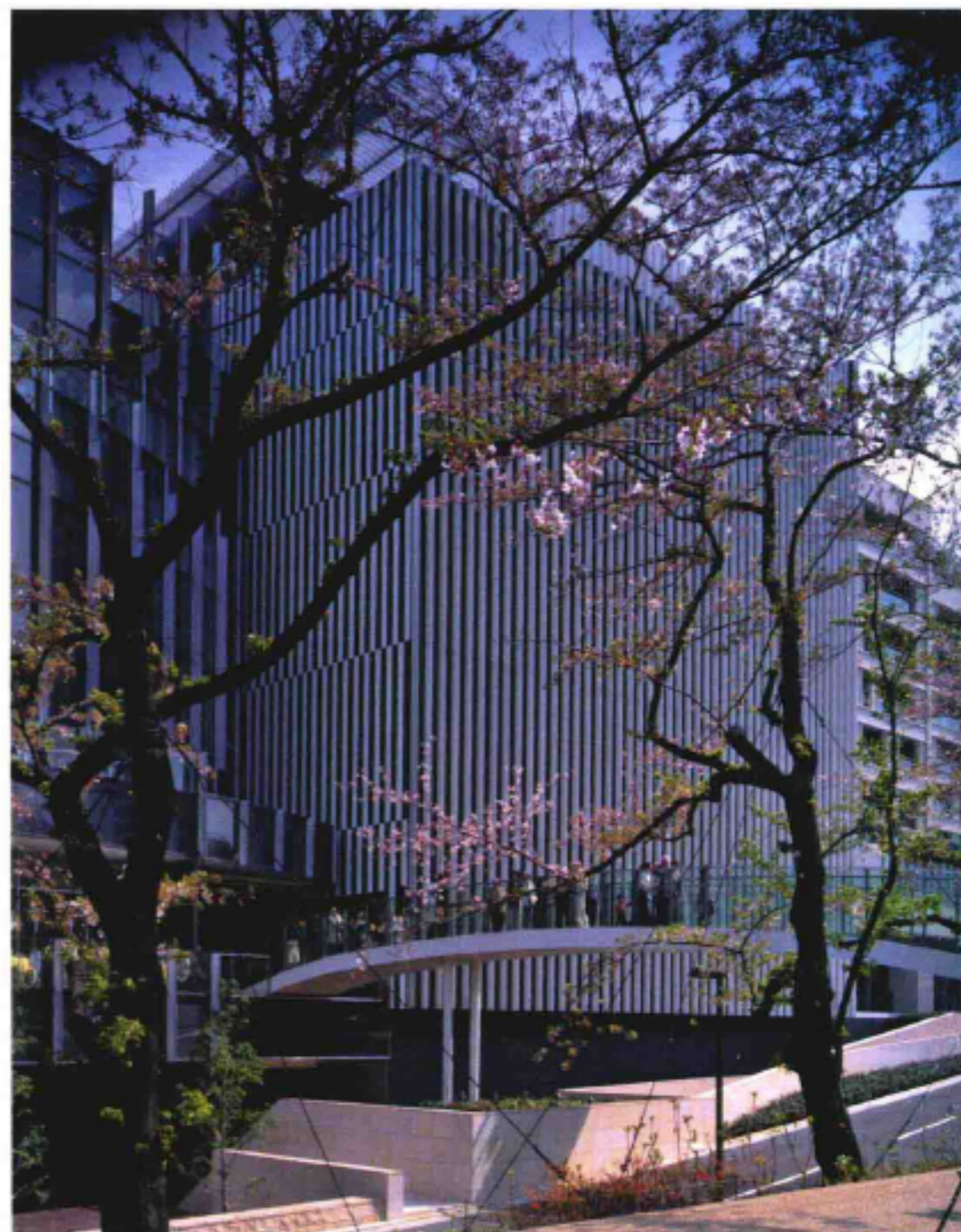
Front façade 建筑正面