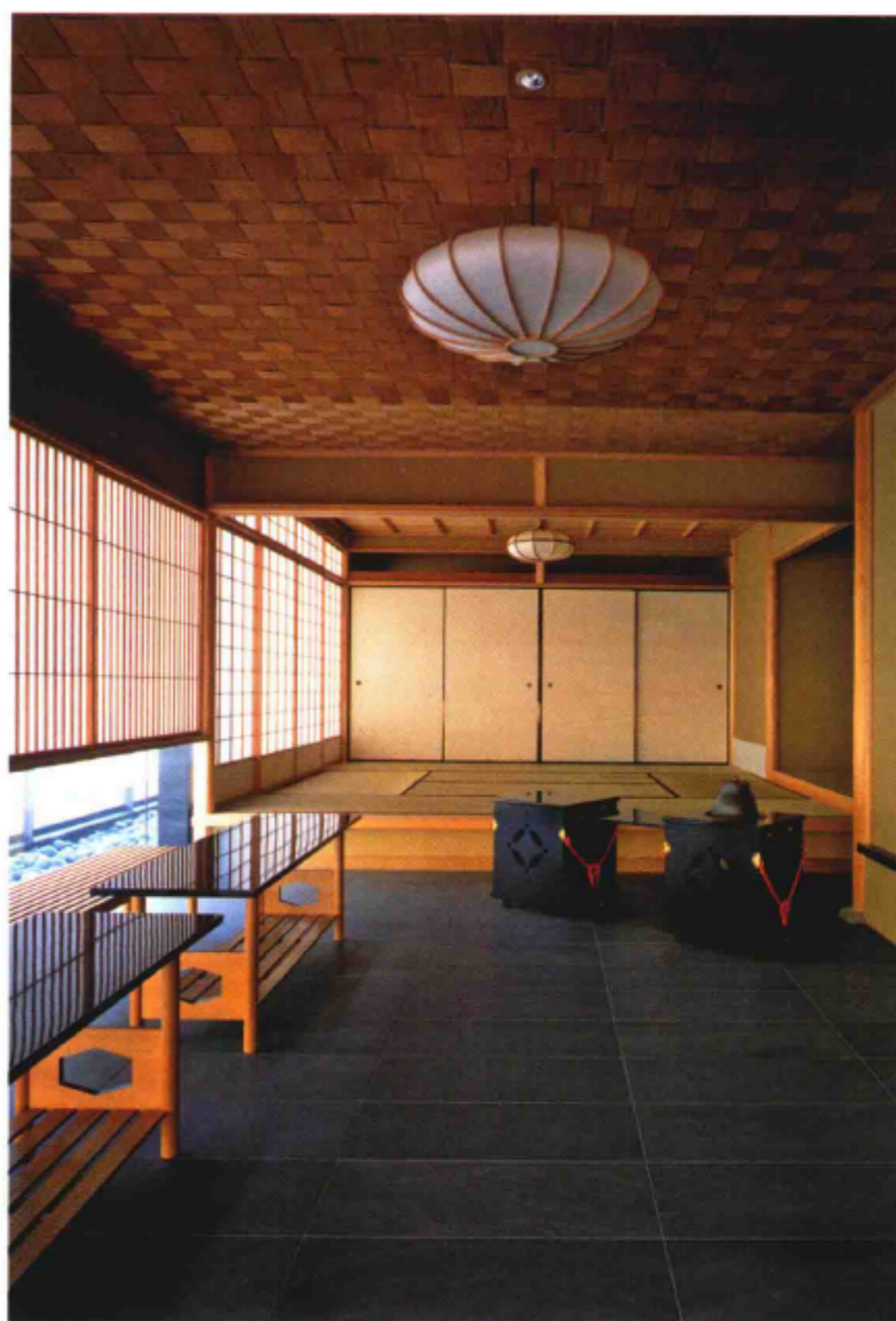
茶室 Tea room