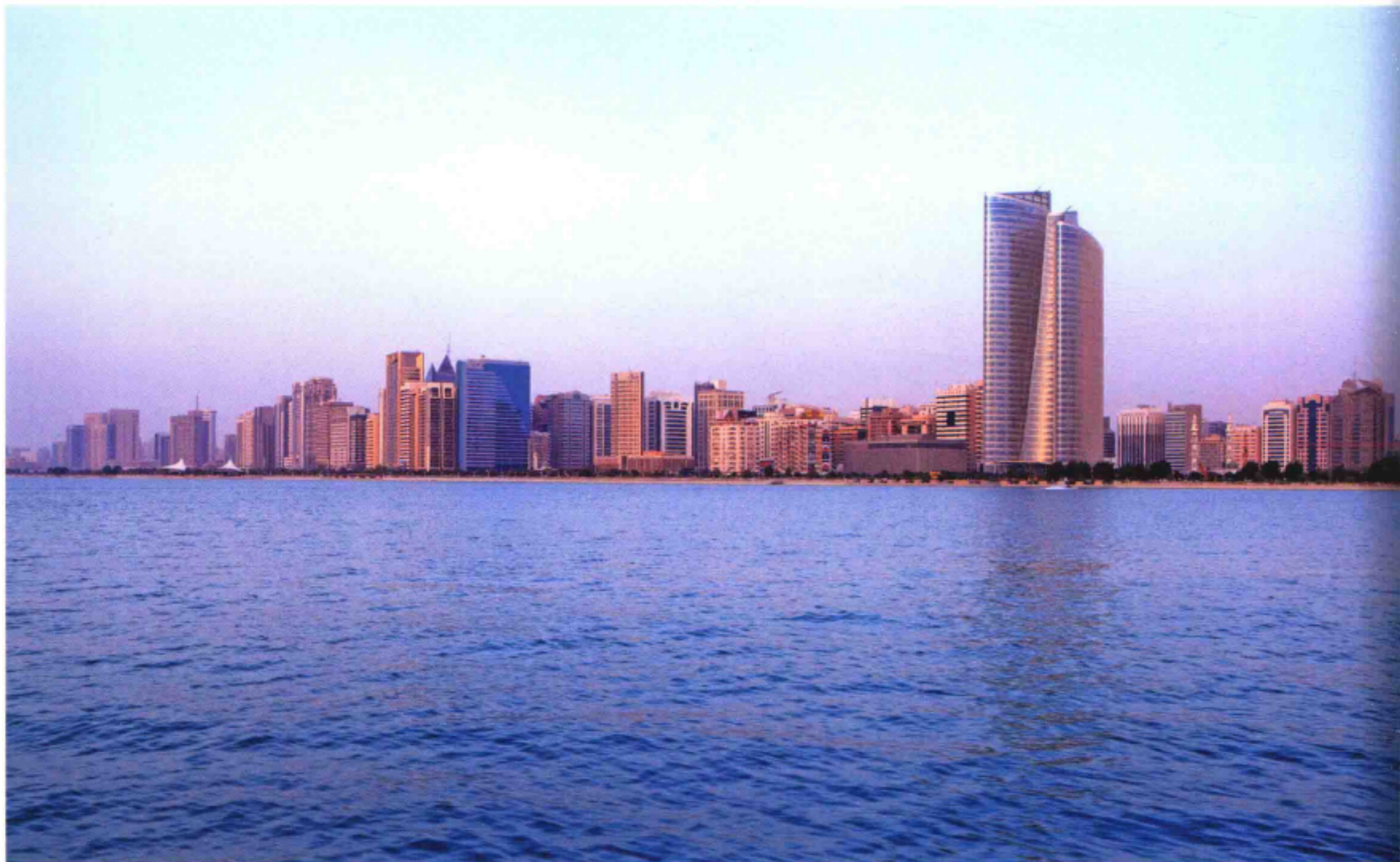
General view 全景图