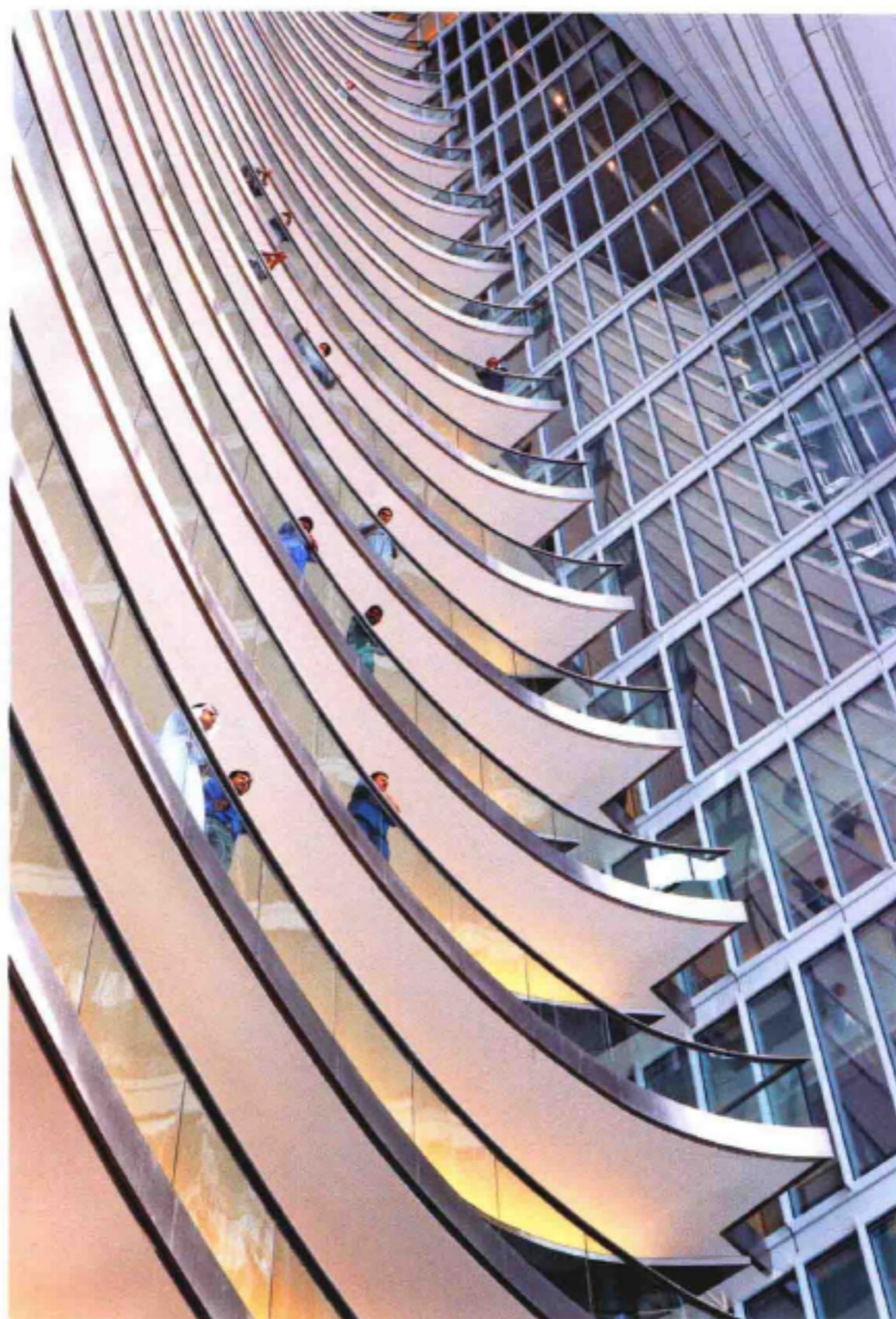
走廊和庭院 Corridor and courtyard