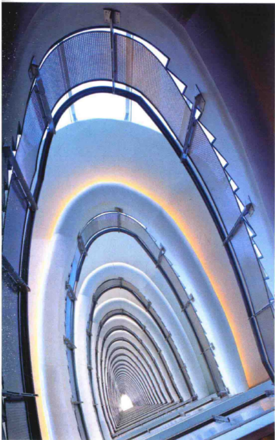
楼梯和庭院 Stairs and courtyard