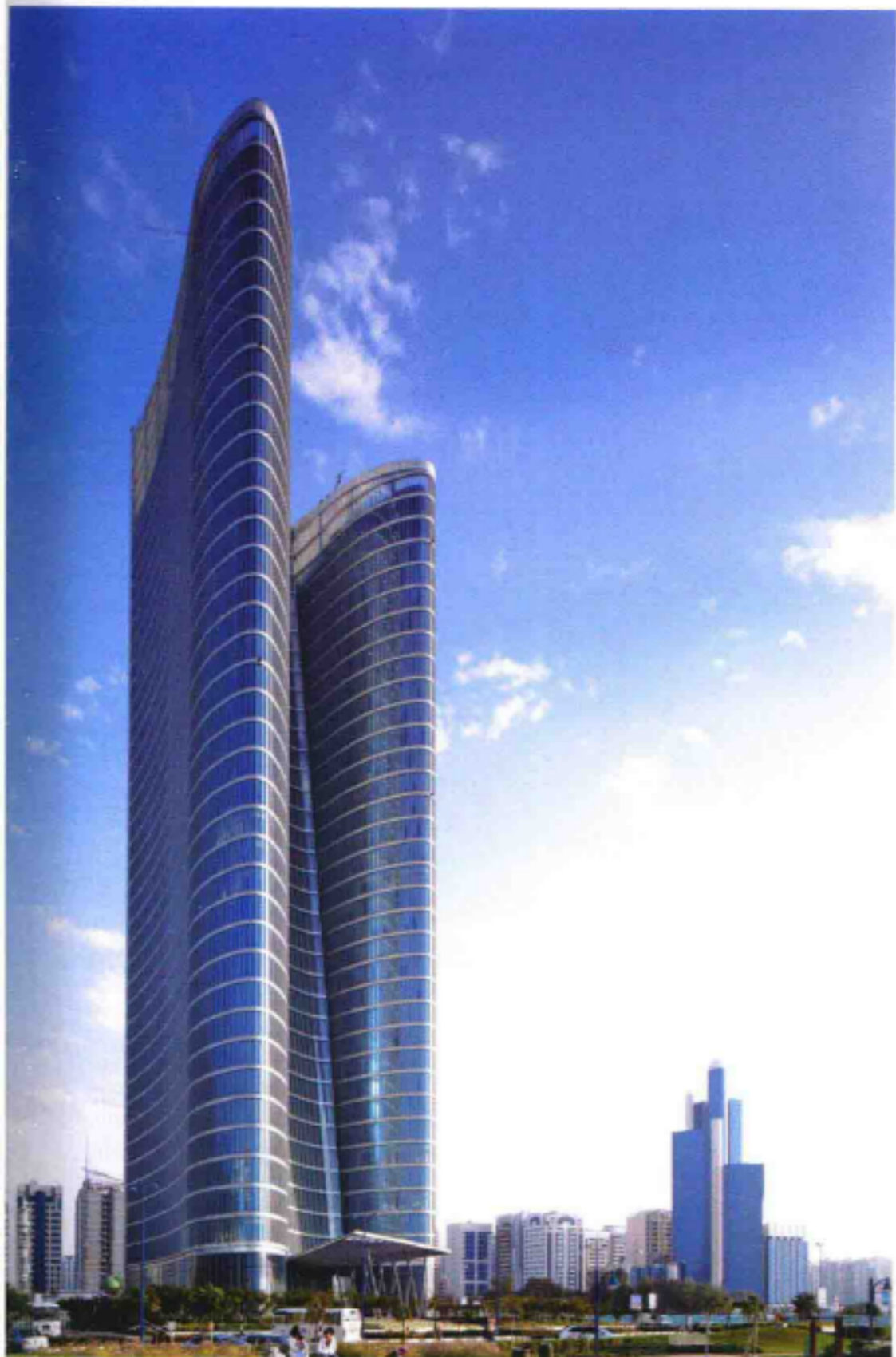
建筑正面 Front view