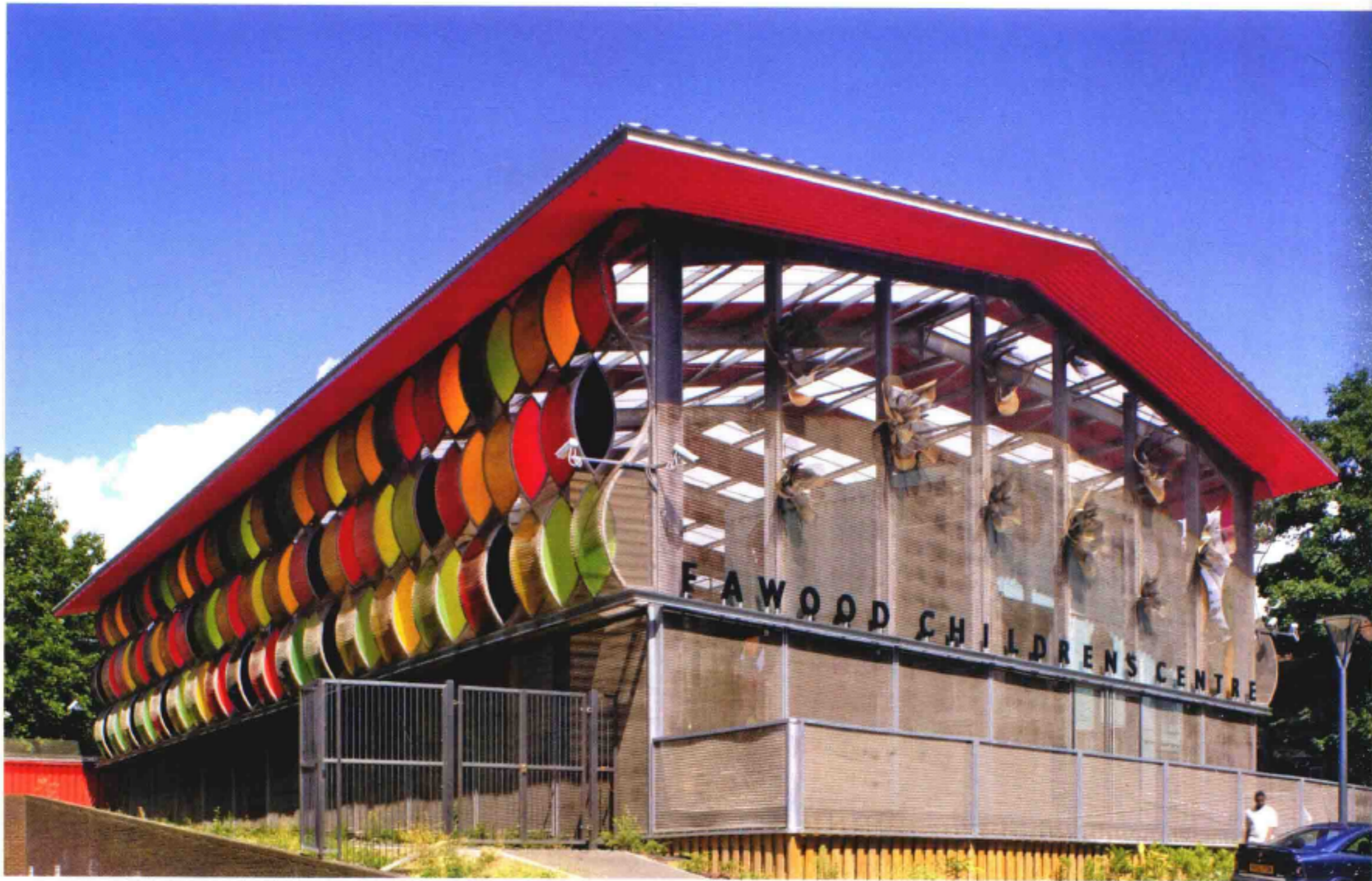
Southwest daytime view 西南日间建筑