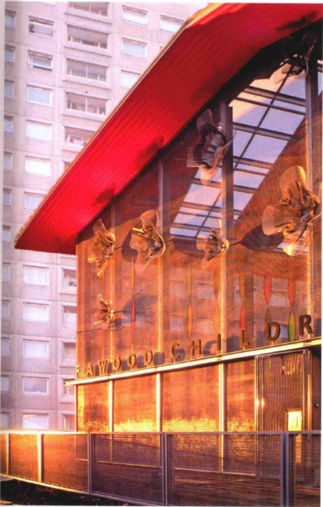
建筑南面 South elevation