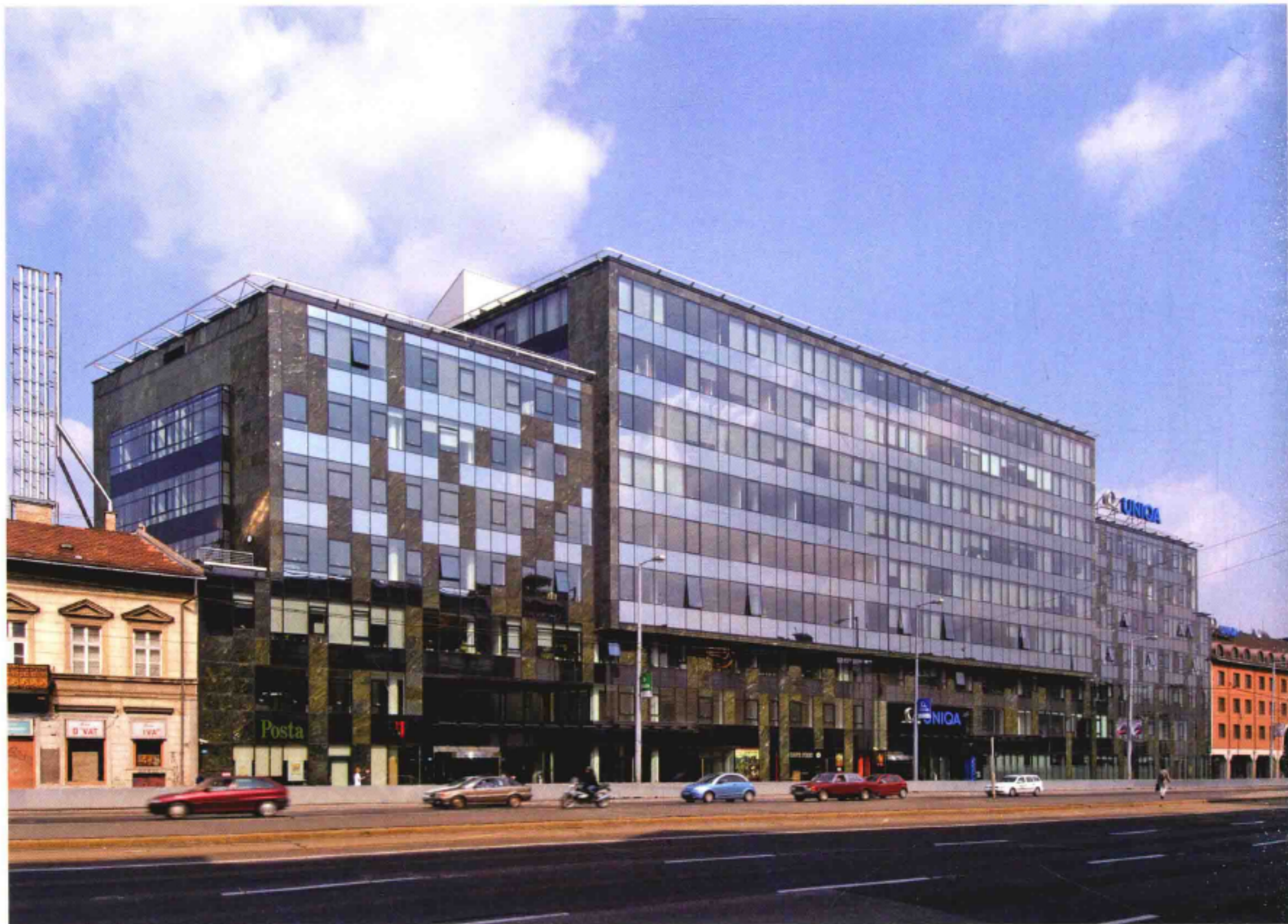
Exterior glass façade 玻璃幕墙