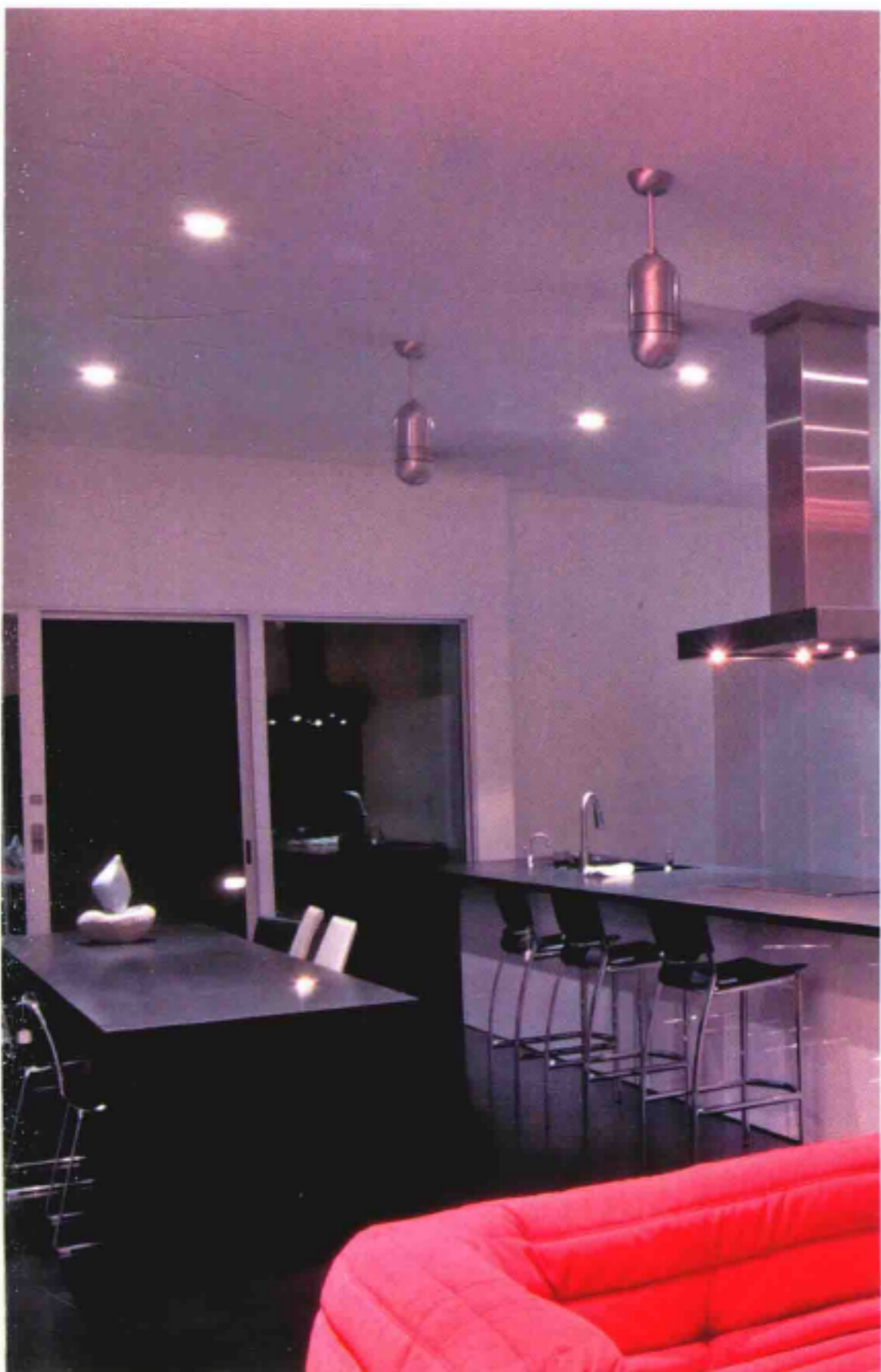
客厅 Living room