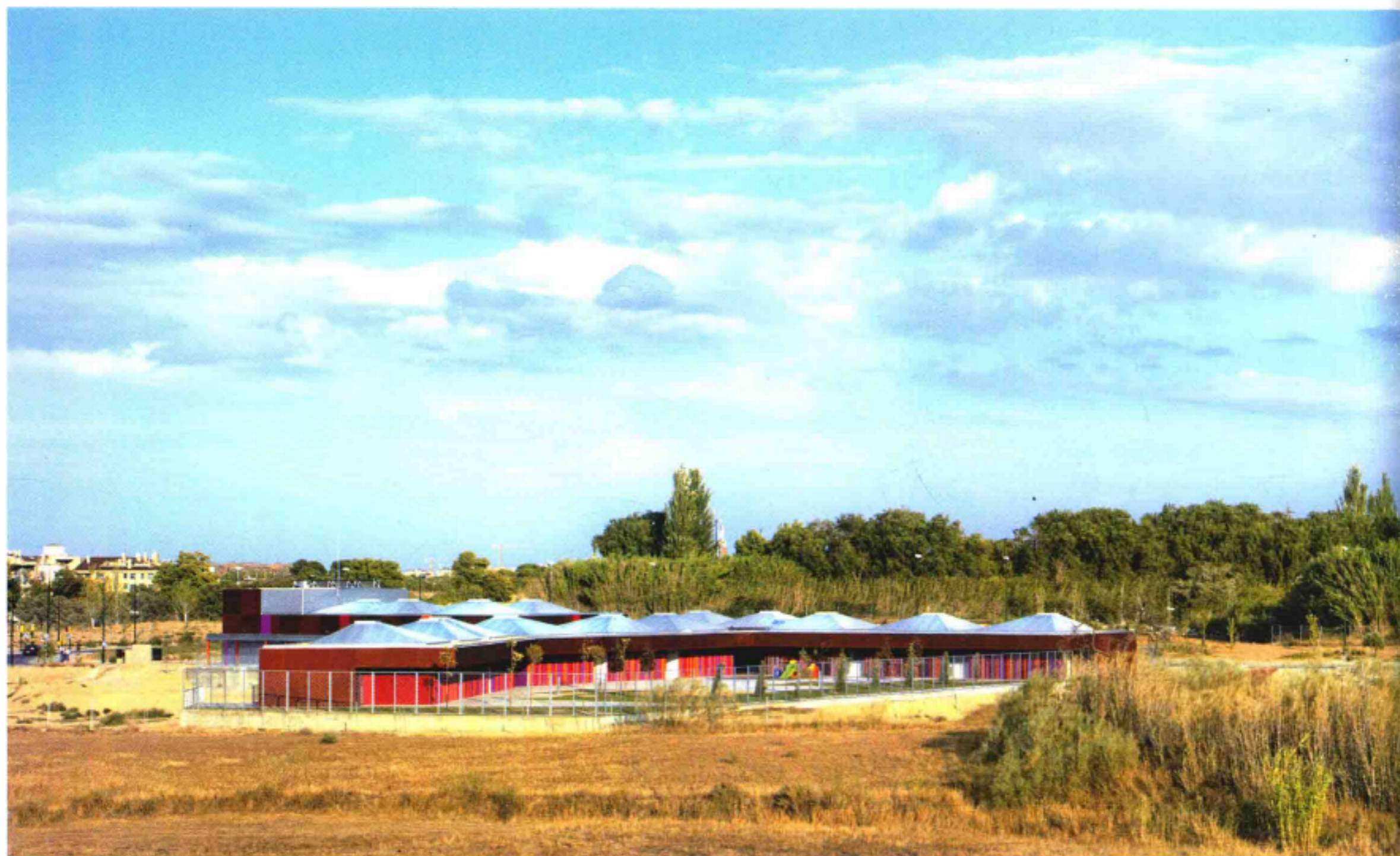
General view 全景图