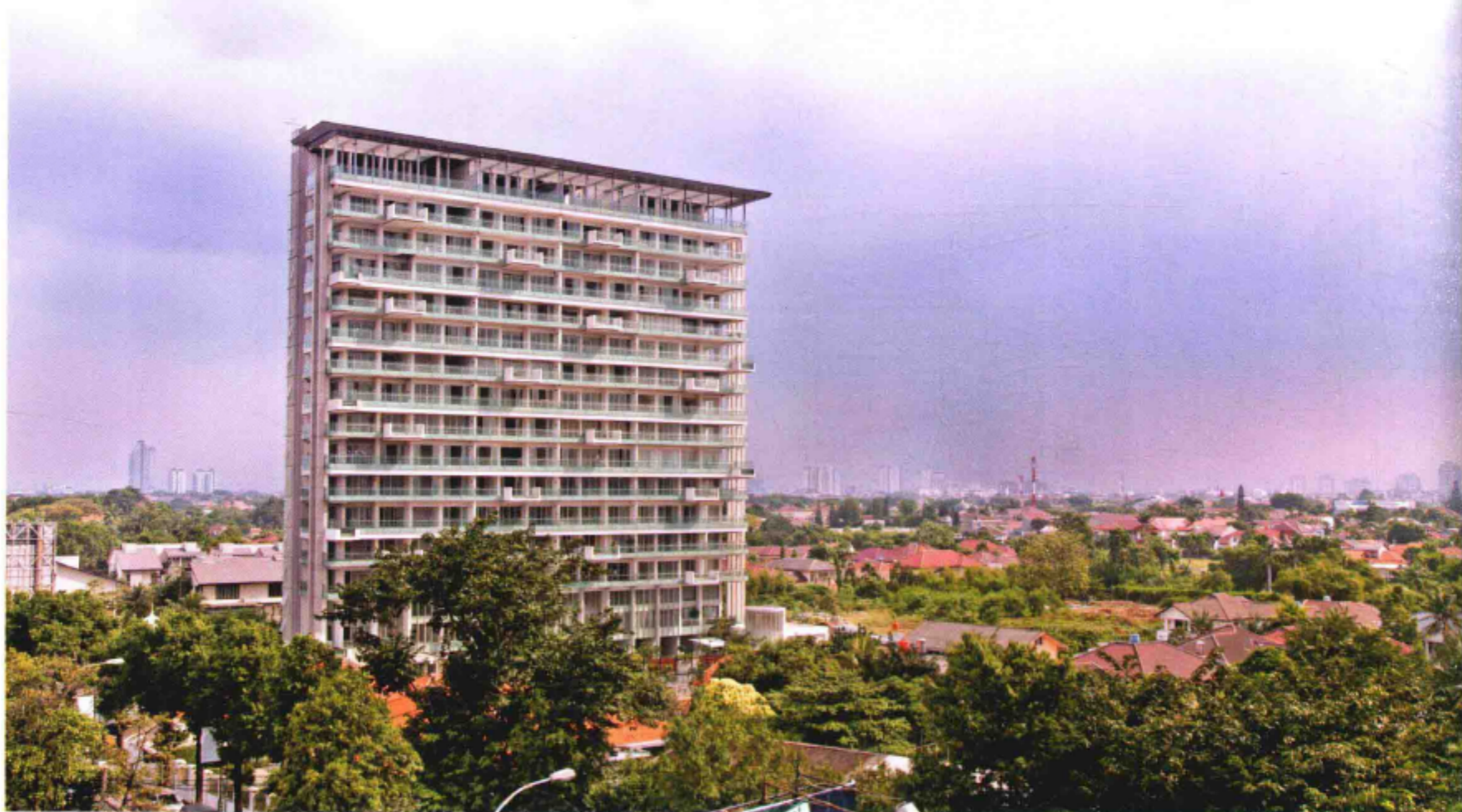
General View 全景图