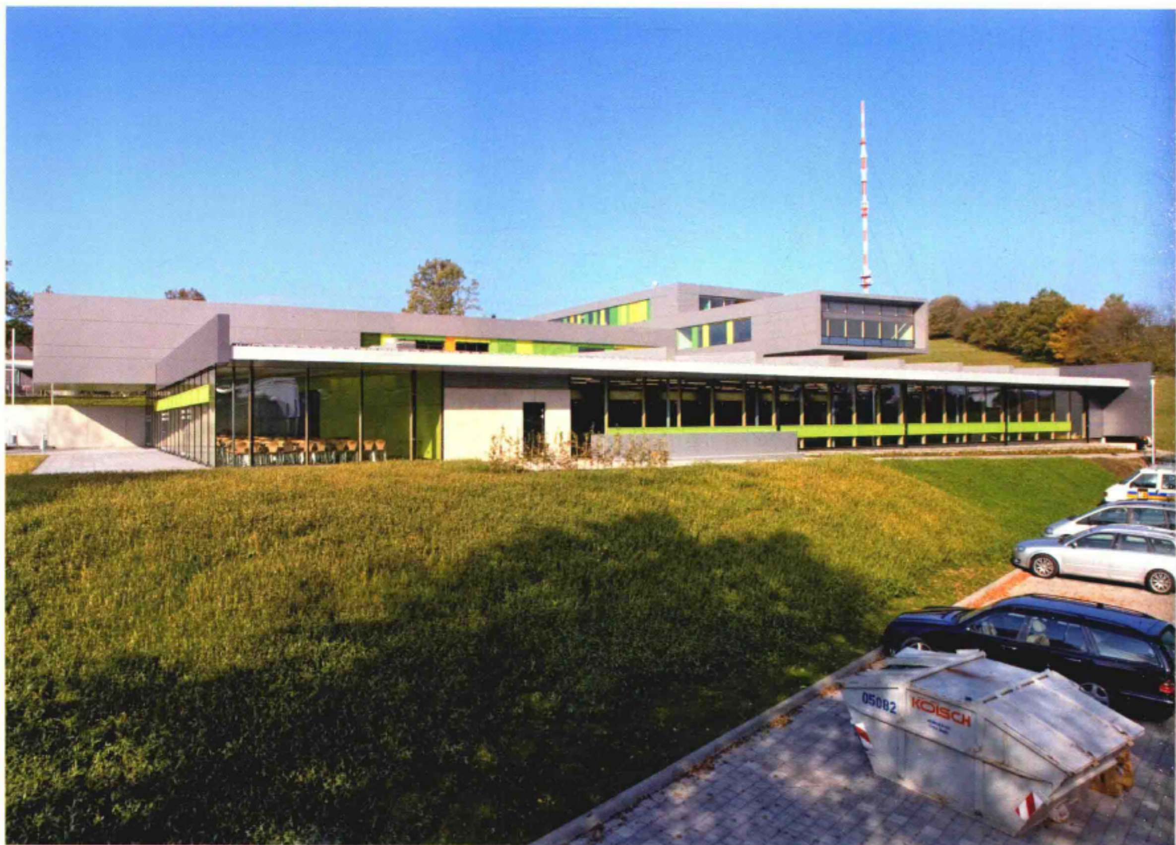
Exterior view of the canteen and sports hall 餐厅和体育馆外部