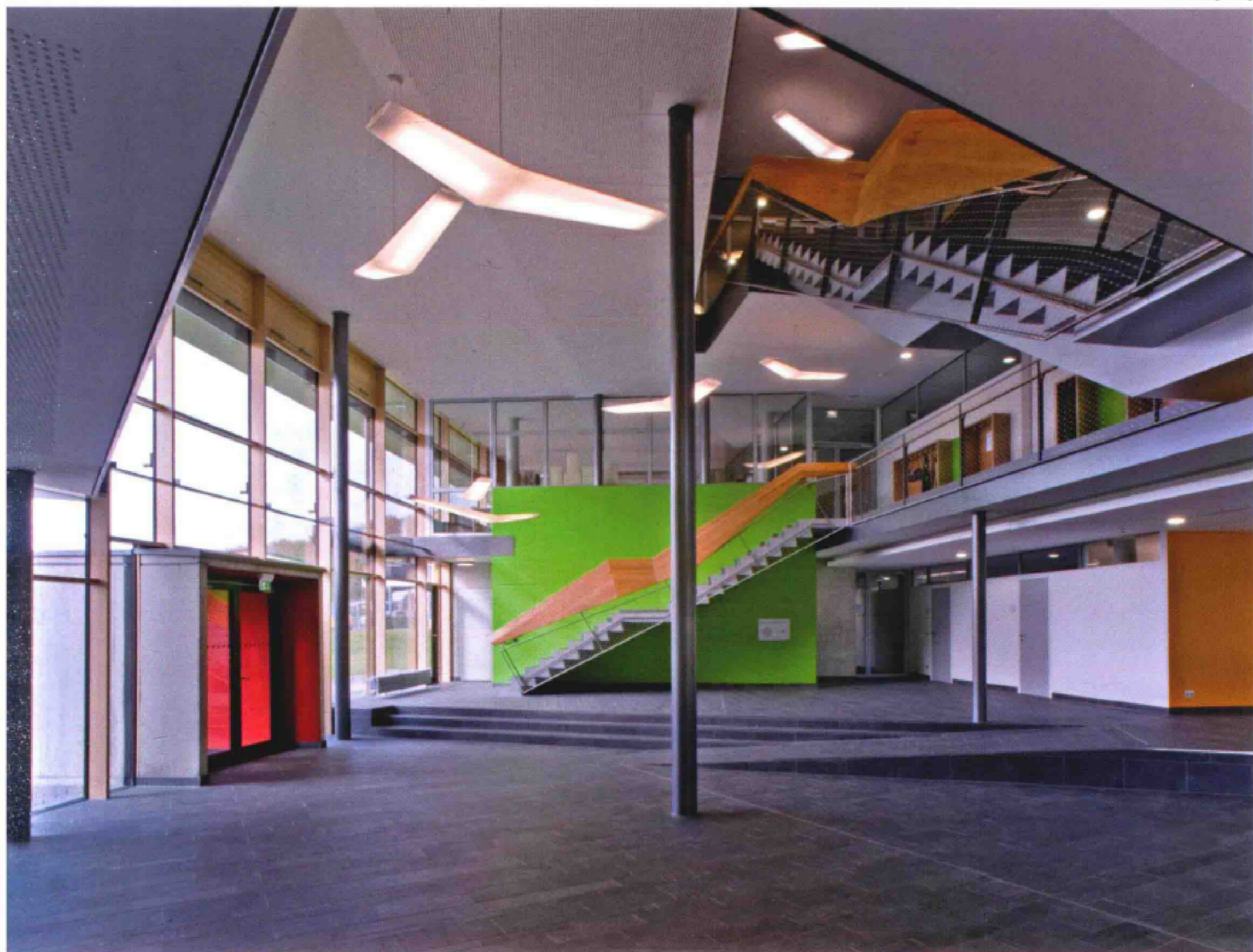
门厅也可以作为一个集会大厅 The great entrance hall can also be used as an assembly hall