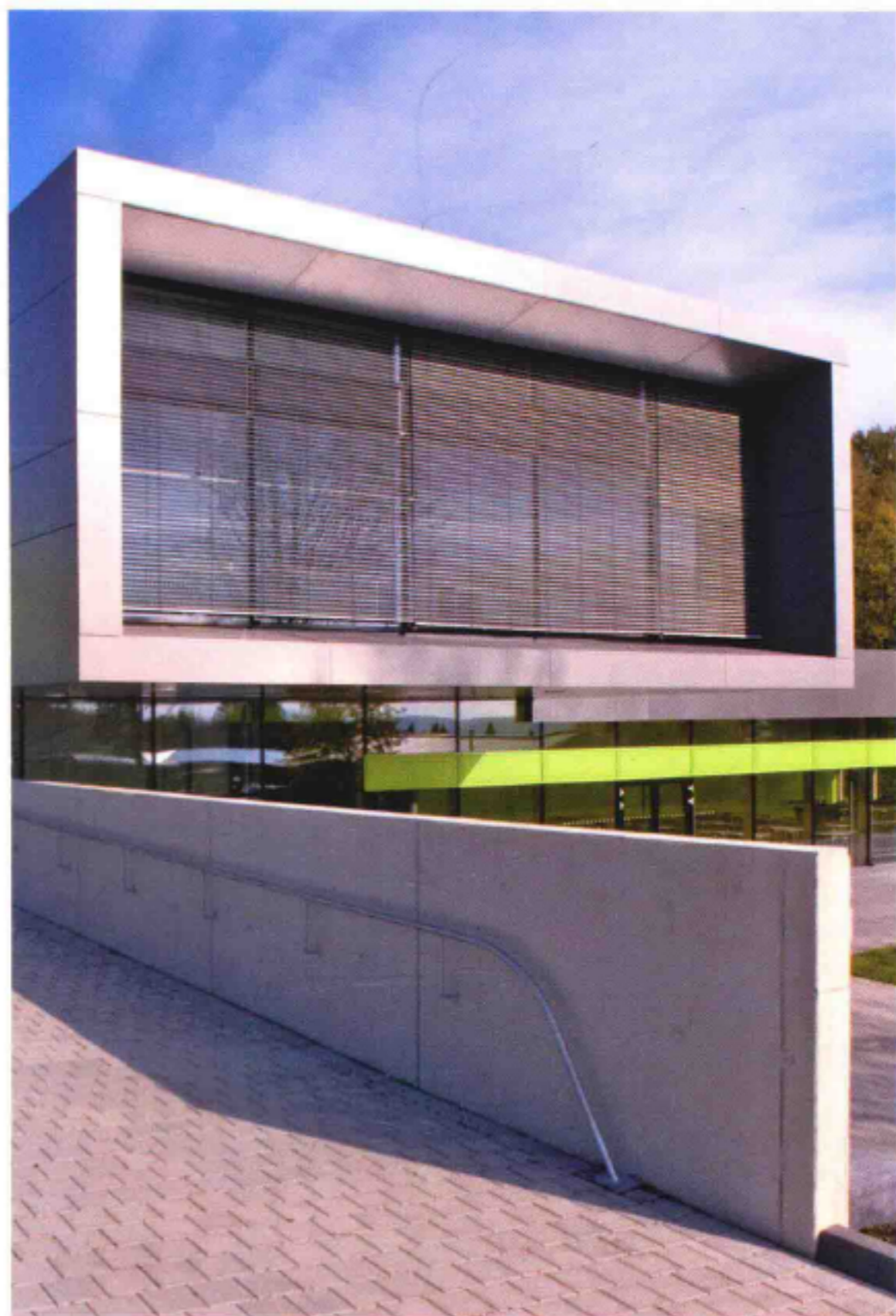
突出的翼楼 Striking wing