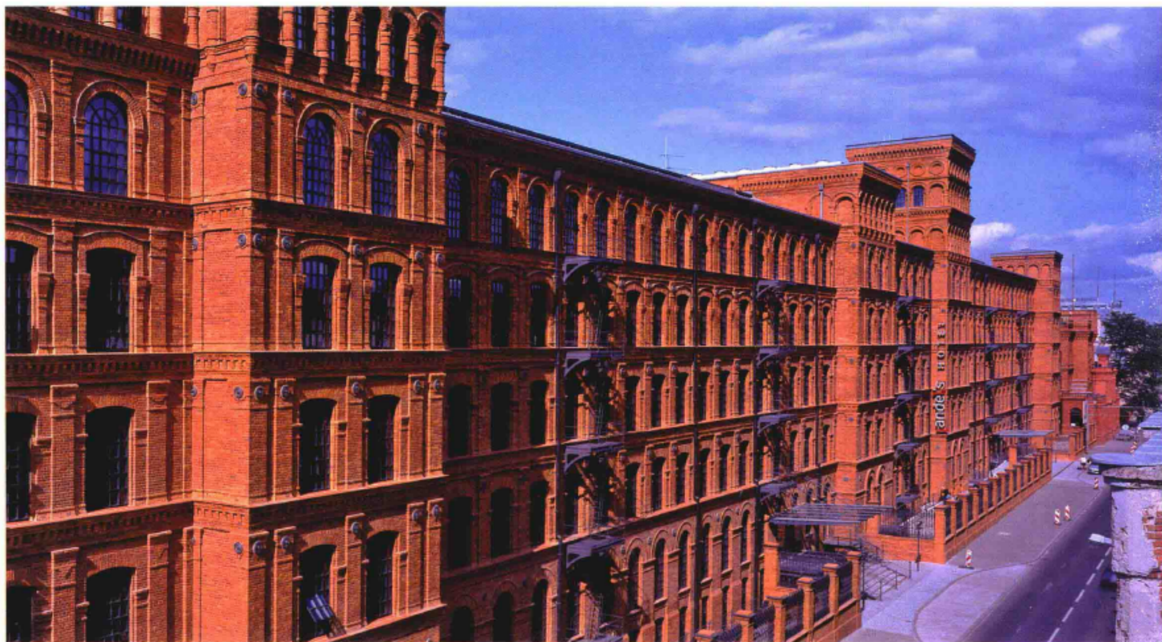
Front view 建筑正面