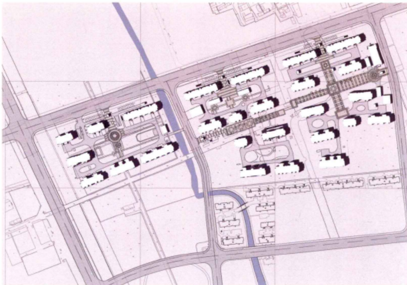
above site plan/总平面图 right residential perspective/住宅透视图

During product design, the designers further optimize the classic "90" room layout and add the practicability of kitchen and washing room, creating compact and comfortable spaces for users' daily life. On the aspect of appearance design, the designers combine the proportional relation of western building with detail elements of oriental building together to realize a simple, generous and novel residential building style, showing oriental beauty.