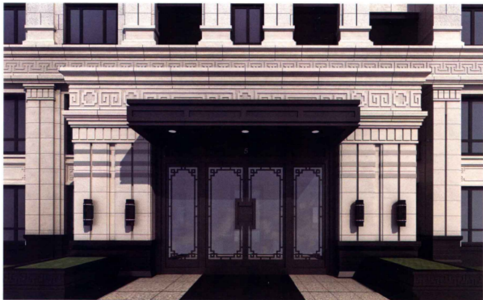
left residential perspective/住宅透视图 right architectural detail/建筑细部