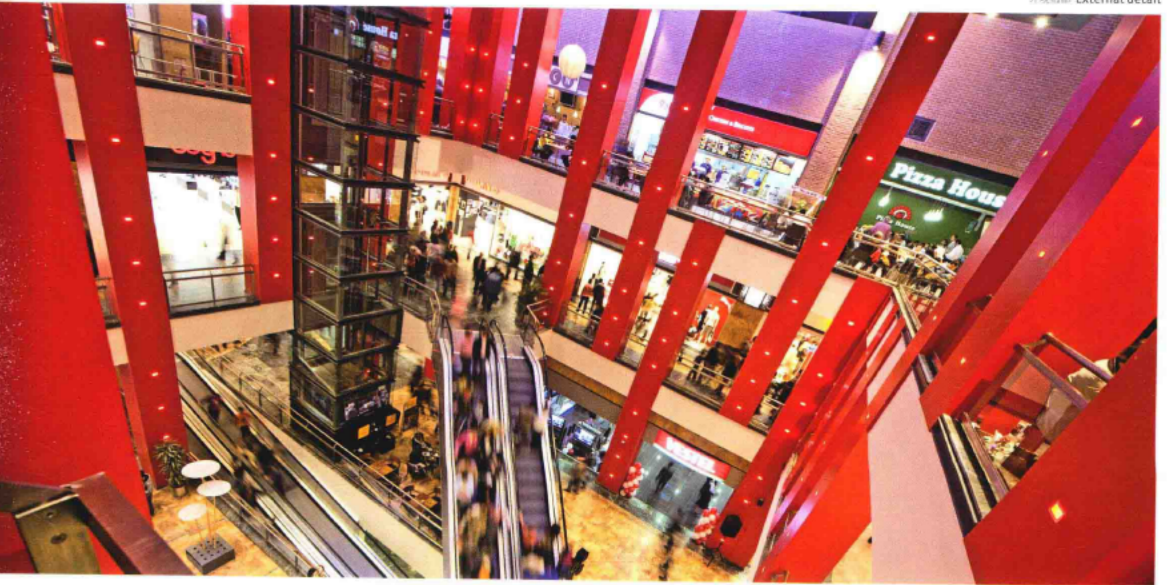
室内 Interior view