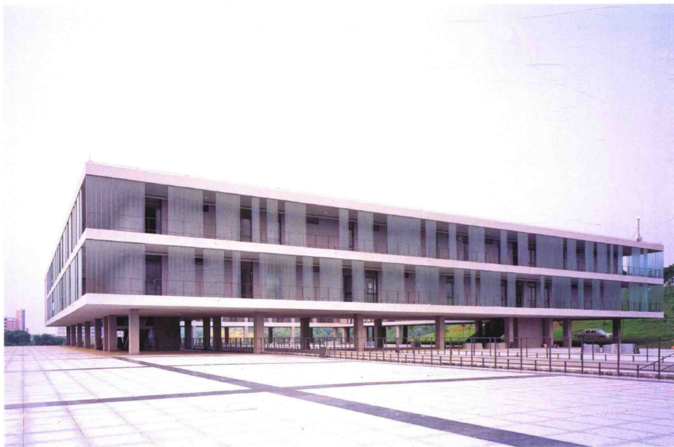
General view 全景图

文科系馆首层的建筑被半插入山体，建筑的部分体量由此成为地形的一部分，因为地势的原因，首层建筑仍有两面是开敞的，并面对很好的池塘景观，其他部分则通过一个L形的内院采光。首层屋顶在起伏的地形中形成了一块开放的平台广场，上部建筑则呈正方形围合并架空在平台层上，这样内院、围廊、平台共同形成了一处具有中心感的公共开放空间。在人流的主要行进方向，建筑的体量被明显化解，有效地减轻了建筑对于环境的压力，当视线穿越架空层而停留在后面或远处隆起的山坡上时，人们大致可以想象或回忆起此处地形原本的模样。