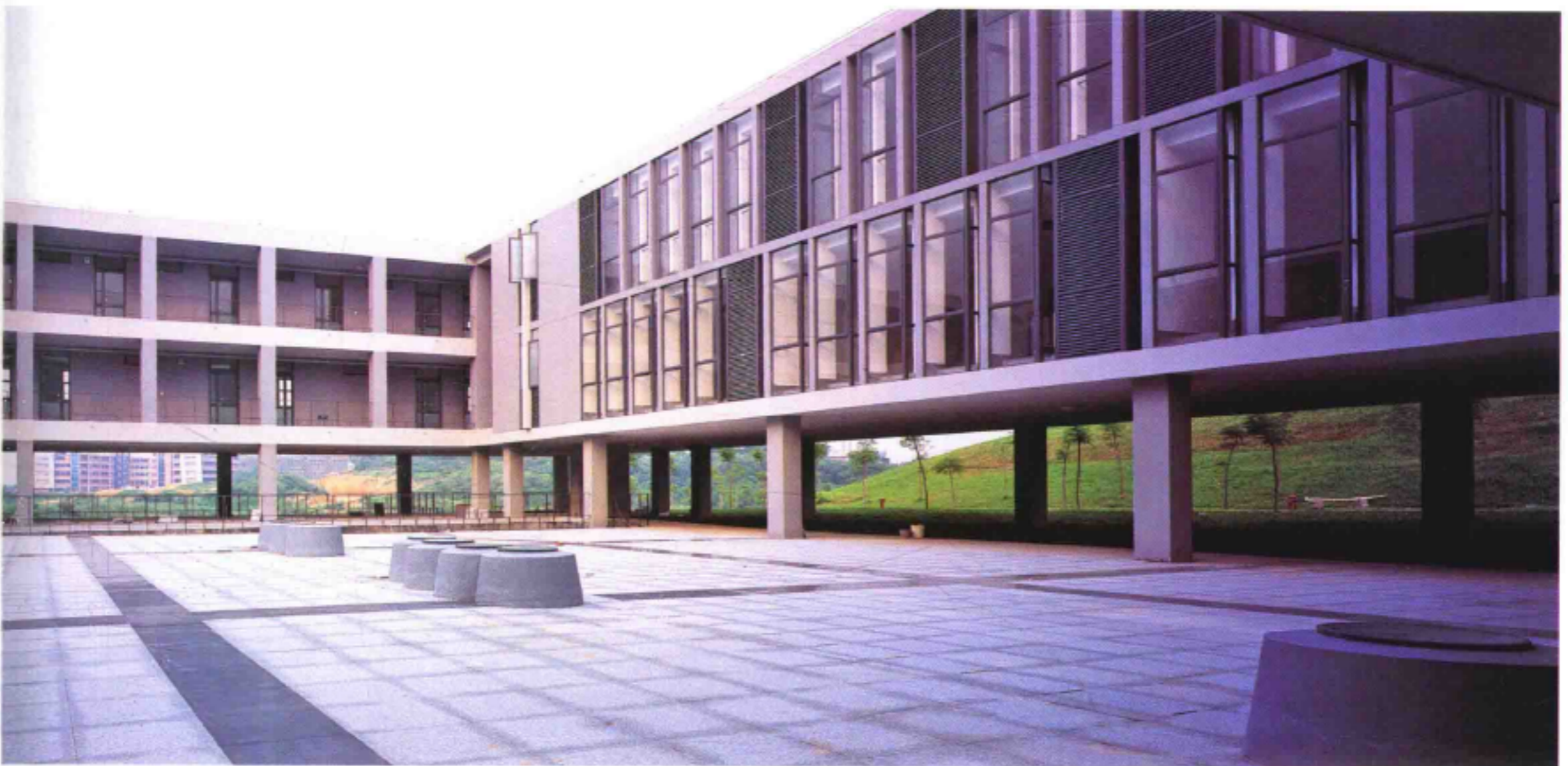
內庭和二樓 Inner court of the first floor