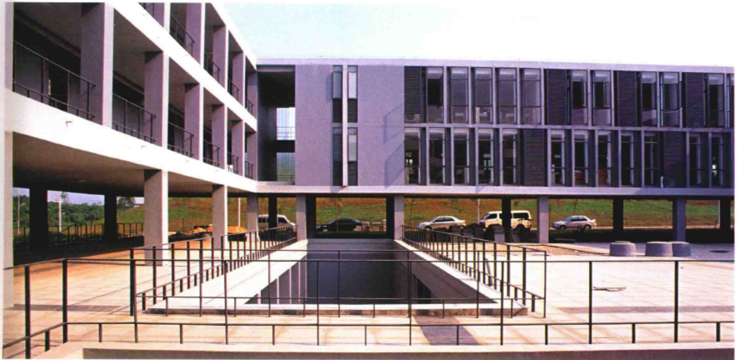
二樓內庭 Inner court of the first floor