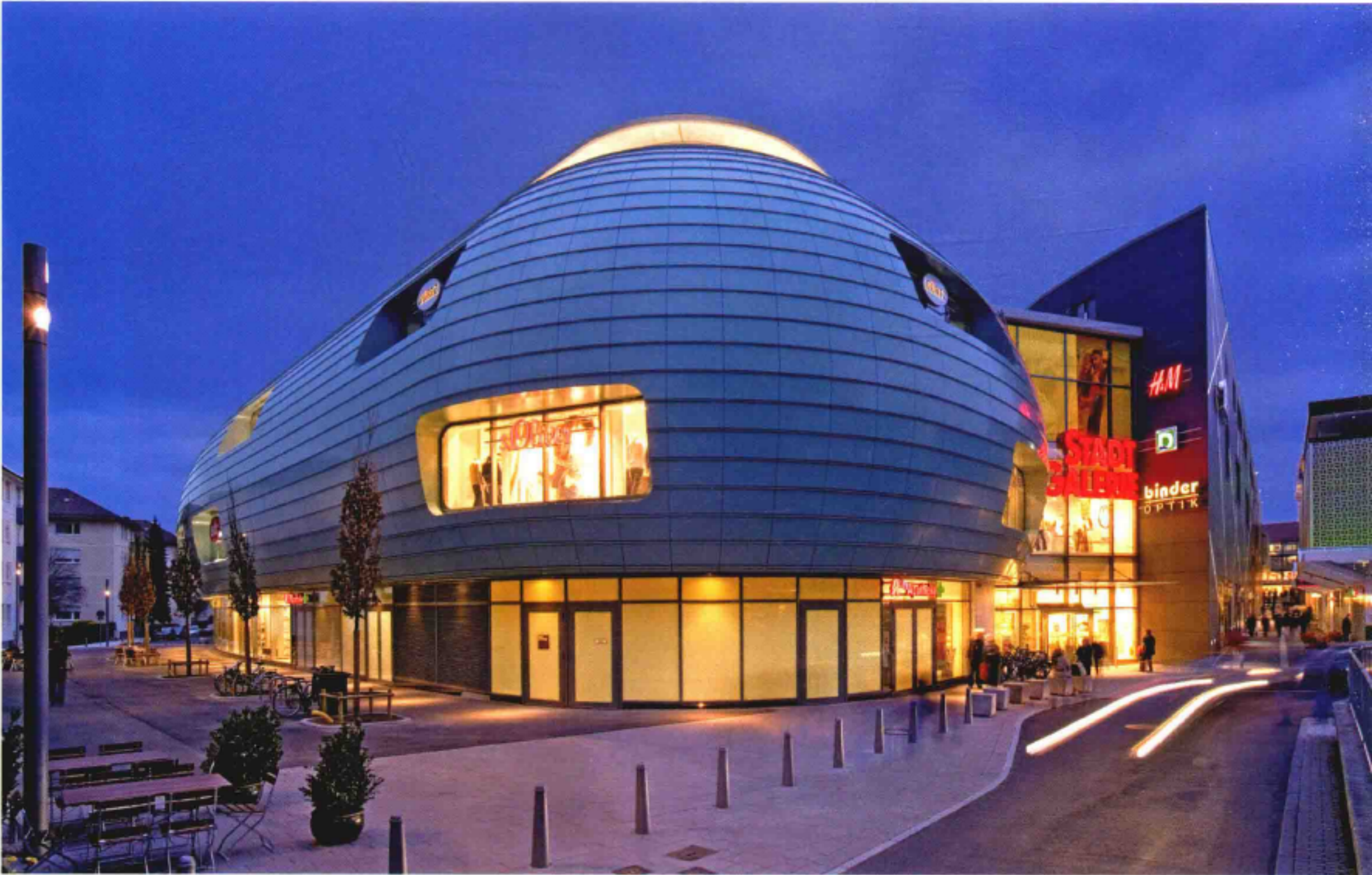
The building at night 建筑夜景

轮廓鲜明的立方体建筑和弯曲柔和的圆形建筑完美地结合在一起，与原有的城市空间形成一个整体。建筑外墙的理念强调了建筑的独立性。背光的缝隙以一种古怪的方式横跨墙壁，从视觉上打开了建筑。小巷在黑暗中一下子就被点亮了。建筑的造型柔化了自身，与周围的建筑流畅地结合了起来。拱形外壳的最上端是有金银丝装饰屋顶的阁楼。纵向的彩色玻璃片强调了建筑的轮廓。白天和黑夜，建筑会呈现不同的面貌。