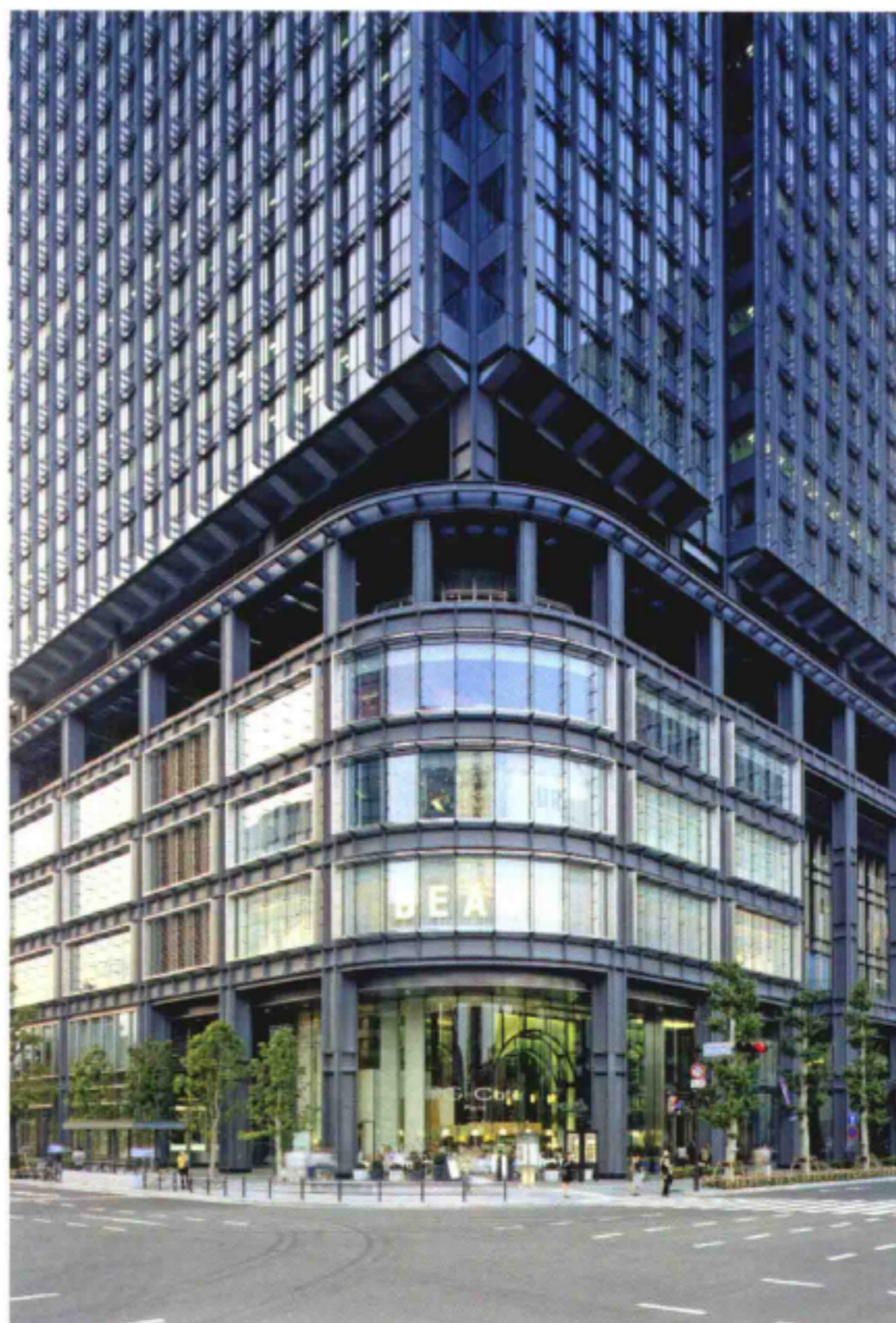
外部一角 Façade corner