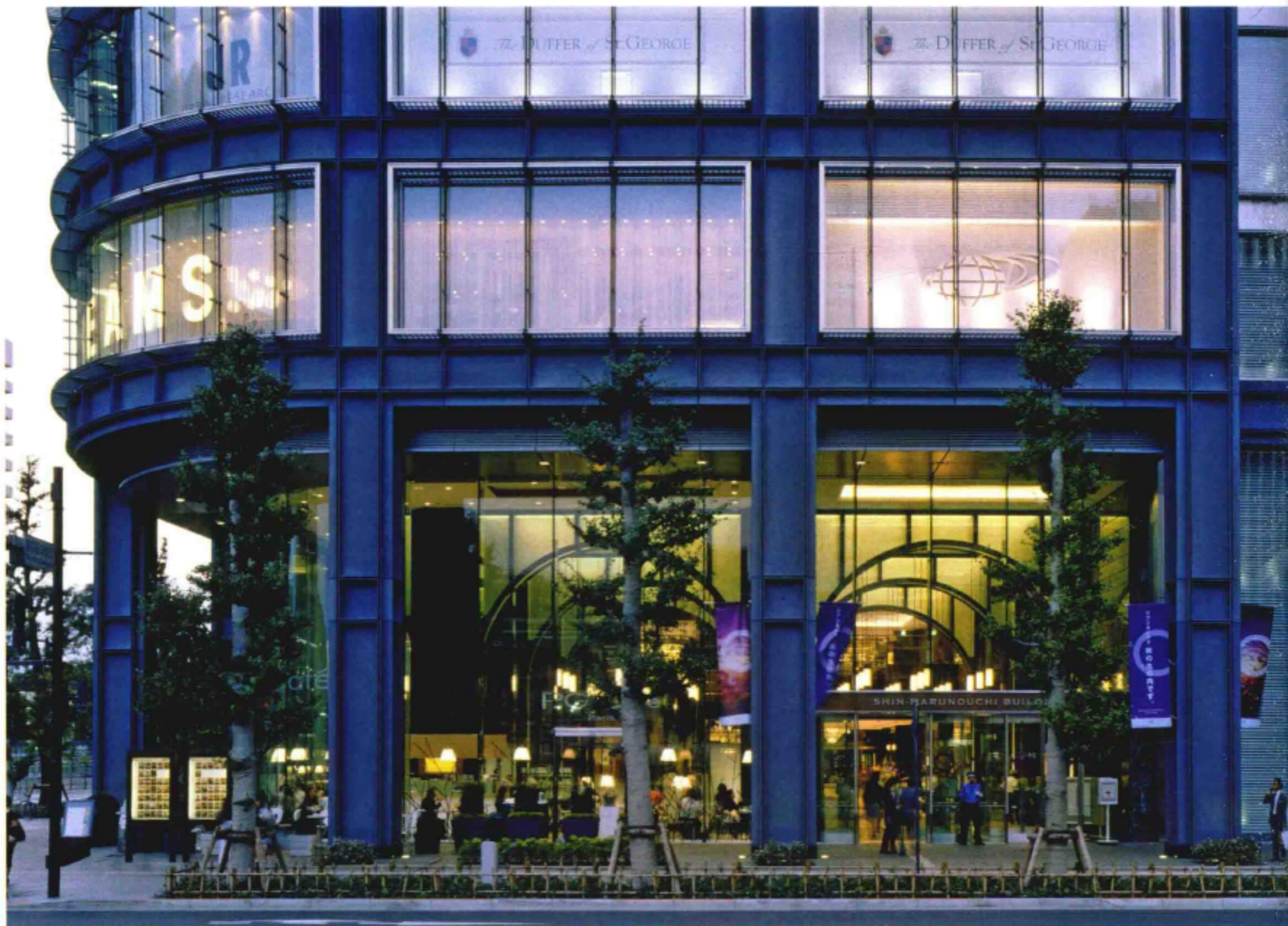
View from the street 街景