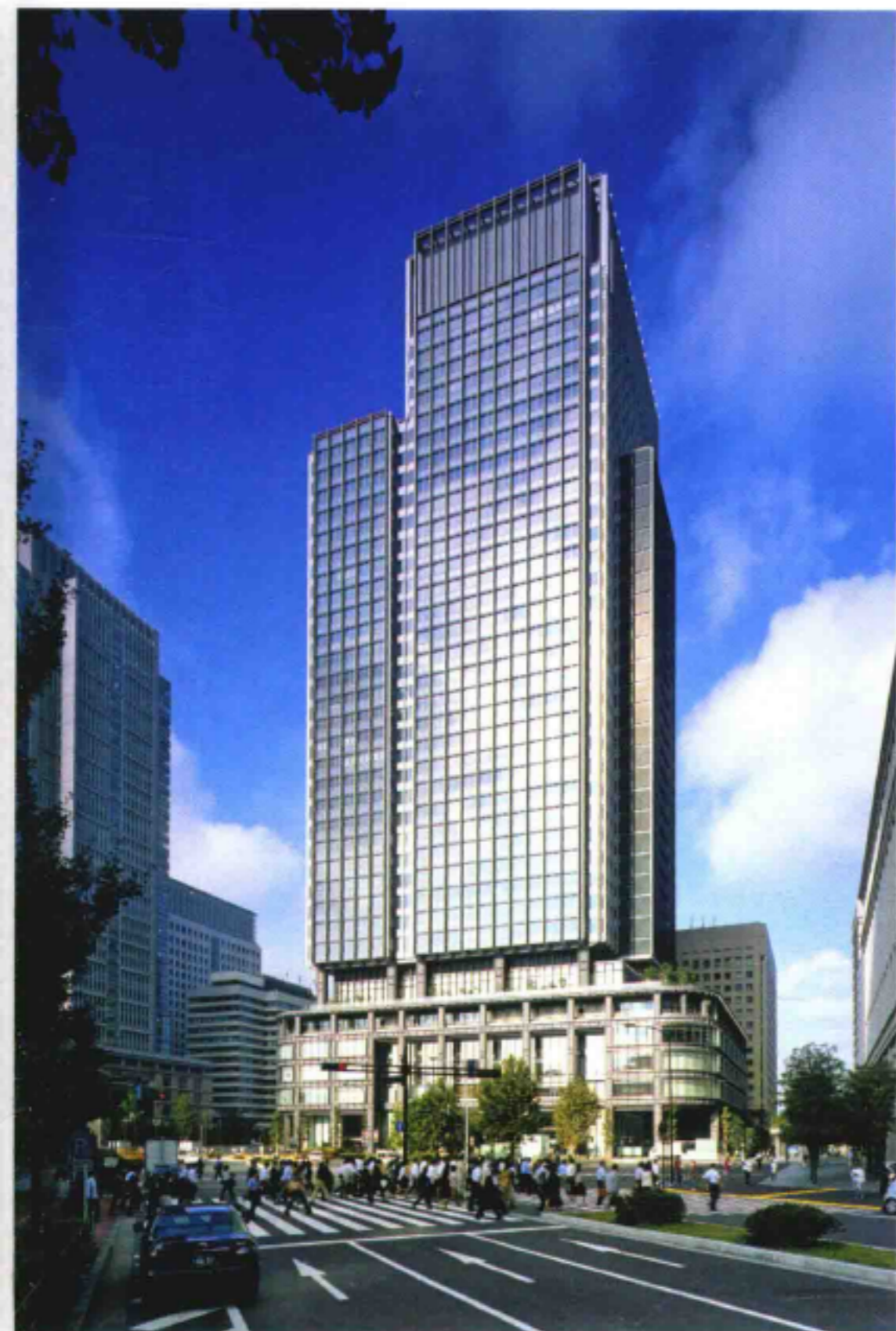
全景图 General view