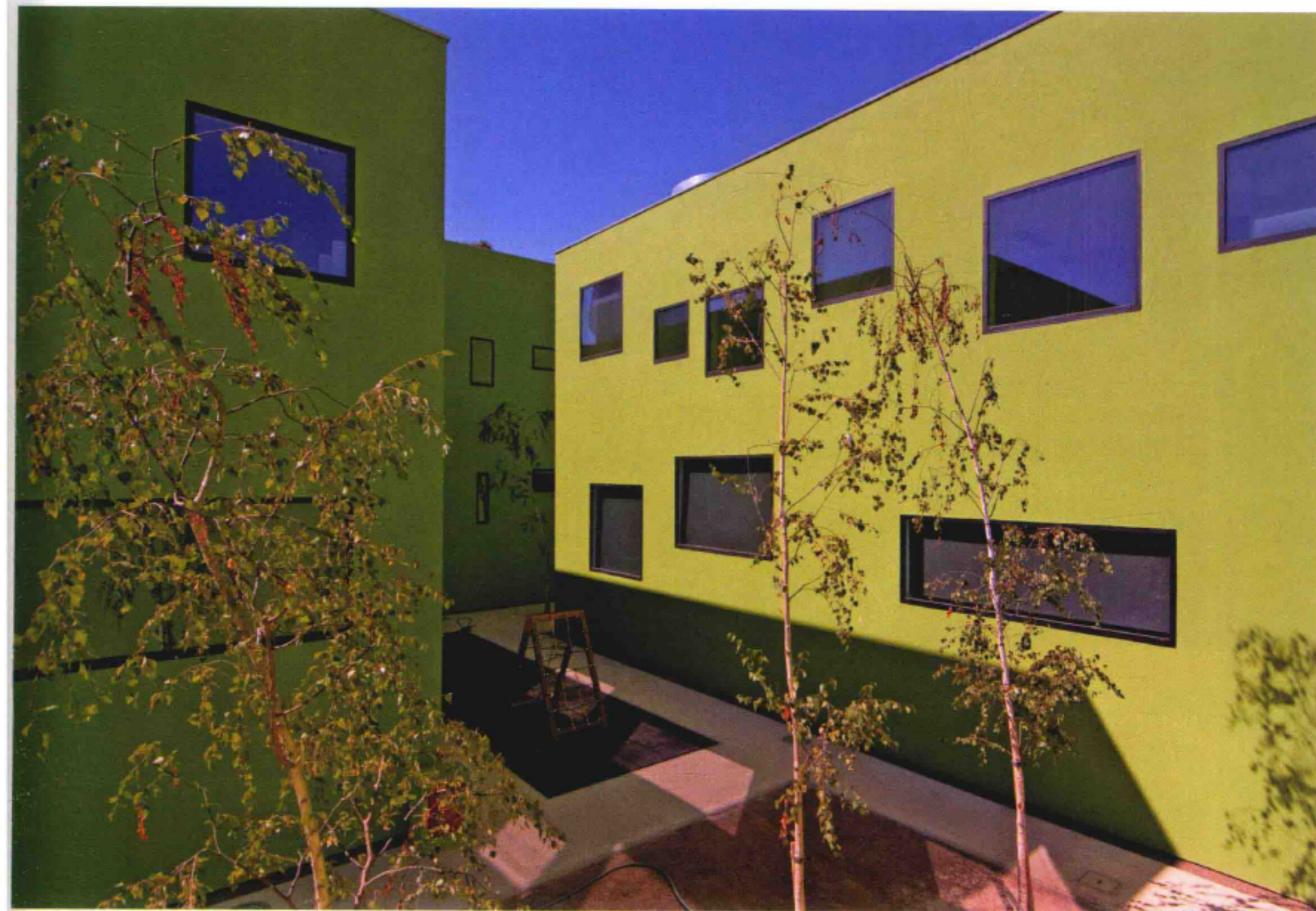
儿童户外游乐场 Children's outdoor play area