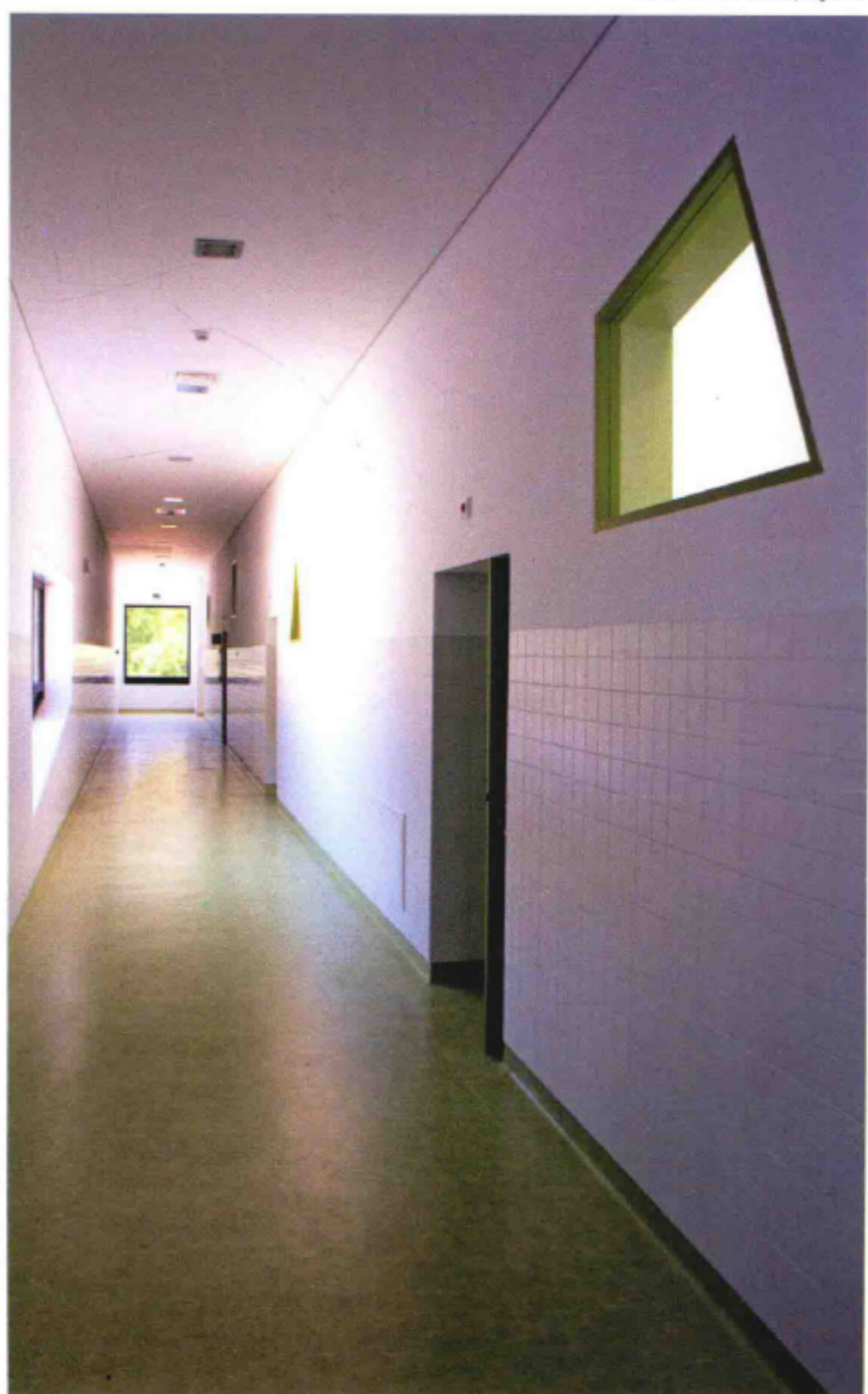
通往教室的通道 Circulation space to classrooms