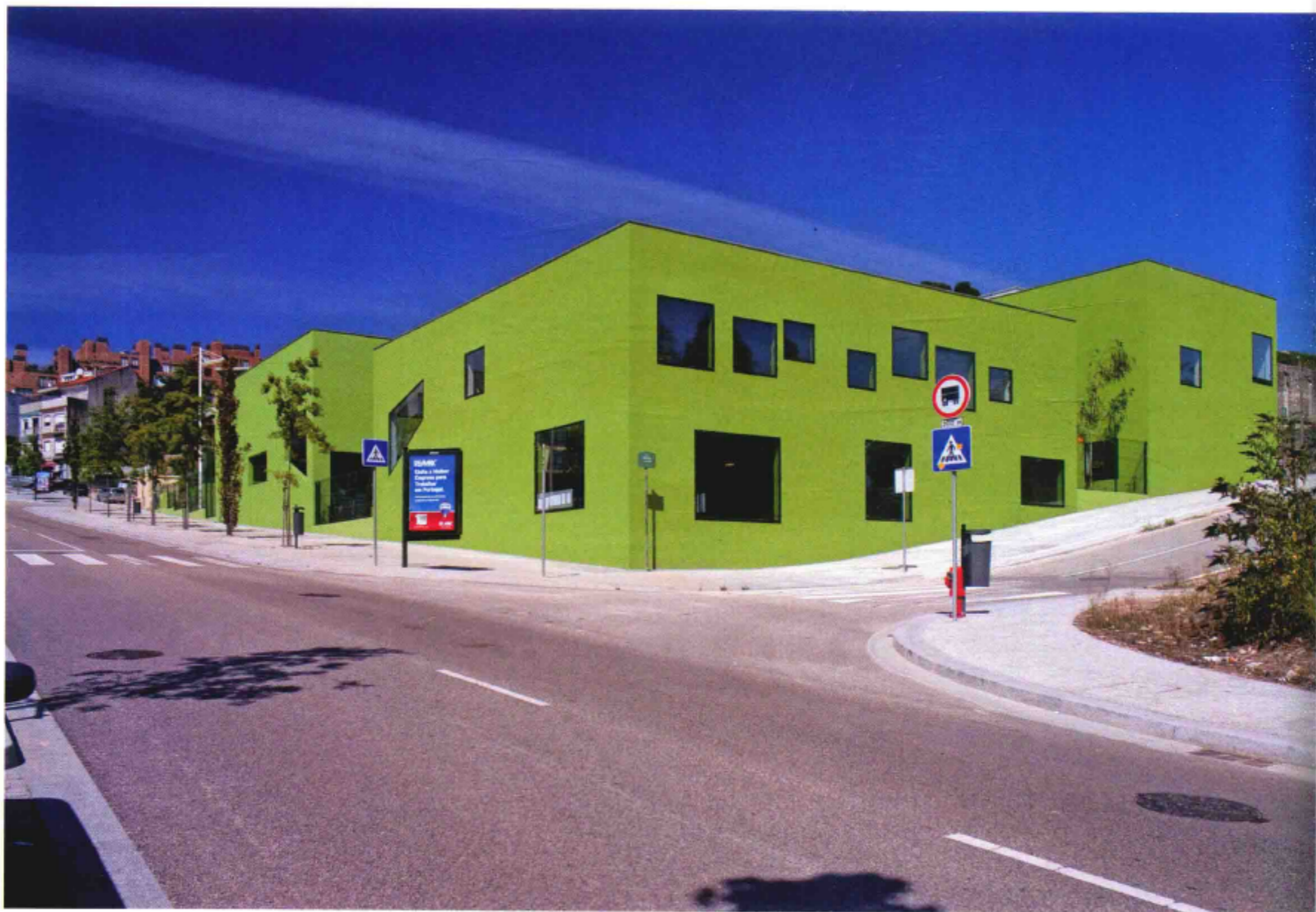
Southeast view 学校东南侧

建筑本身的室内外视觉关系也是设计的重点。整个项目将学校的各个功能区组织结构化，在不同的地势高度上建立了不同的功能区。