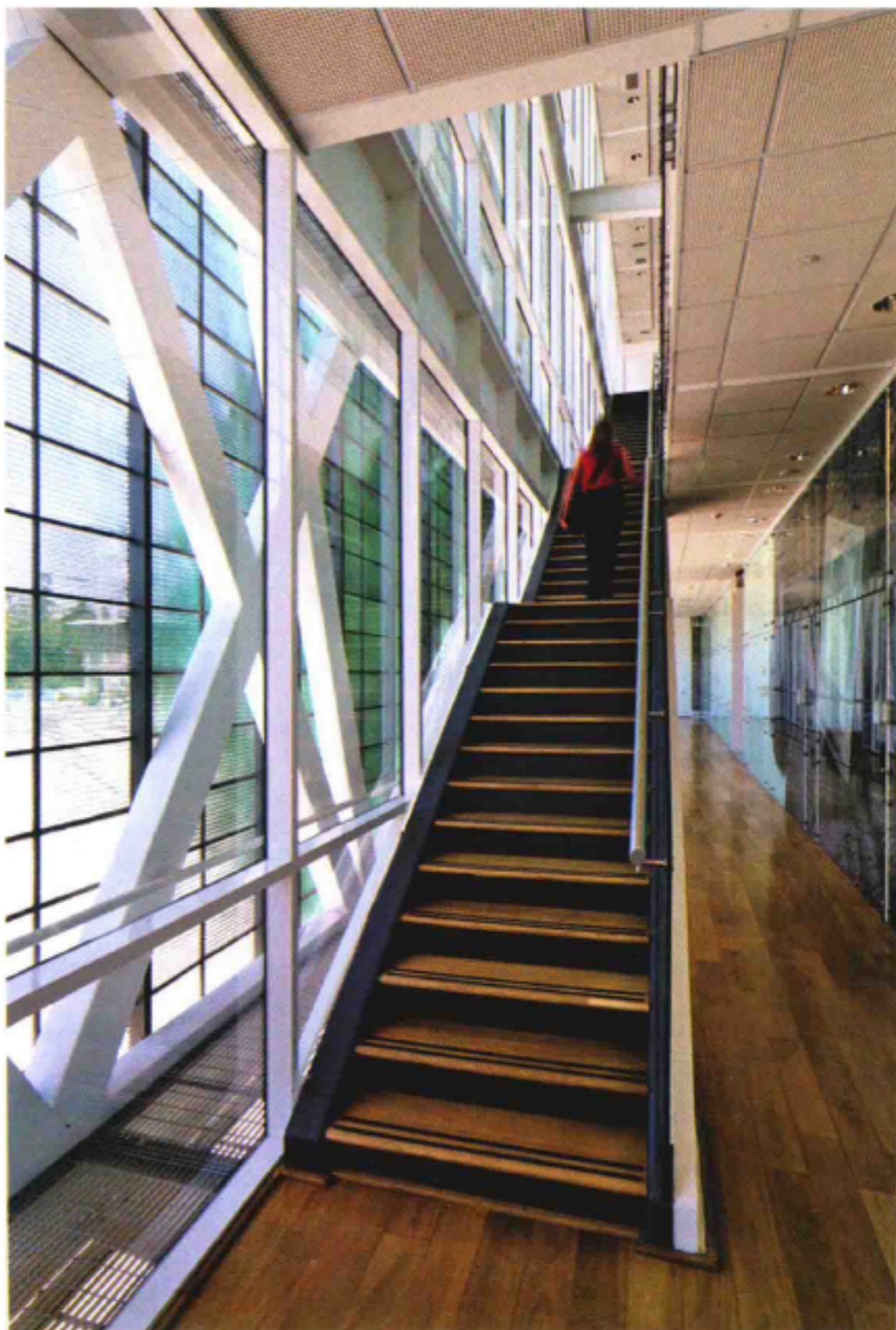
室内楼梯 Interior stairs