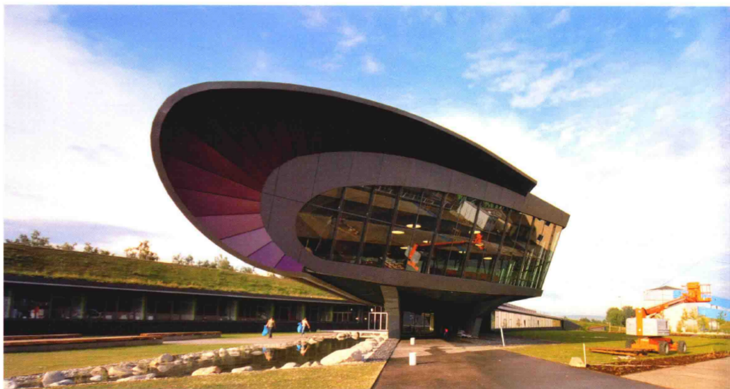
Main entrance 主入口

一个带有游客中心的礼堂从这个景观区域展开，并朝向发电站。它的上层与挡土墙相分离，依托于两面径向承重墙之上，悬在20米的高空之中，一面全景玻璃外墙直接朝向发电站。下方的行政楼则与挡土墙合为一体。会议室和公共区域穿透了围墙，与边界的村庄建立了联系。