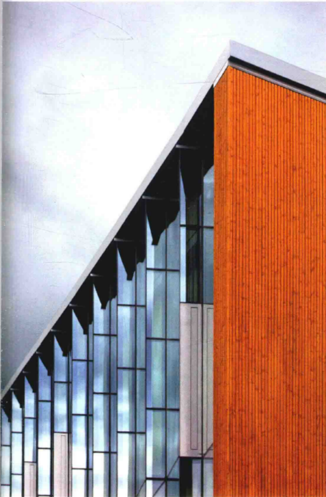
建筑外观 Exterior view