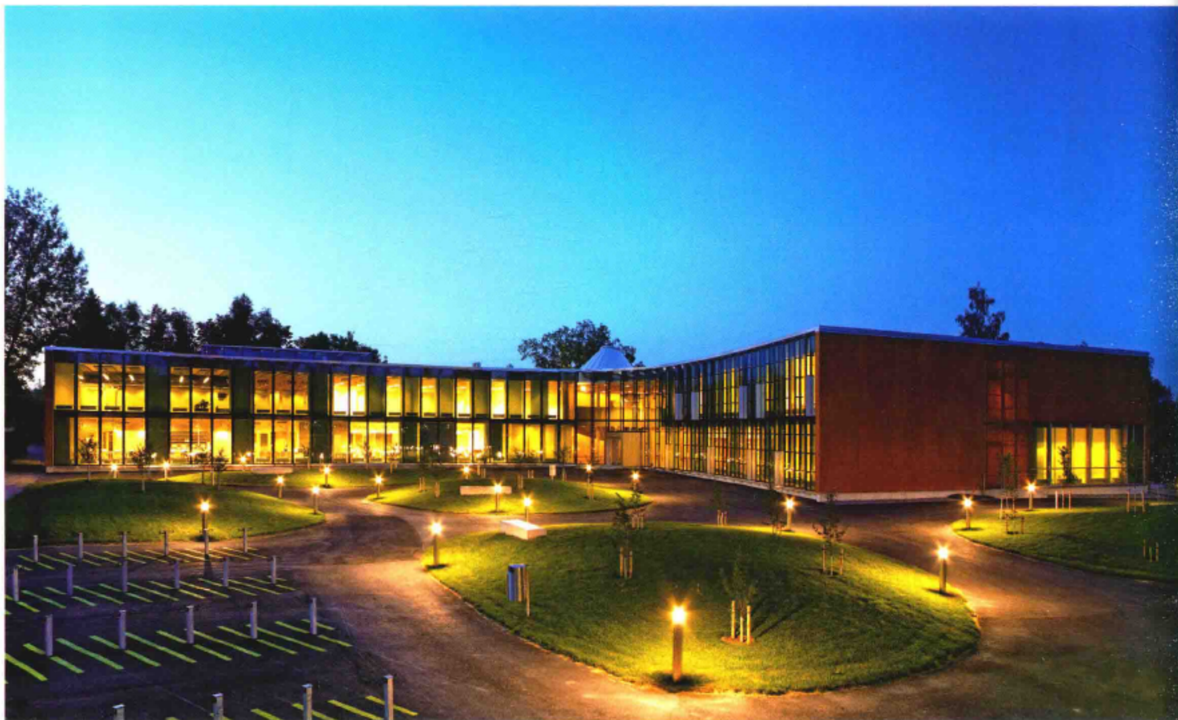
Exterior view 建筑外观