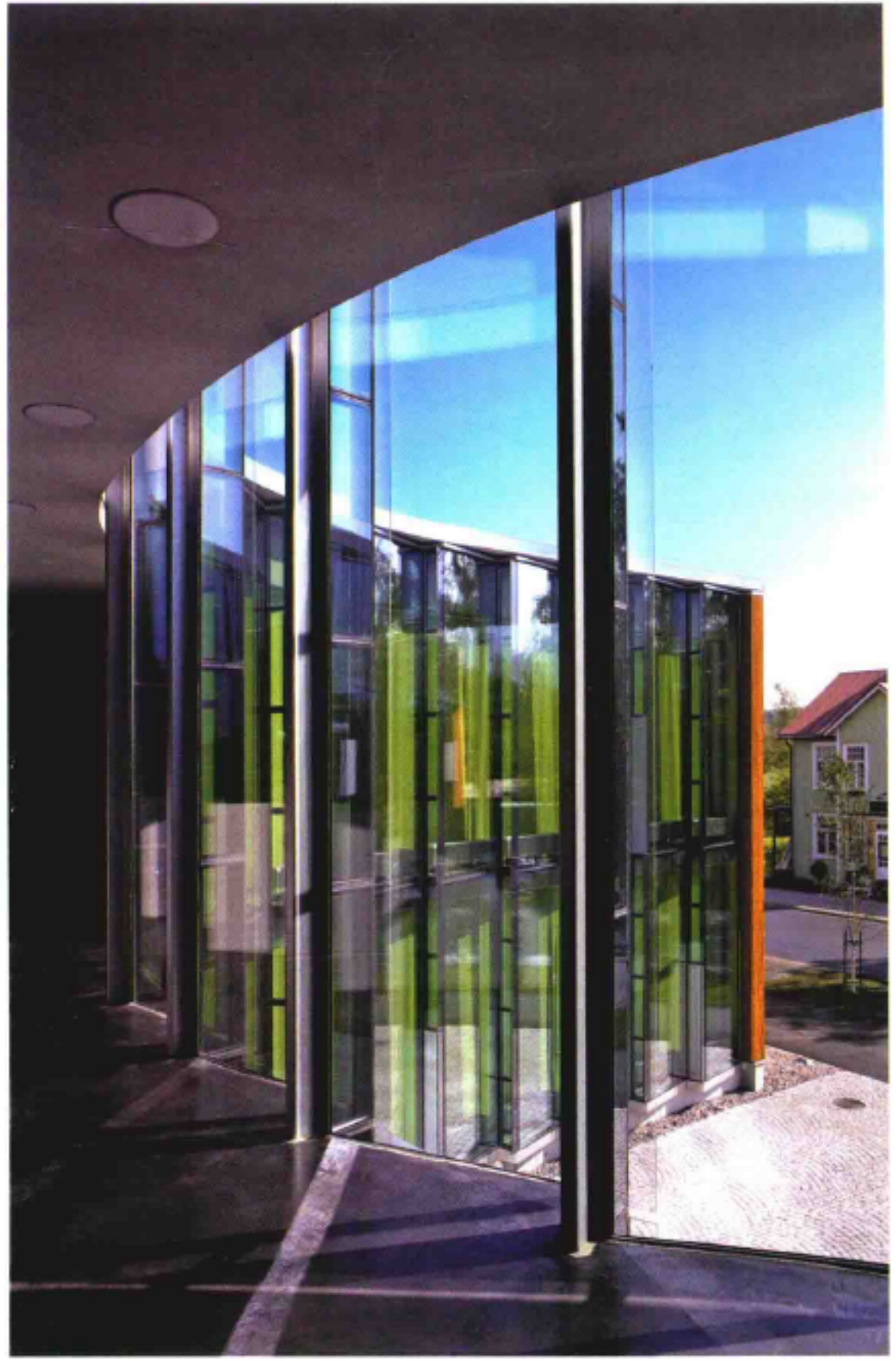
窗边景色 View from window