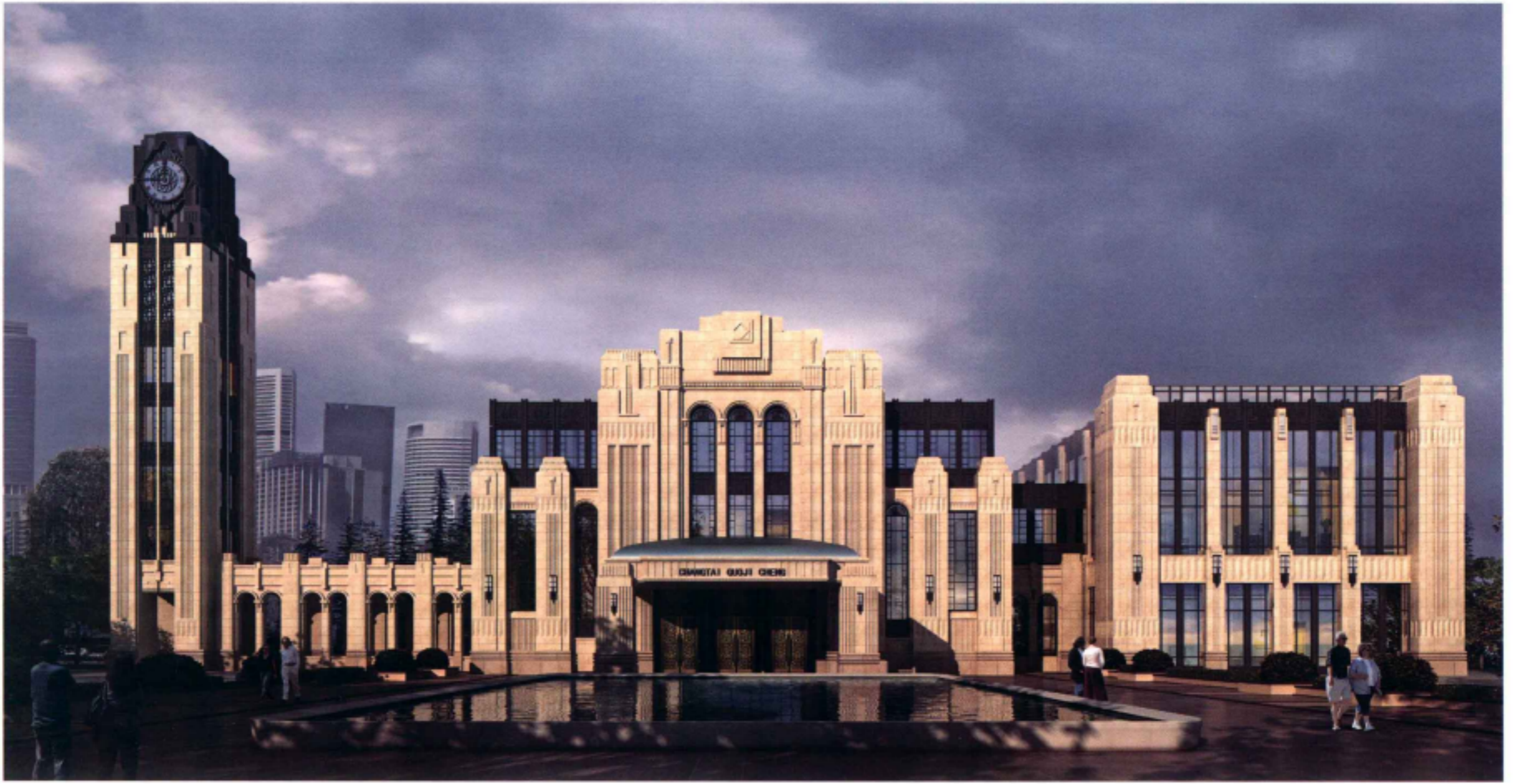
left architectural photo/建筑实景 above exterior view/外景图 bottom right elevations/立面图