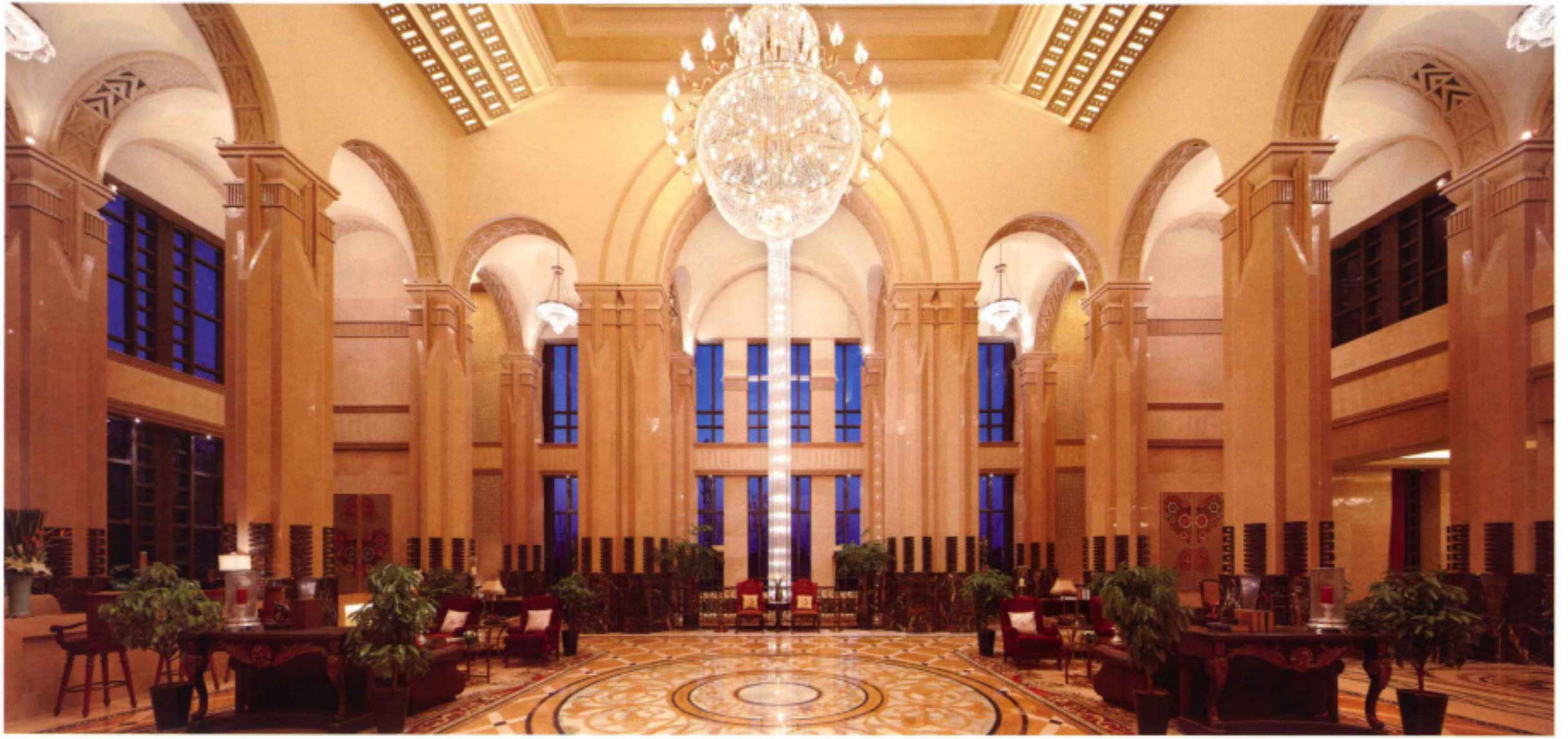
left exterior photo/外部实景照 right interior photo/内部实景照