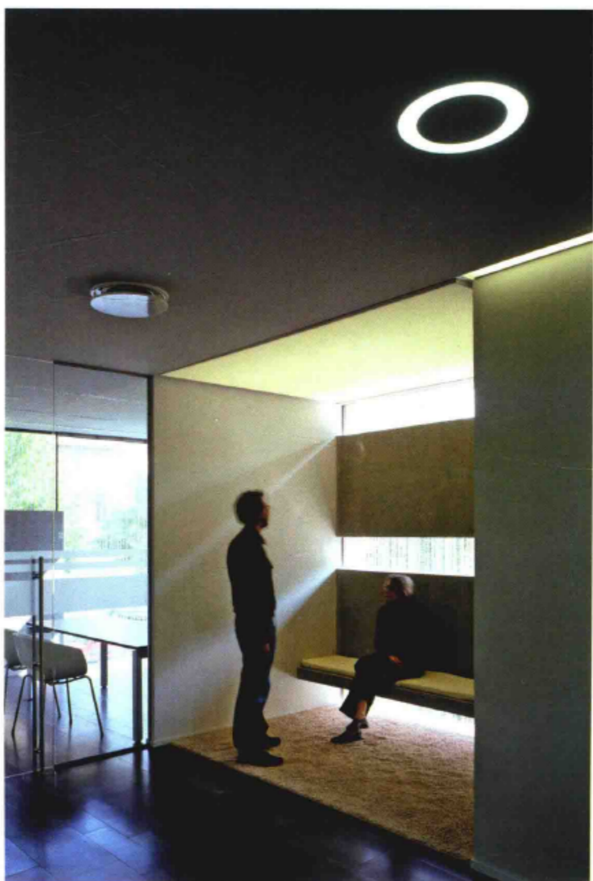
景观平台 Landscape deck