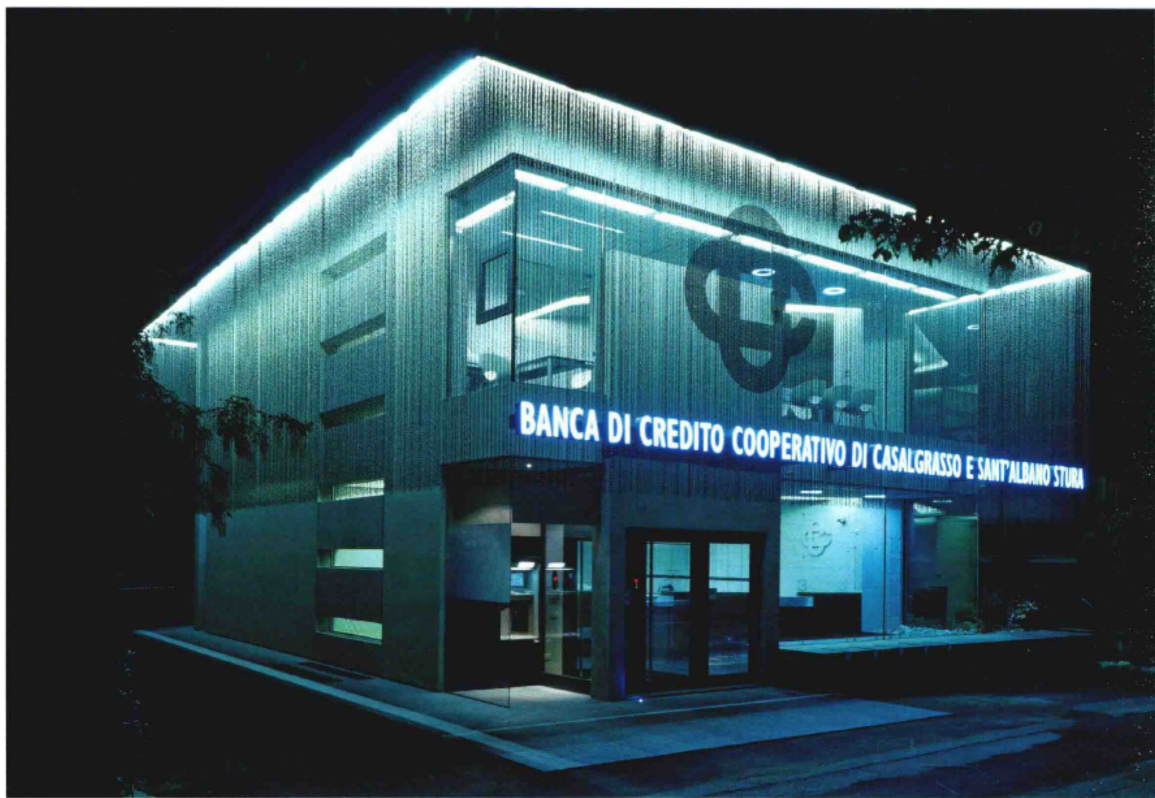
General view 建筑全景