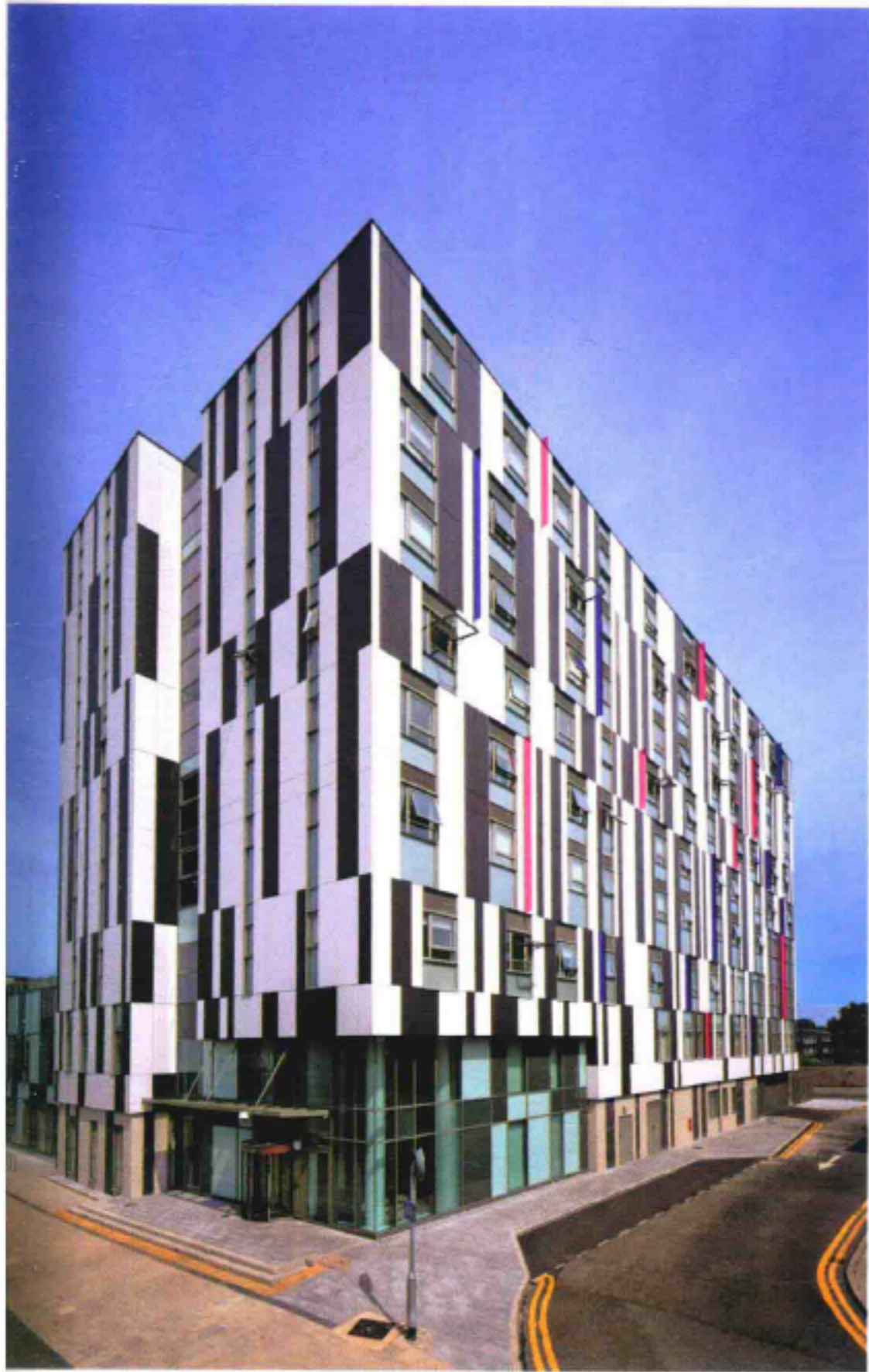
从街道看建筑 View from street