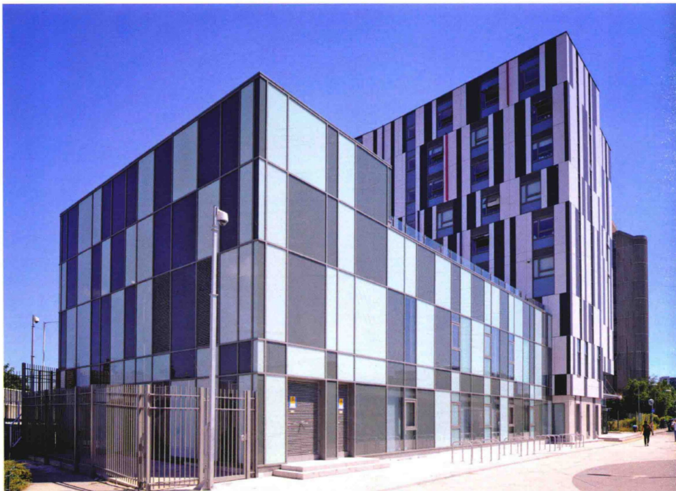
General view 建筑全景