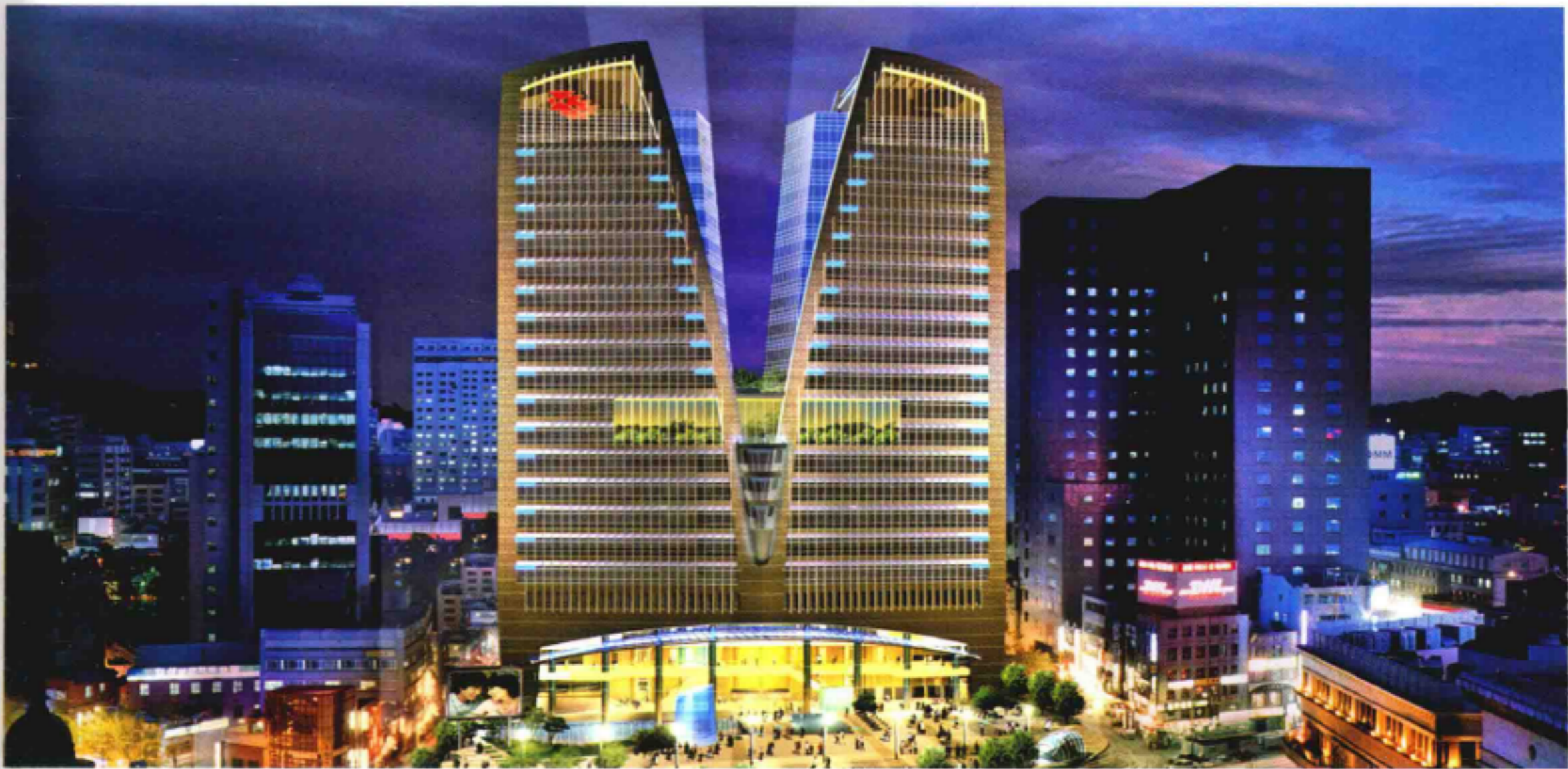
夜景 Night view