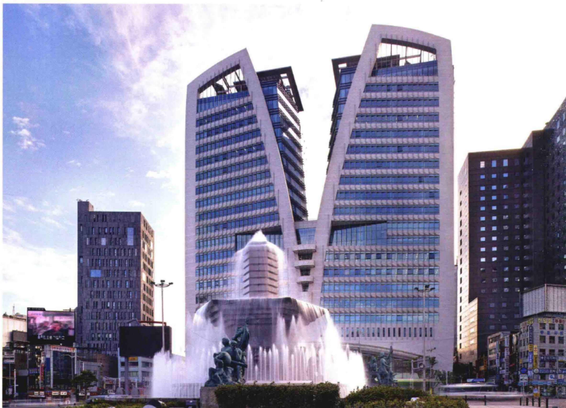
General view 全景图