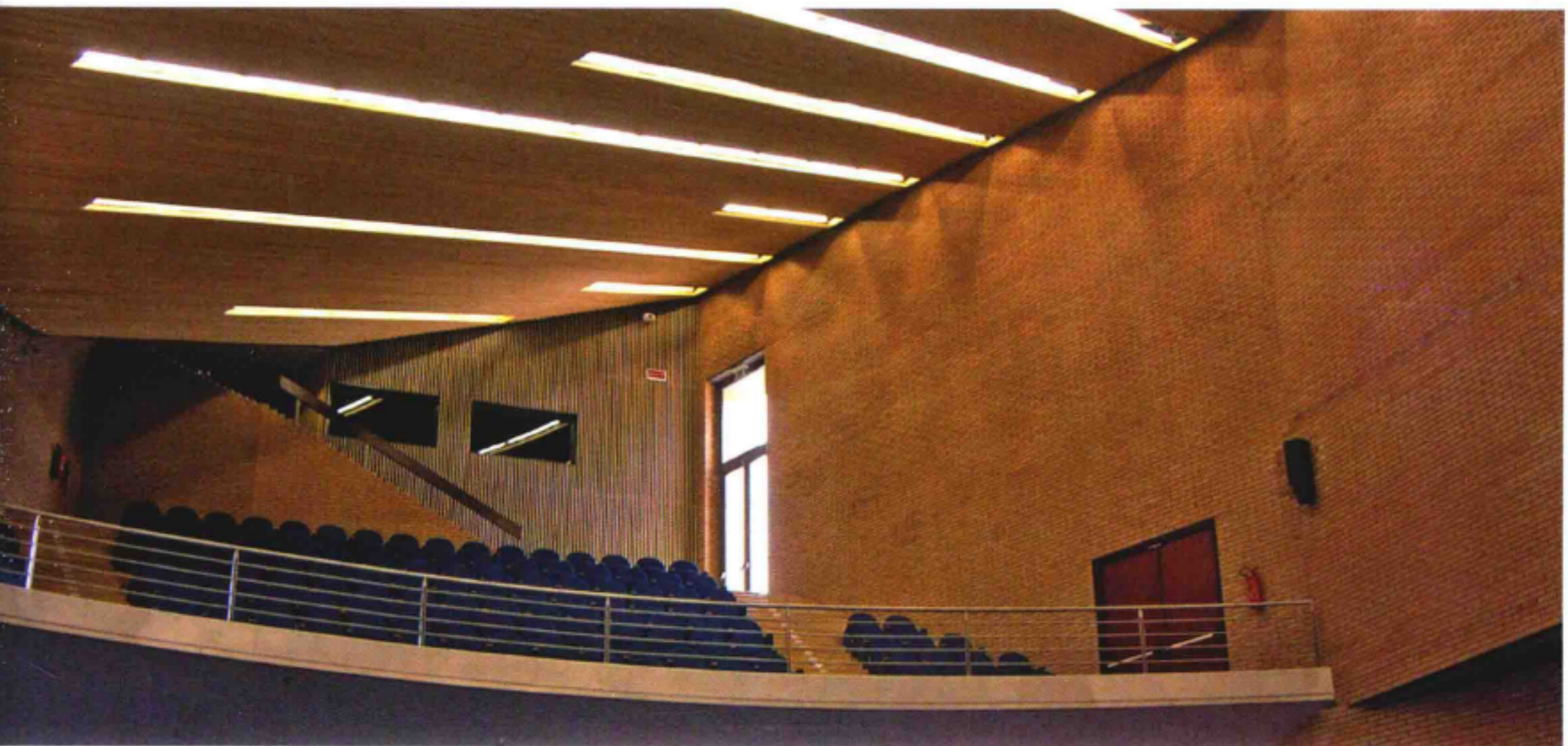
室内空间 The inner space