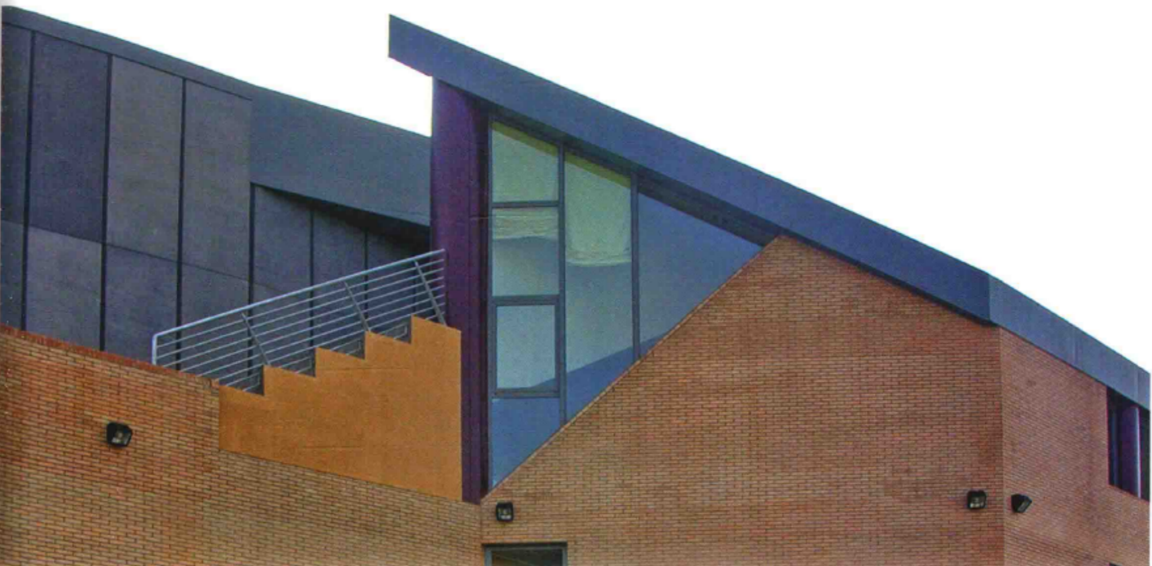
建筑主外墙 The main façade