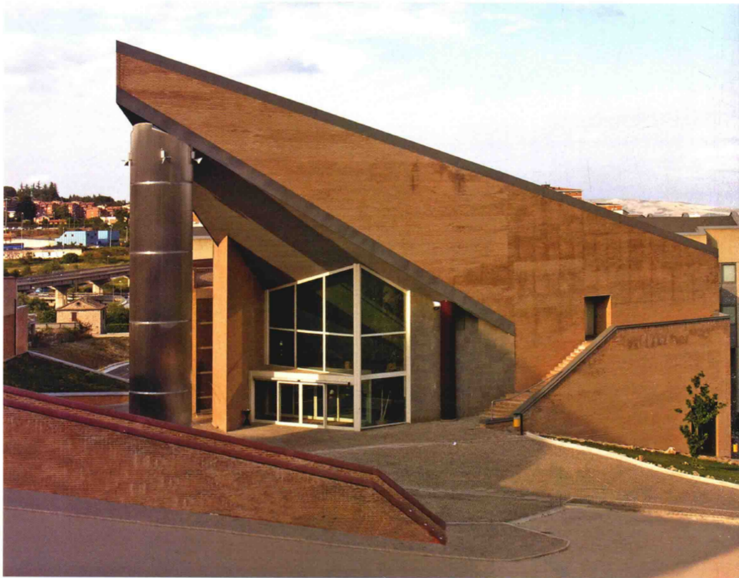
Side façade 建筑侧面