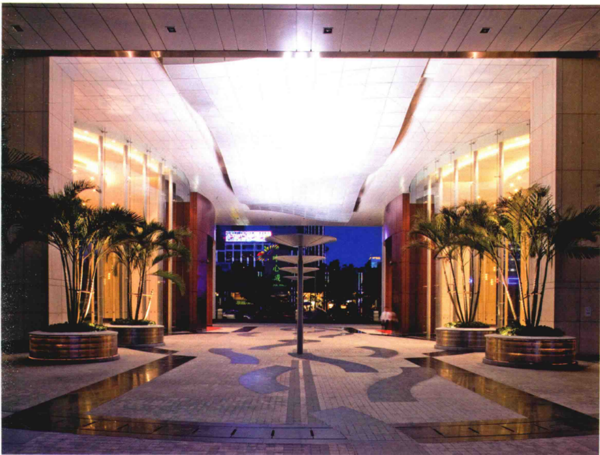
入口通道 Entrance way