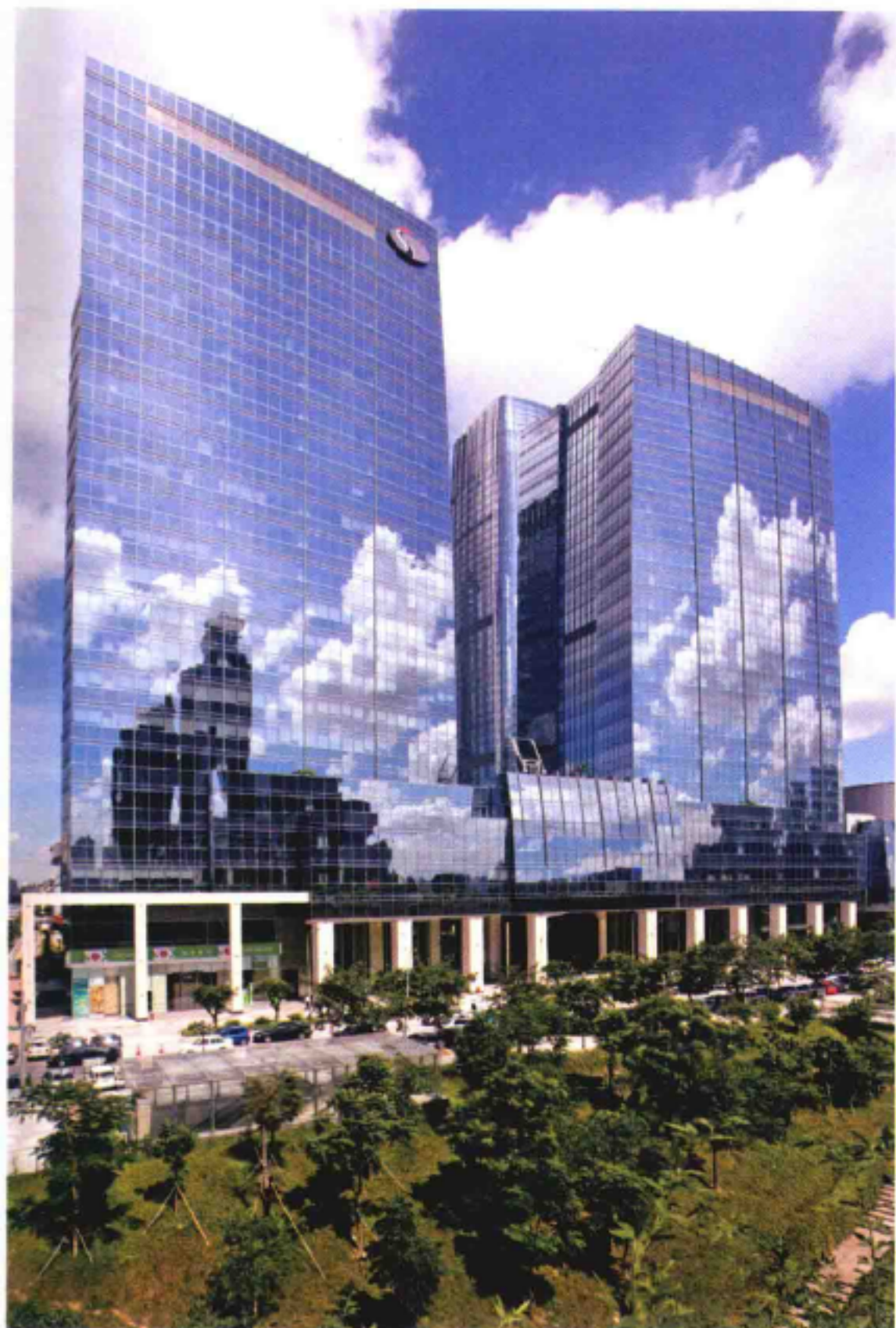
建筑外观 Exterior view