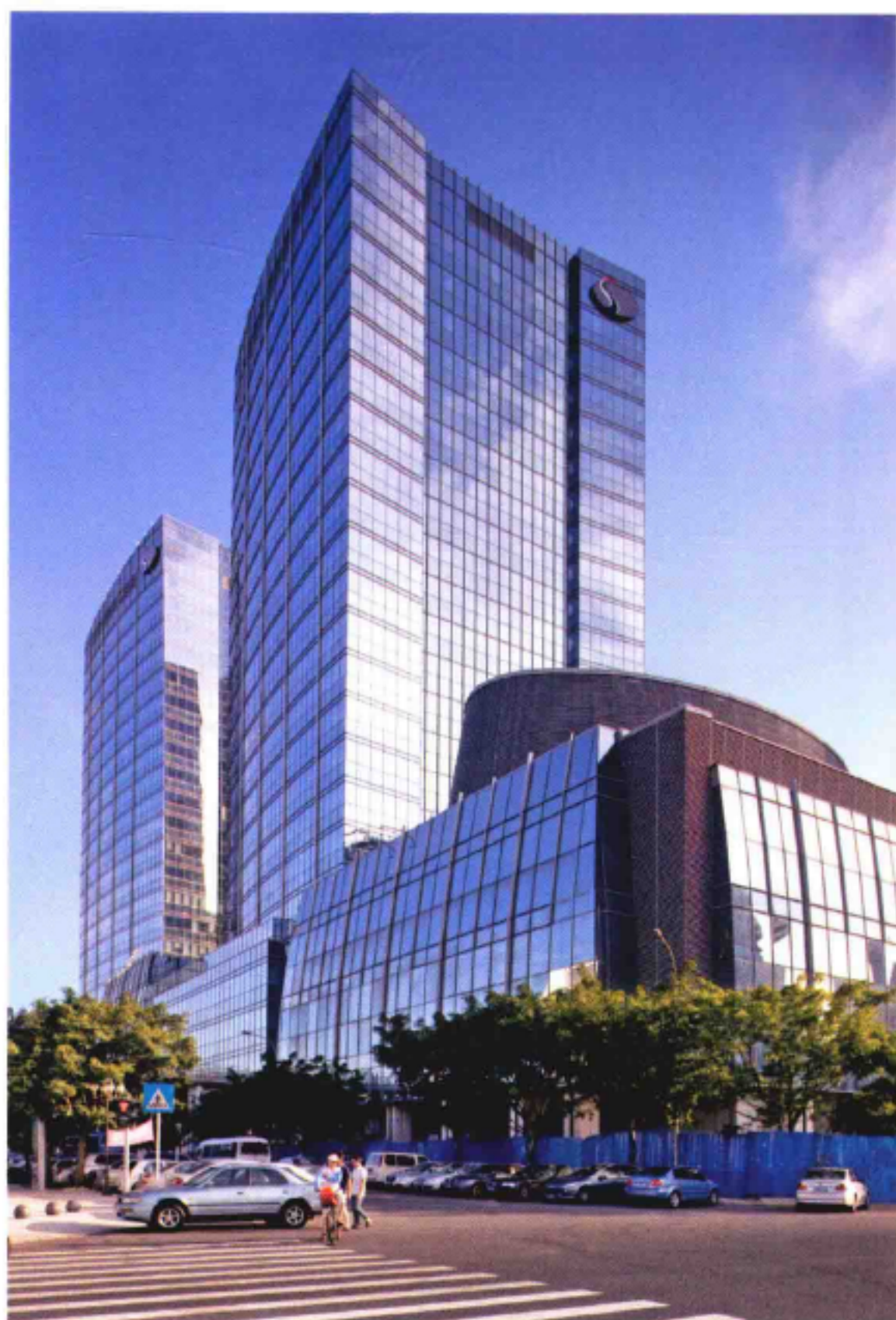
建筑外观 Exterior view