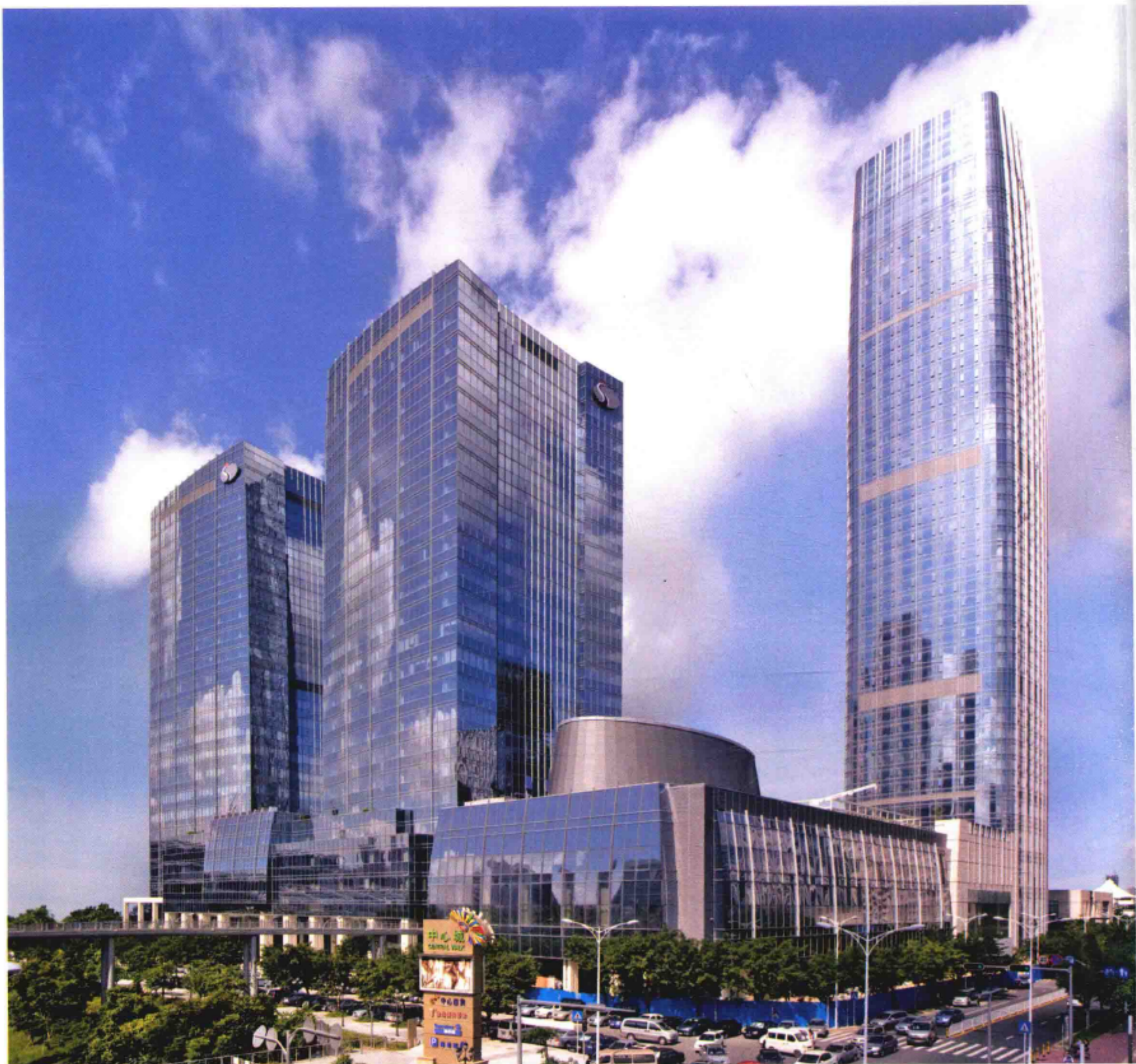
Exterior view 建筑外观