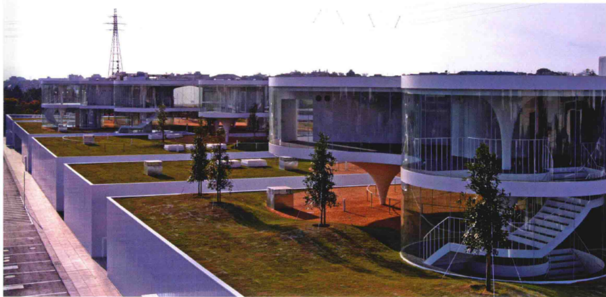
建筑外观 External view