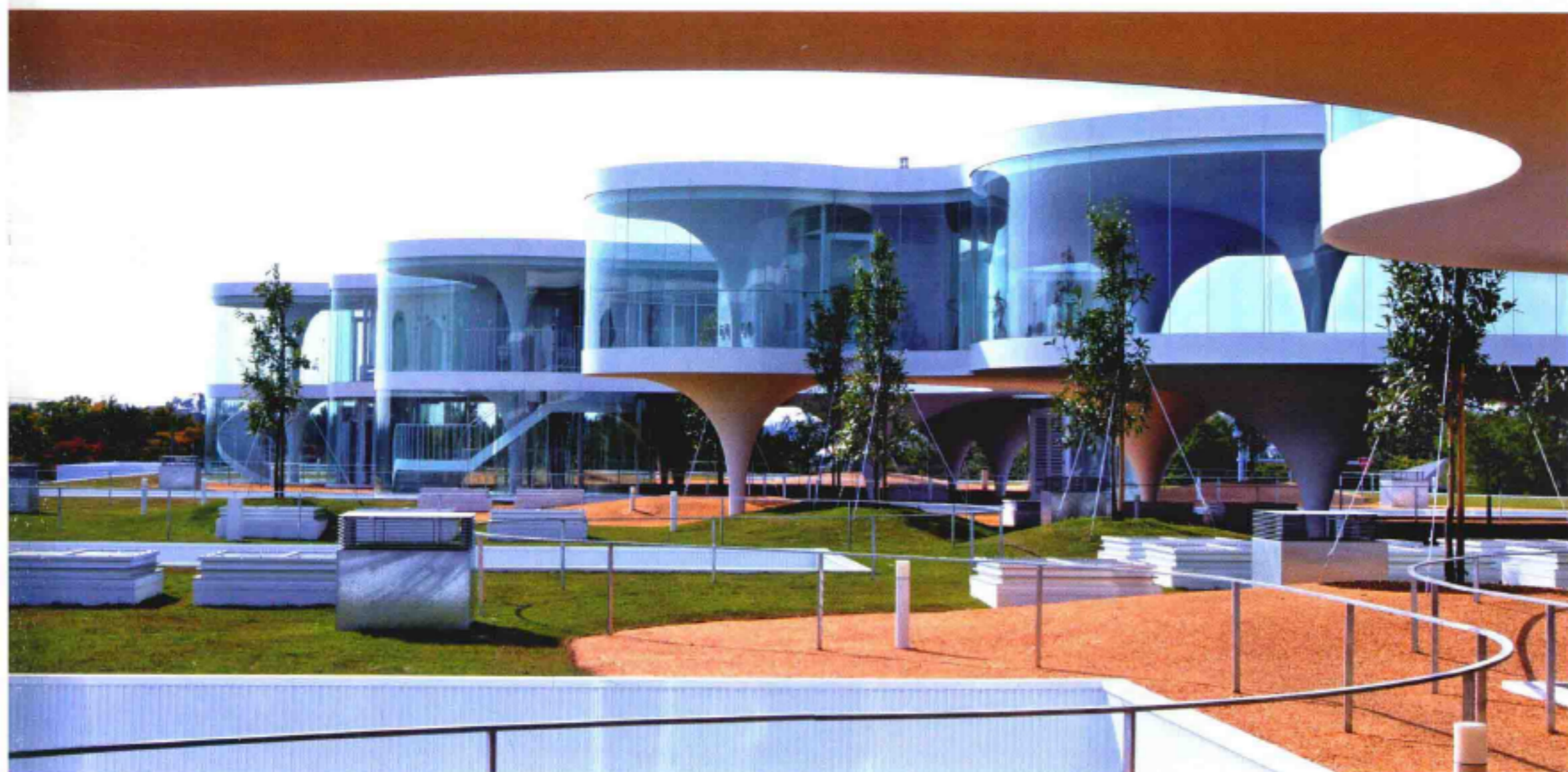
建筑外观 External view