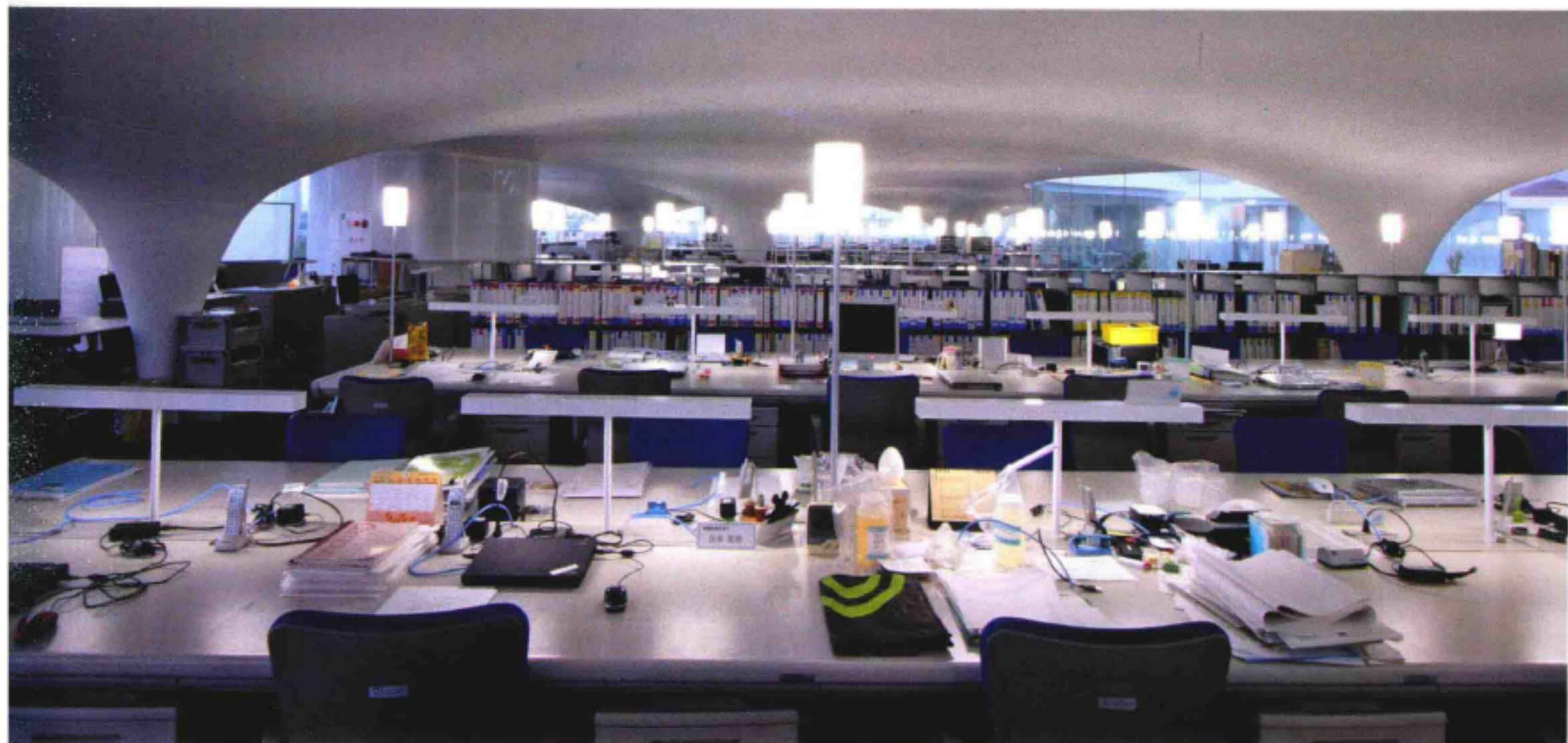
综合办公室 General affairs office