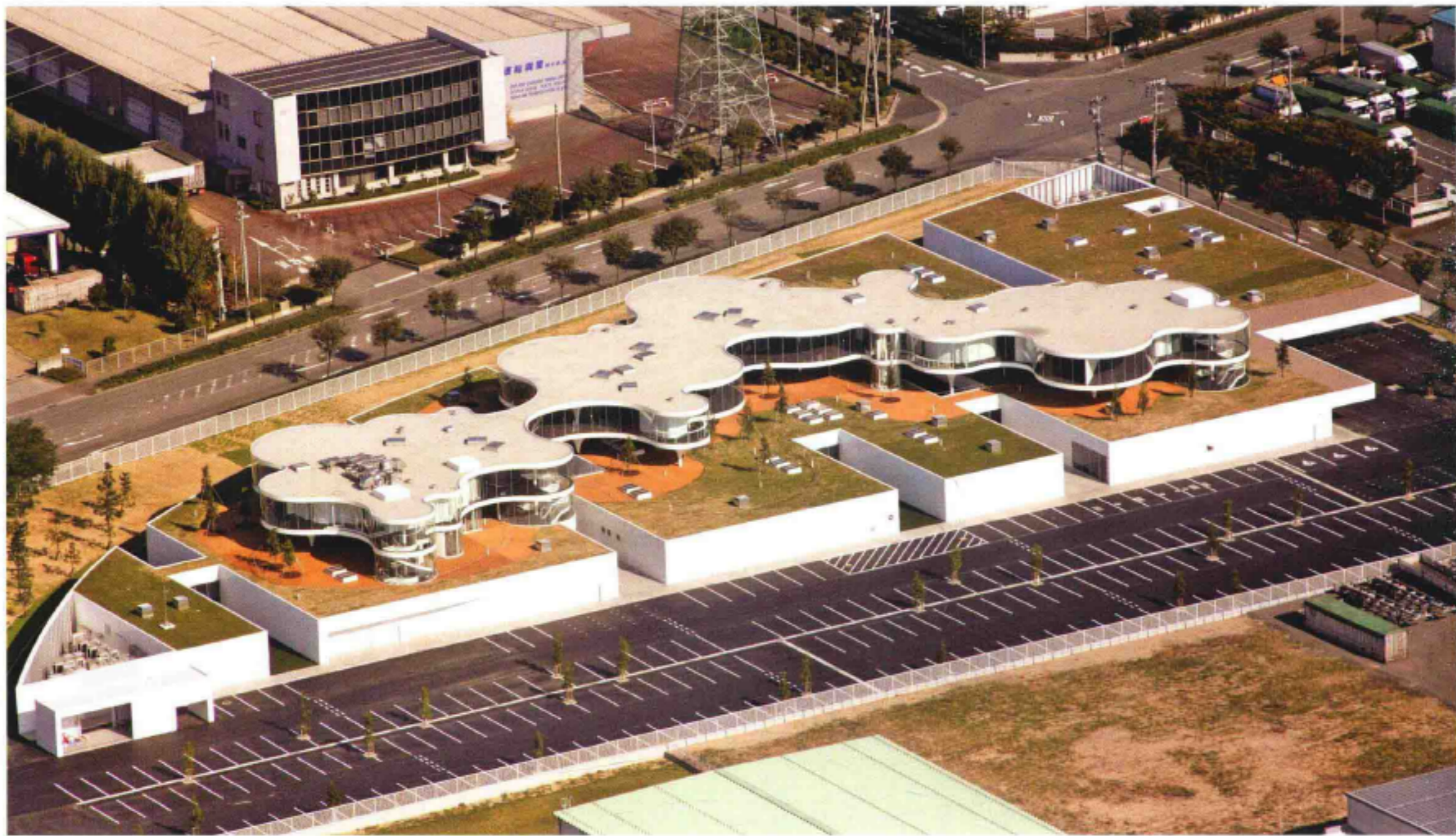
Bird's eye view 鸟瞰图