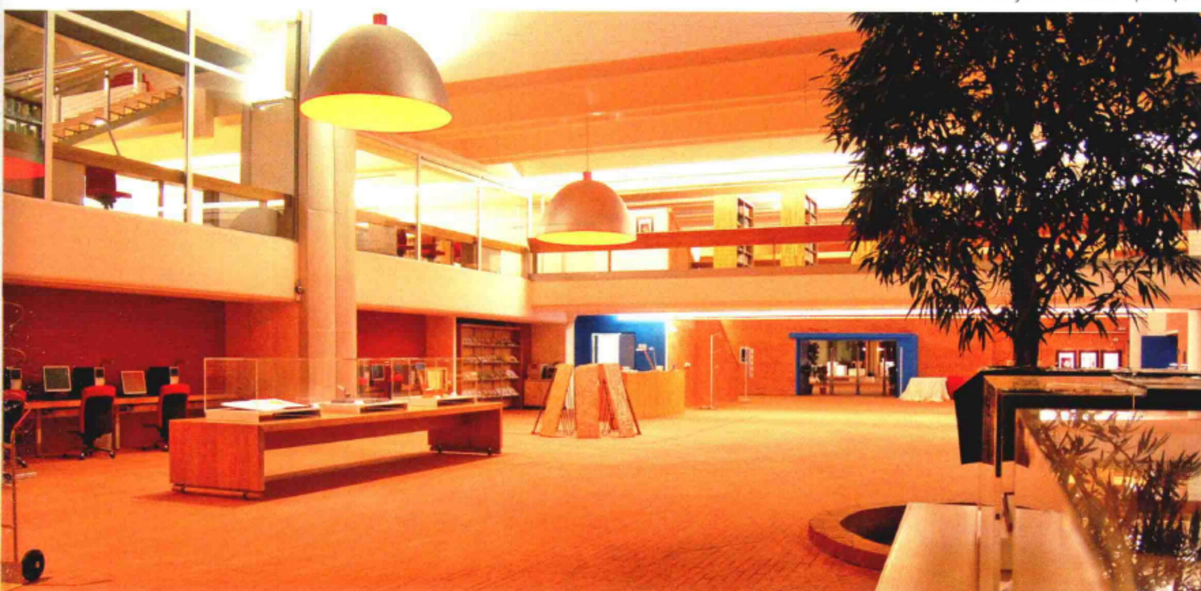
从一楼大厅看向二楼的演讲厅 The main hall on the ground floor, looking towards the large closed lecture hall on the second floor