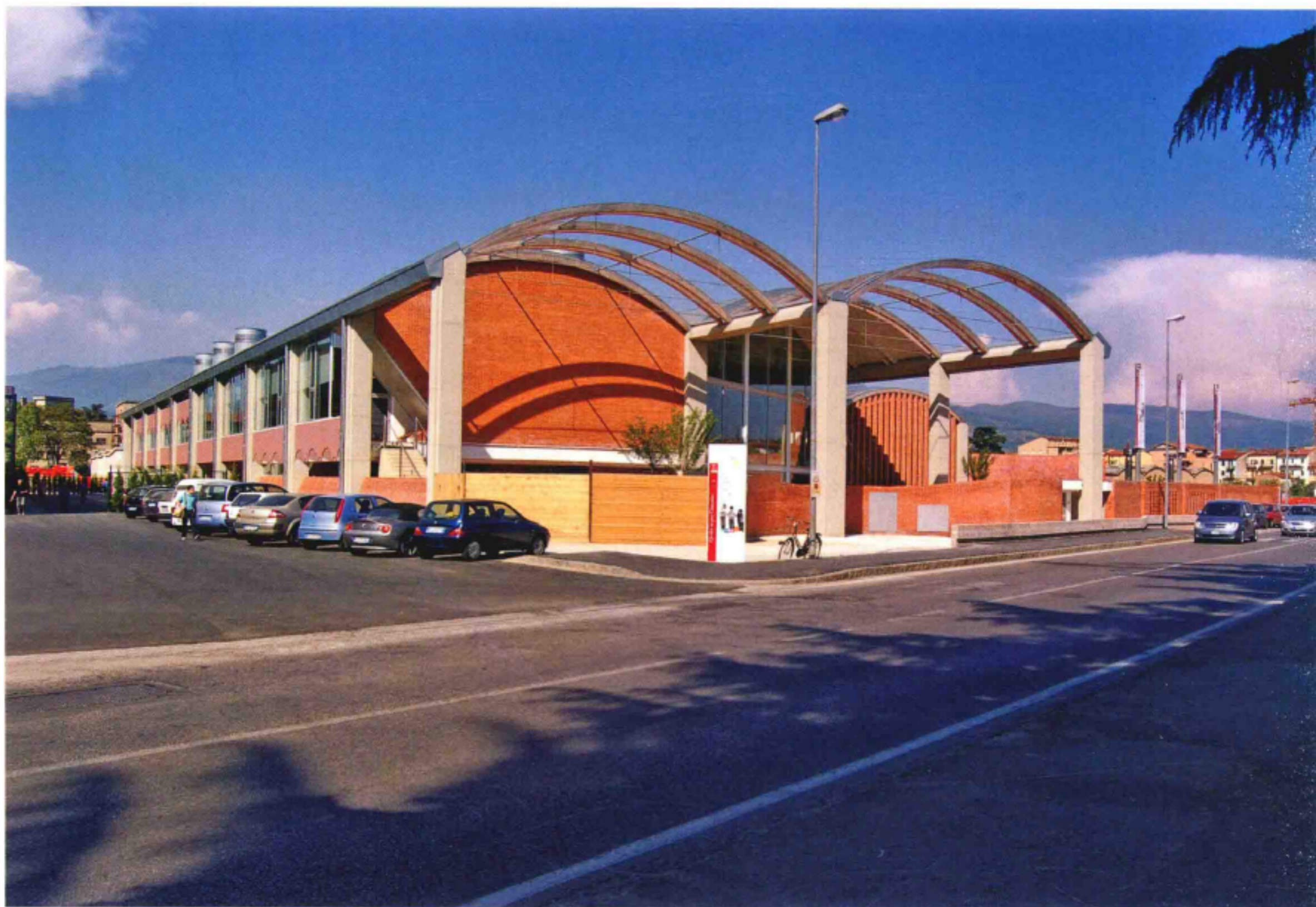
From the road on the south, the skeleton of the roof gives evidence of the history of the building 从南面的街道看，屋顶的骨架结构展示了建筑的历史