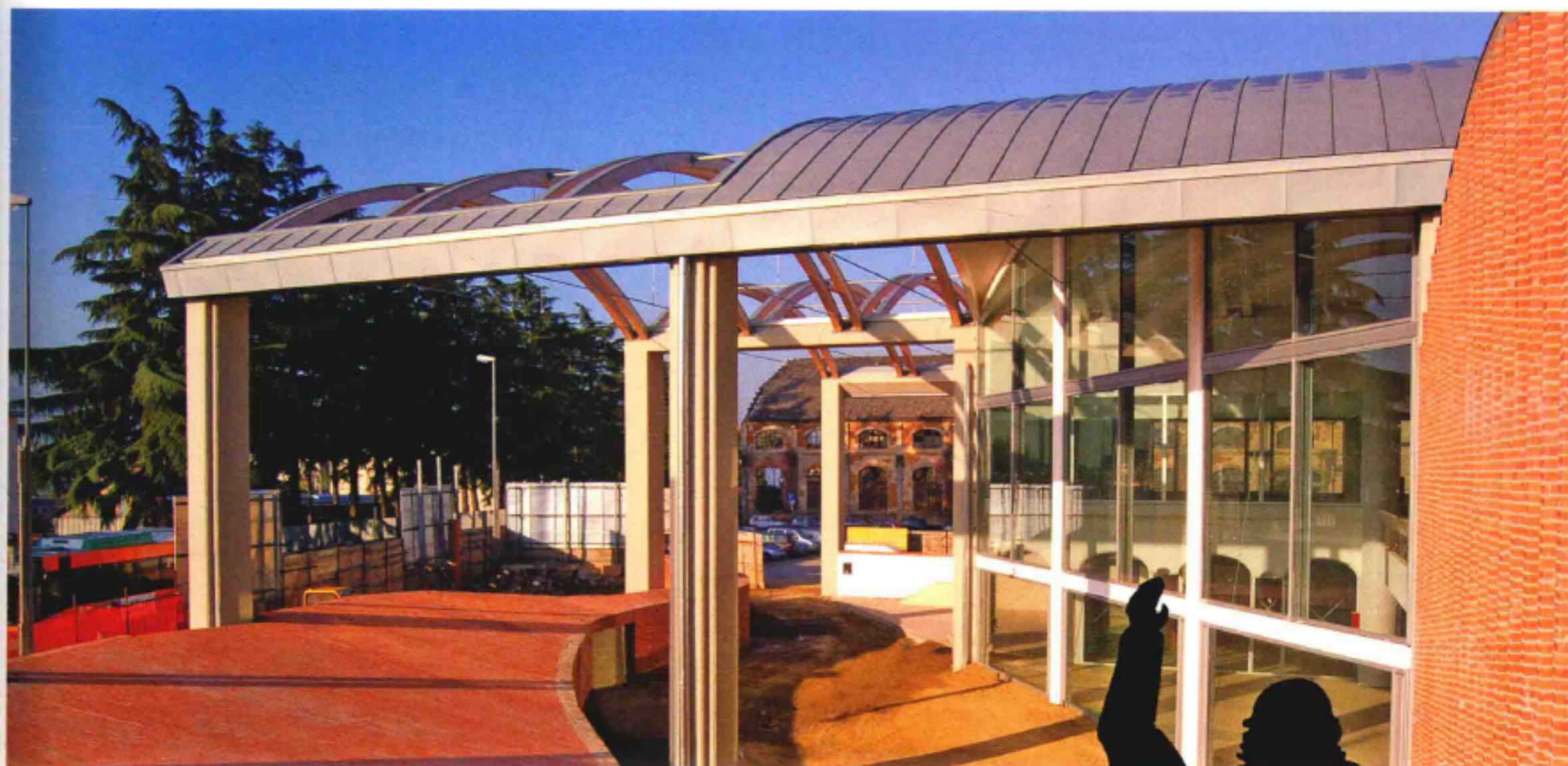
图书馆、水渠和发电厂之间的连接结构 Architectural relation between the library and the water and power plant