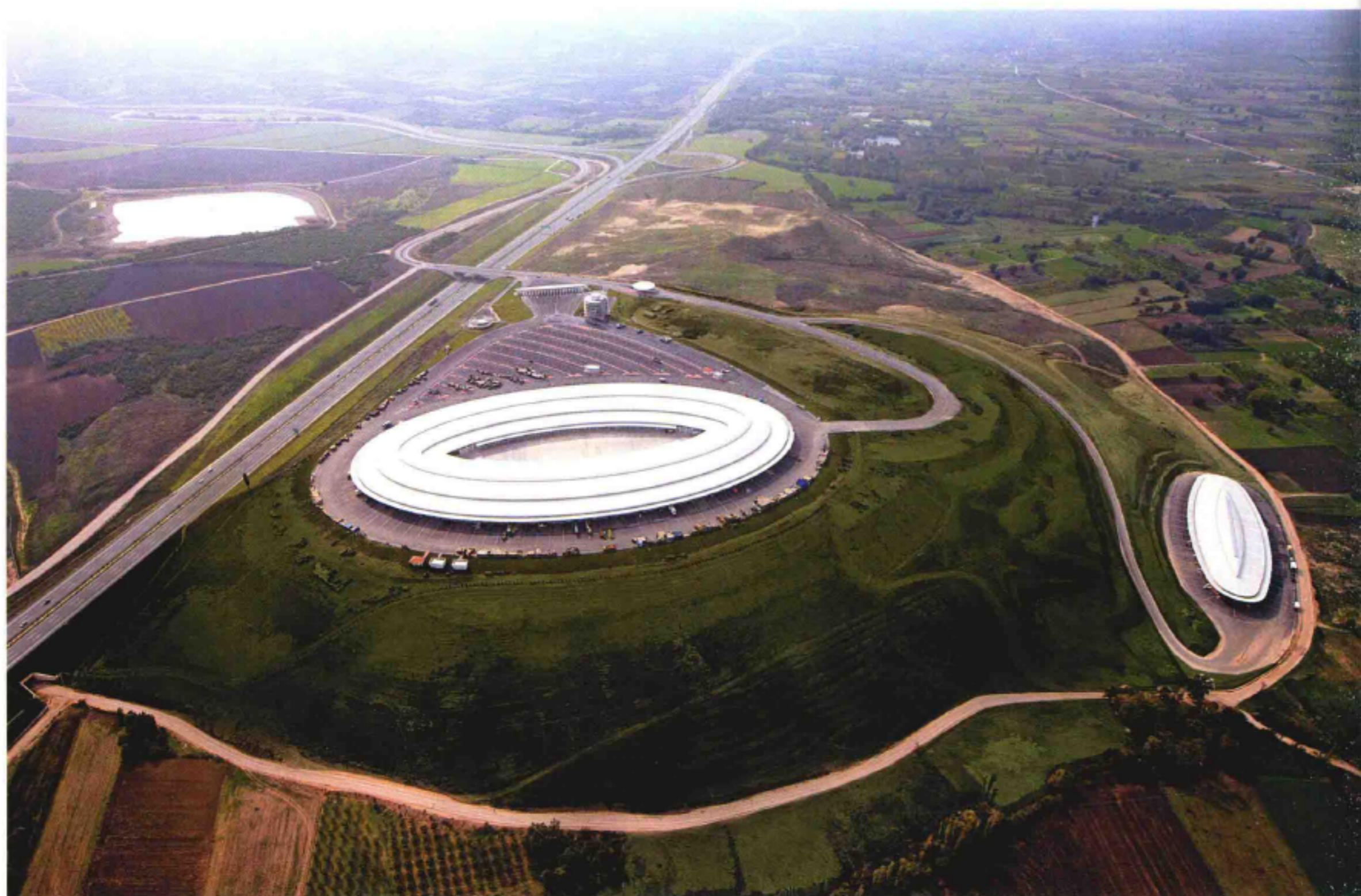
General view 全景图