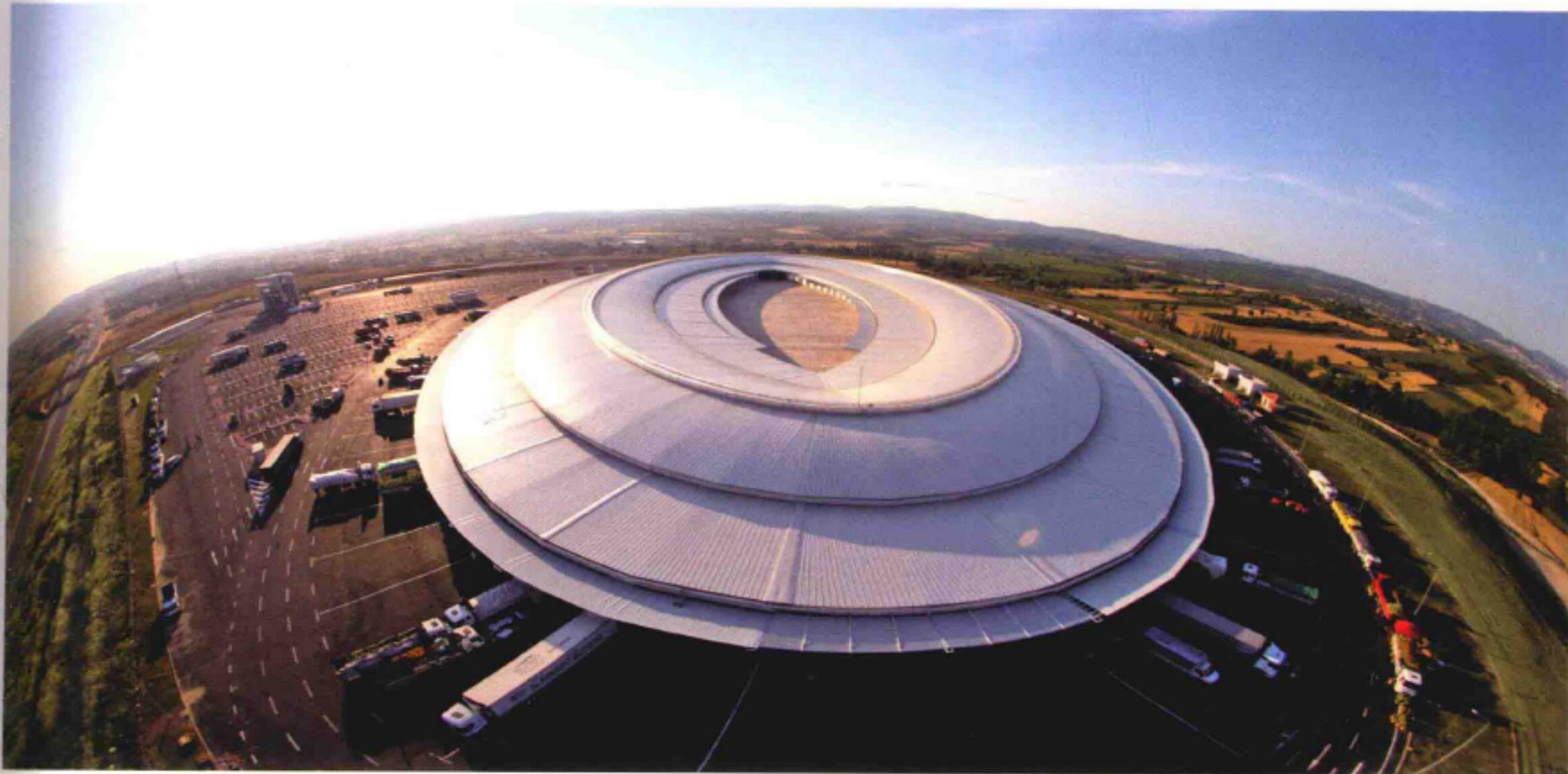
鸟瞰图 Bird's eye view