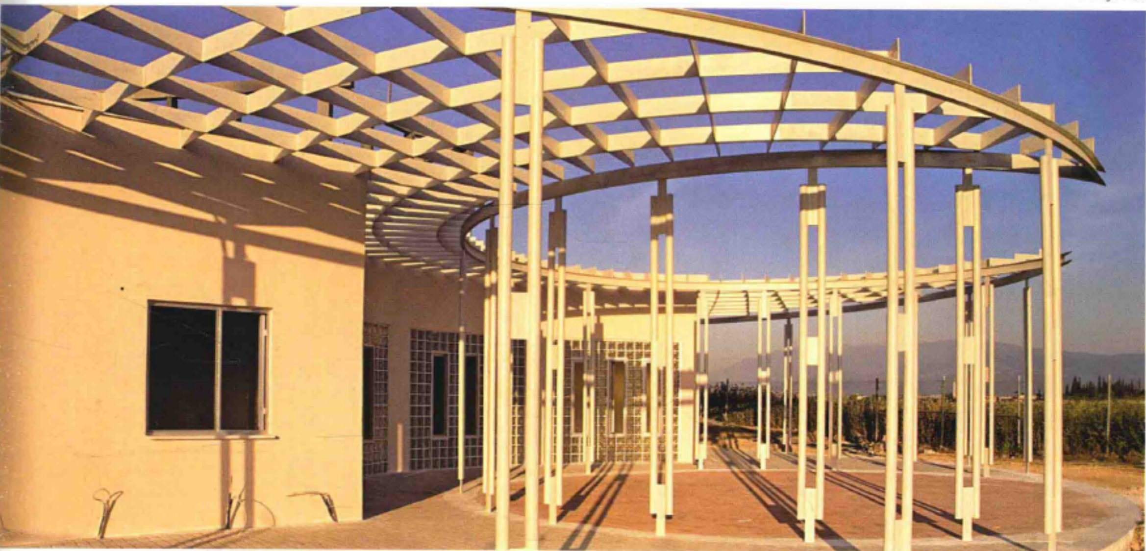
建筑外部 External view