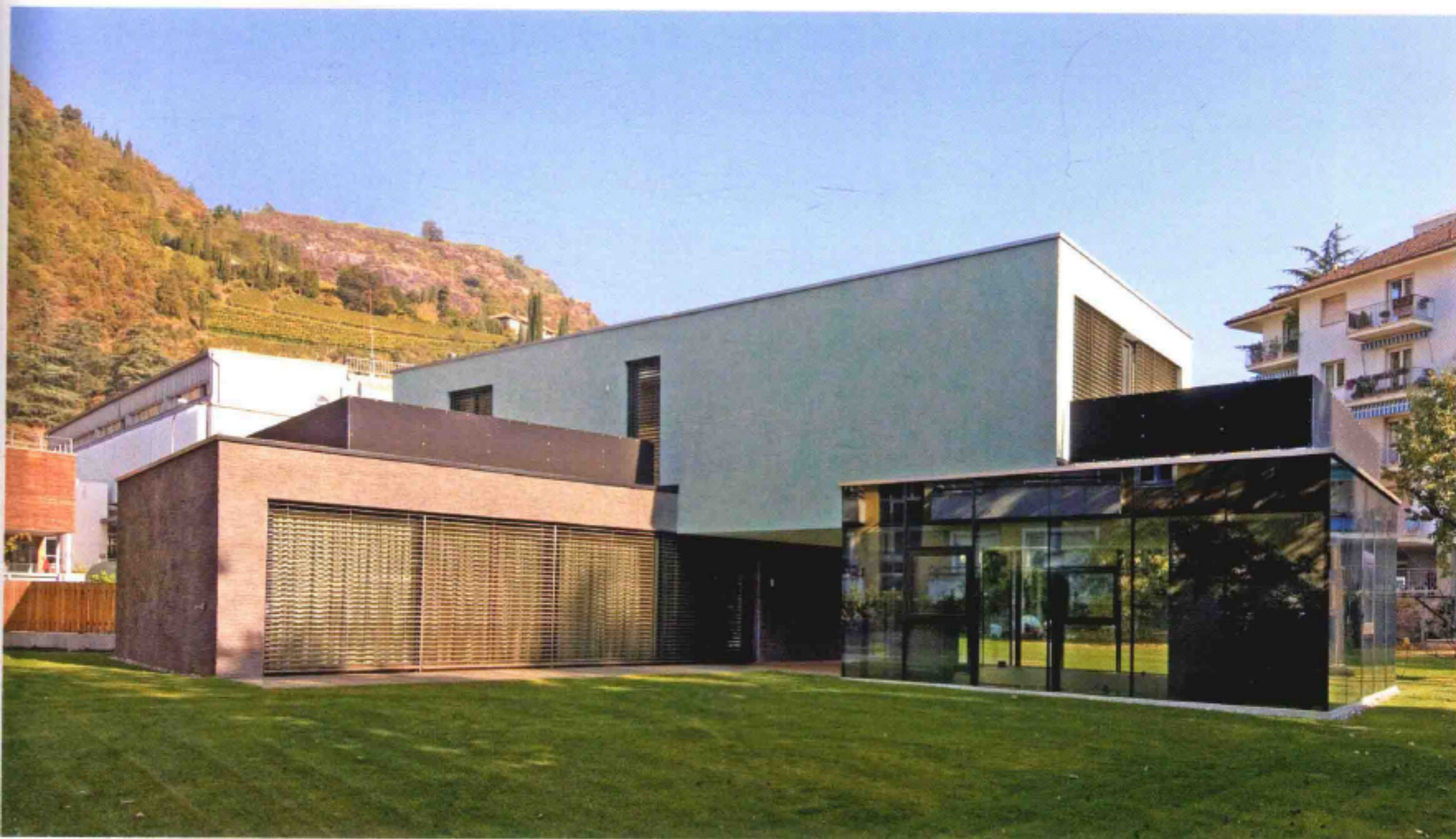
自然环境中的建筑 Building in the natural environment