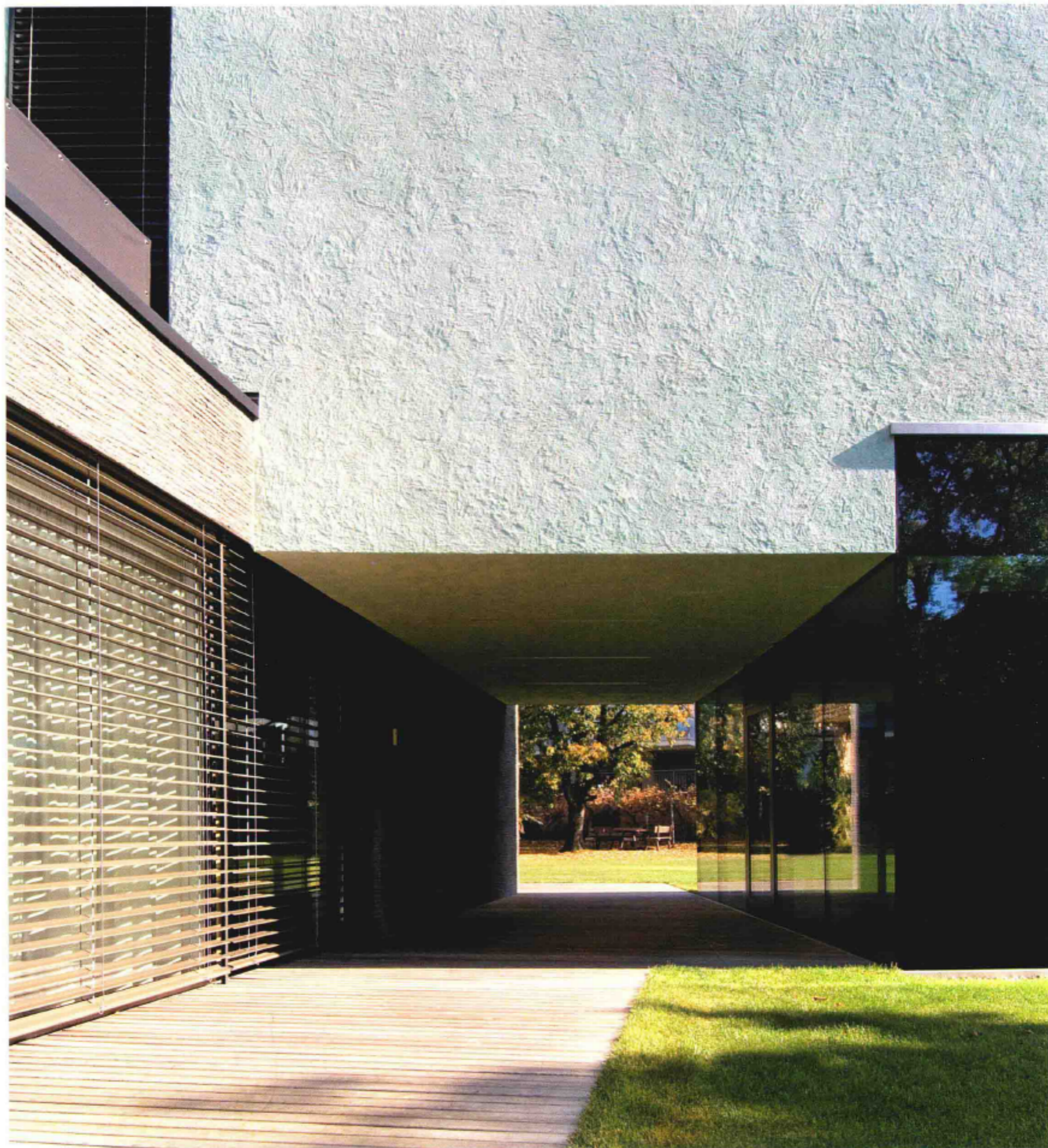
Exterior corridor 室外走廊