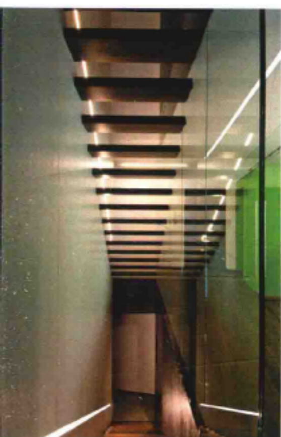
室内通道 Interior corridor