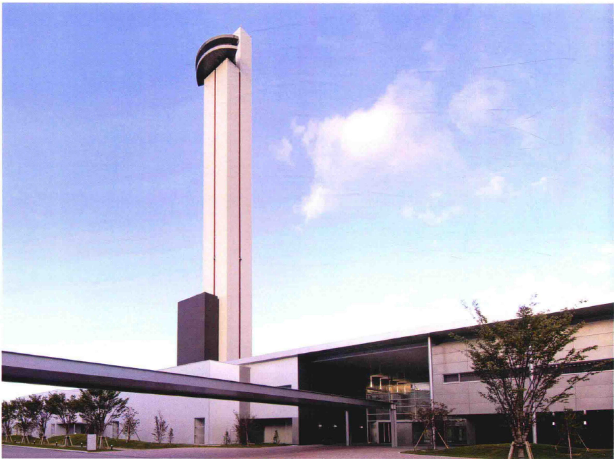
General view from west 西侧全景

大楼的室内设计以入口大厅为中心，北侧是工作区，南侧是VIP区。两个区域采用开放式布局，并且互相连通，使工作环境具有延续感。东侧的中庭不仅具有通道的作用，而且还包含一个会议区和一个休息区。中庭的两层楼也是开放式的，打造了工作空间的延续性。此外，人们可以在穿过科研楼电梯的天桥上看到最先进的科研成果和新干线与其周边的风景。