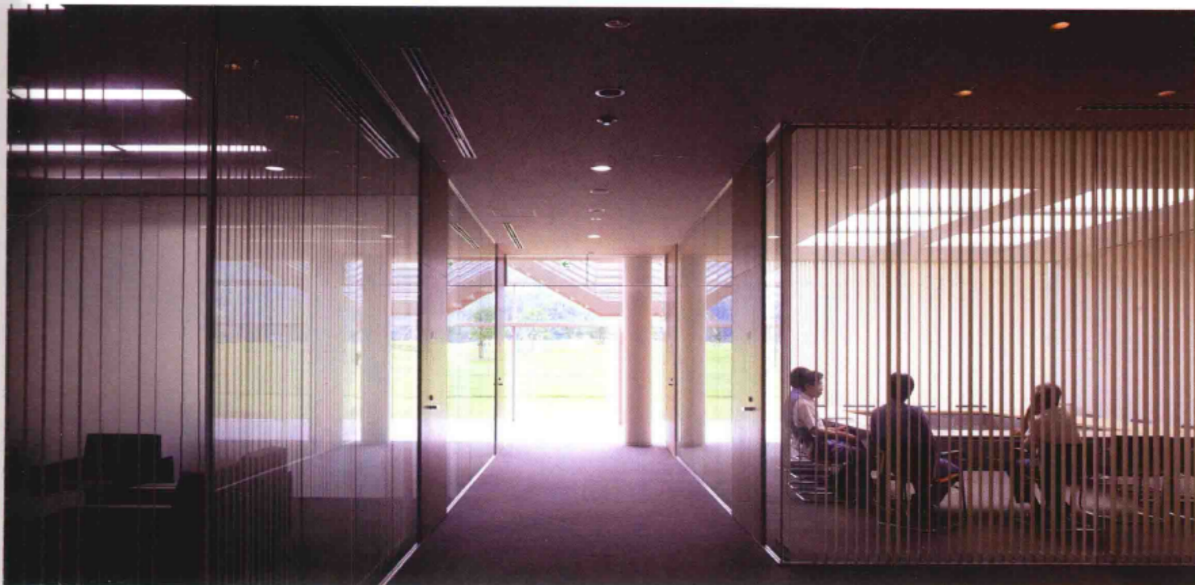
会議室 Conference room