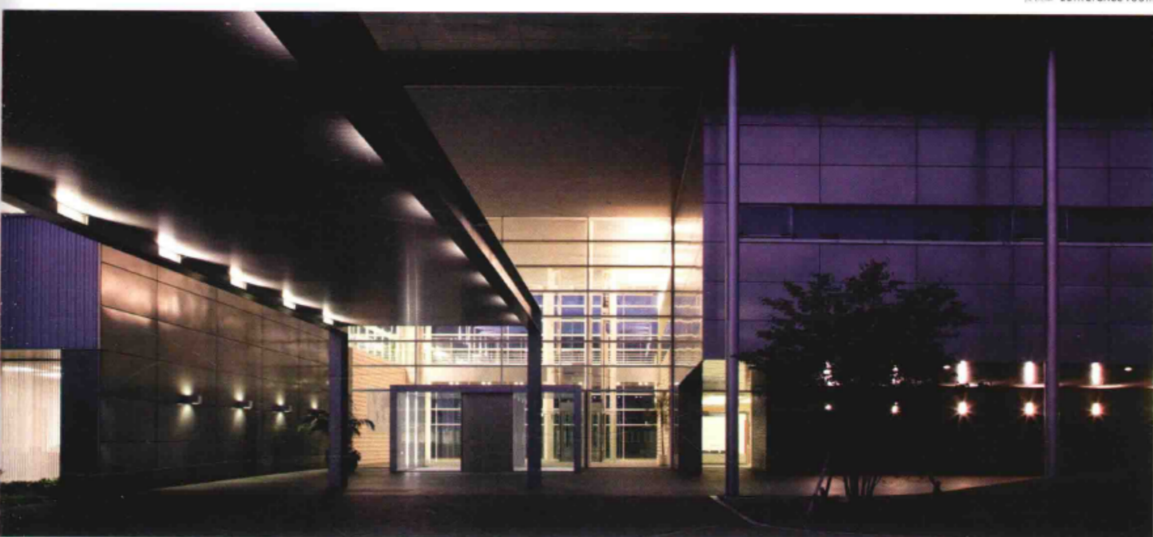
外観夜景 Façade, night view