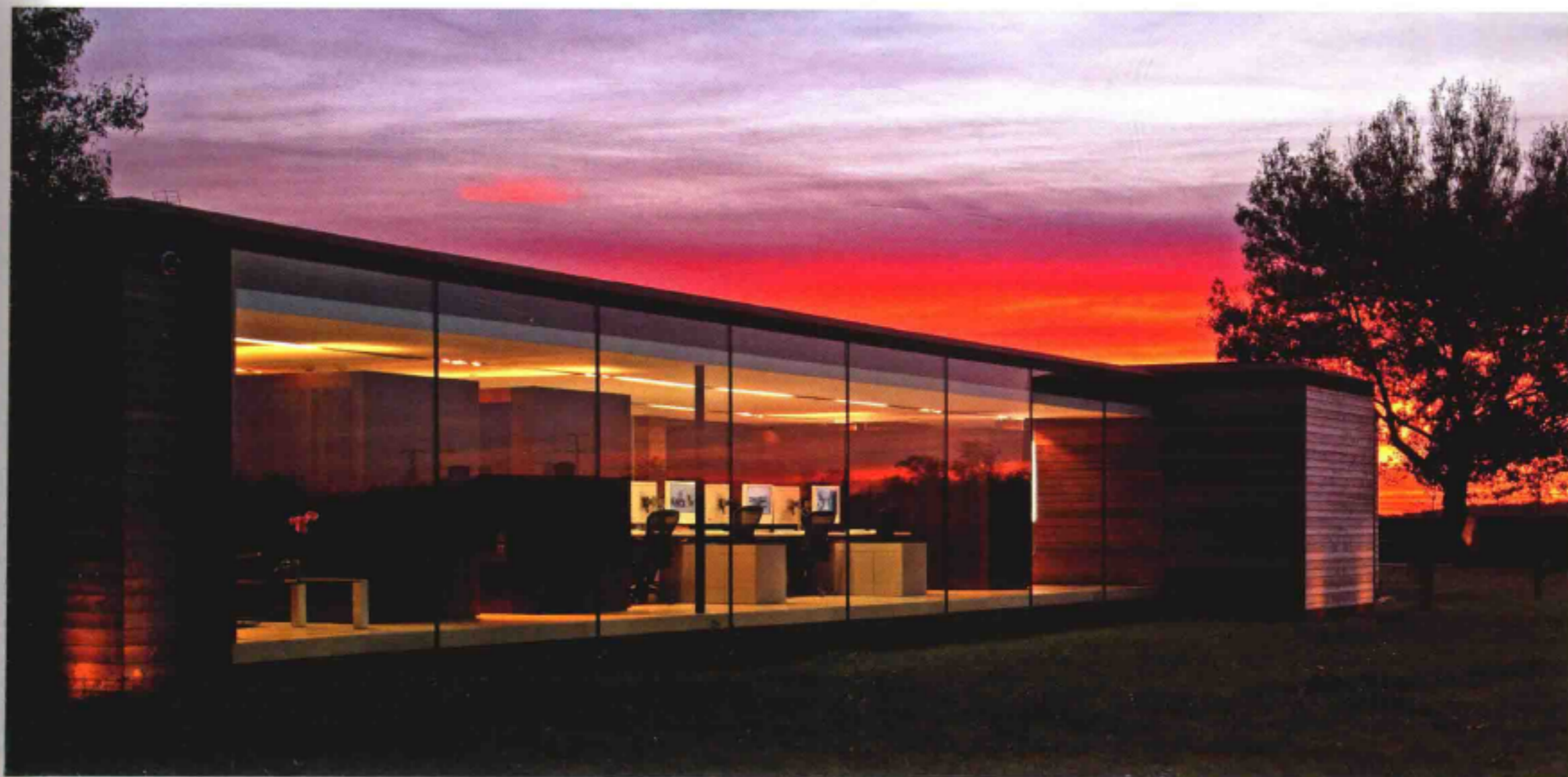
夕阳下的建筑 In the sunset