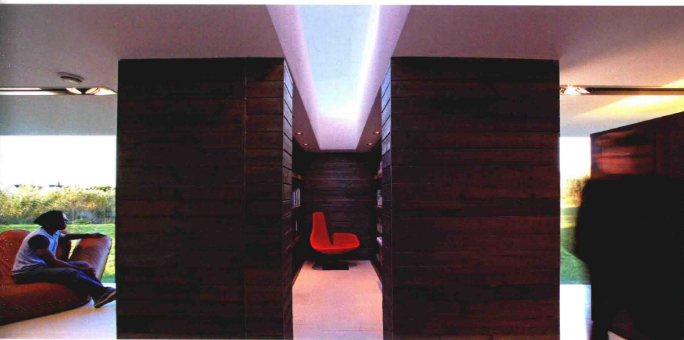
书架 Book shelves