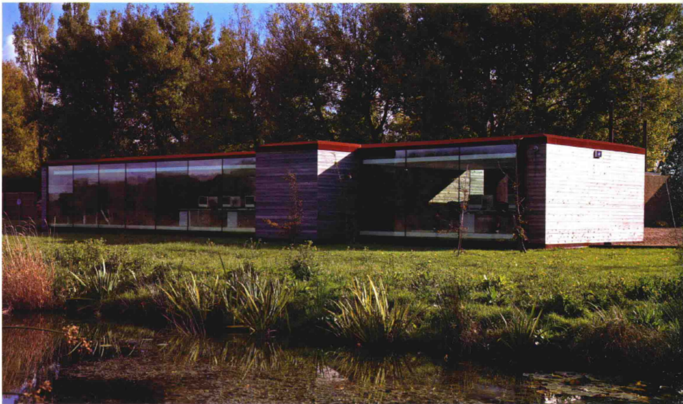
In the daylight 日光下的建筑