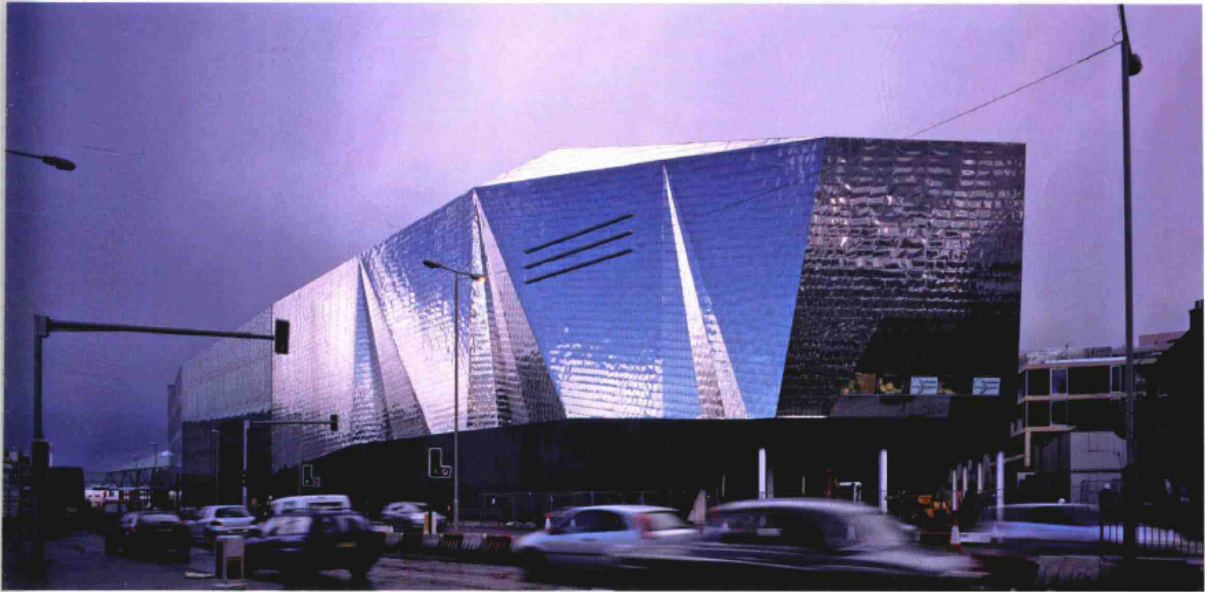
从街面上看建筑 View from the street