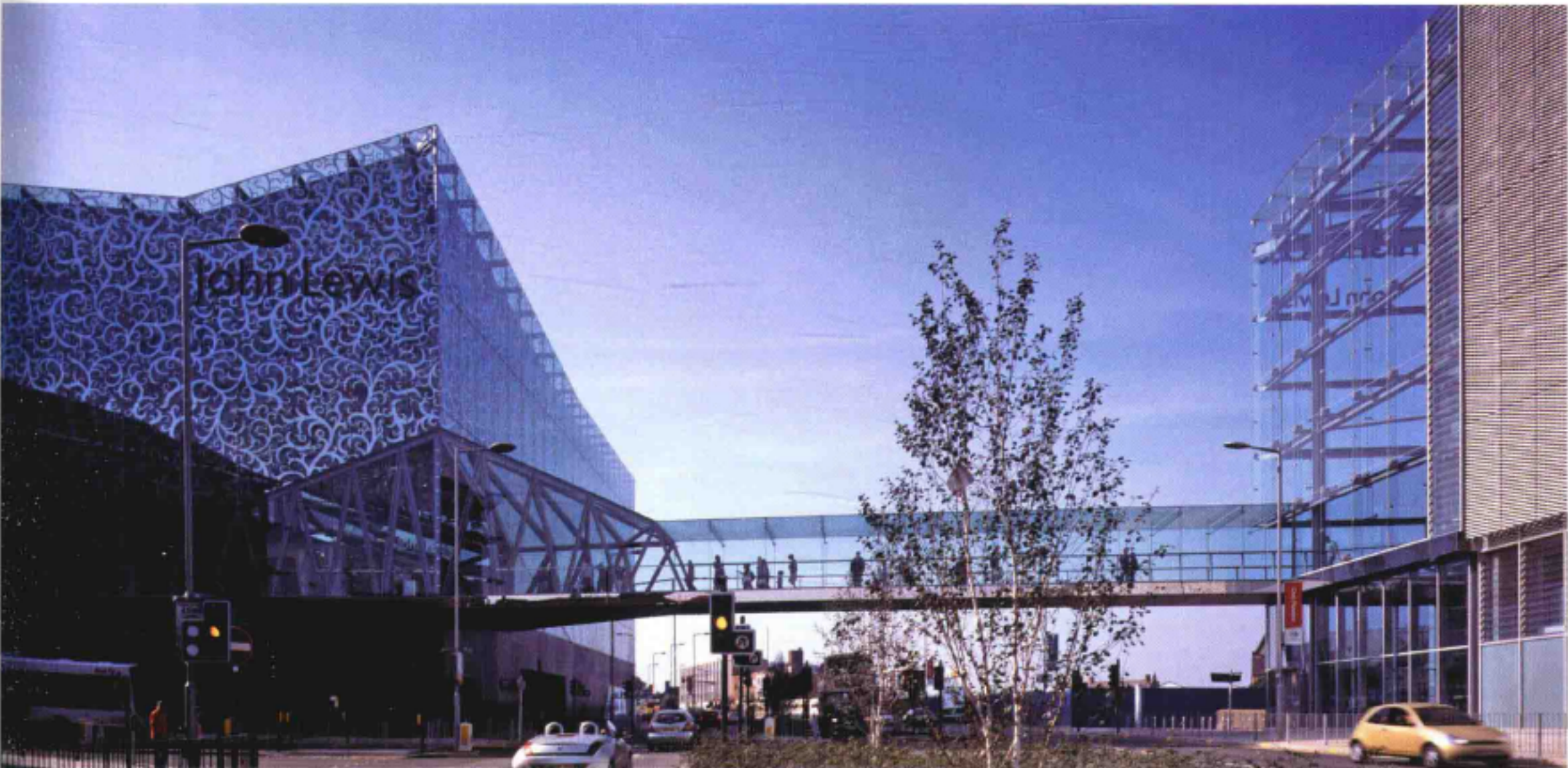
新桥外景 Façade with bridge