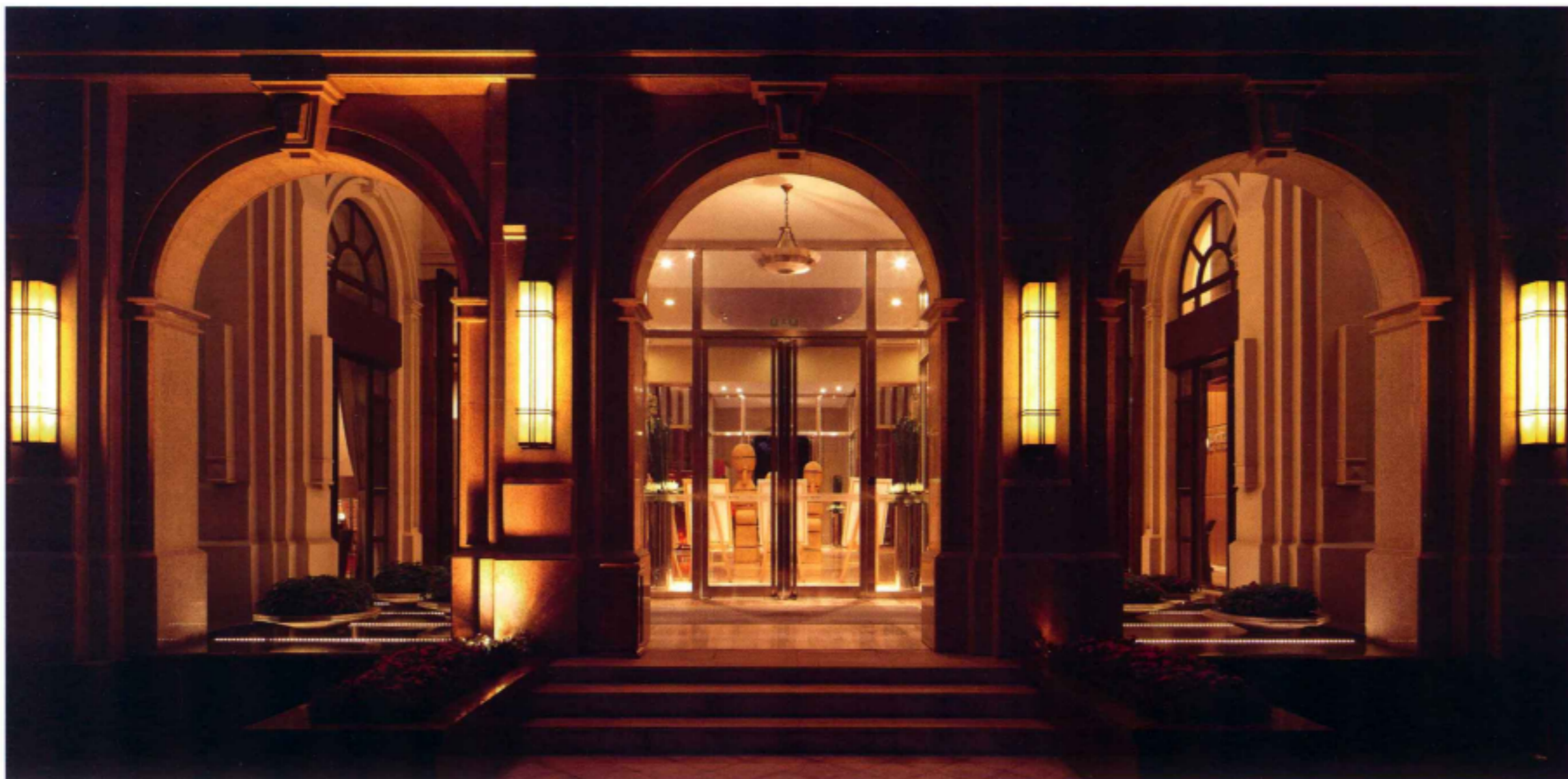
left local club facade/会所立面局部 above local club/会所局部 below corner of the indoor/室内一角