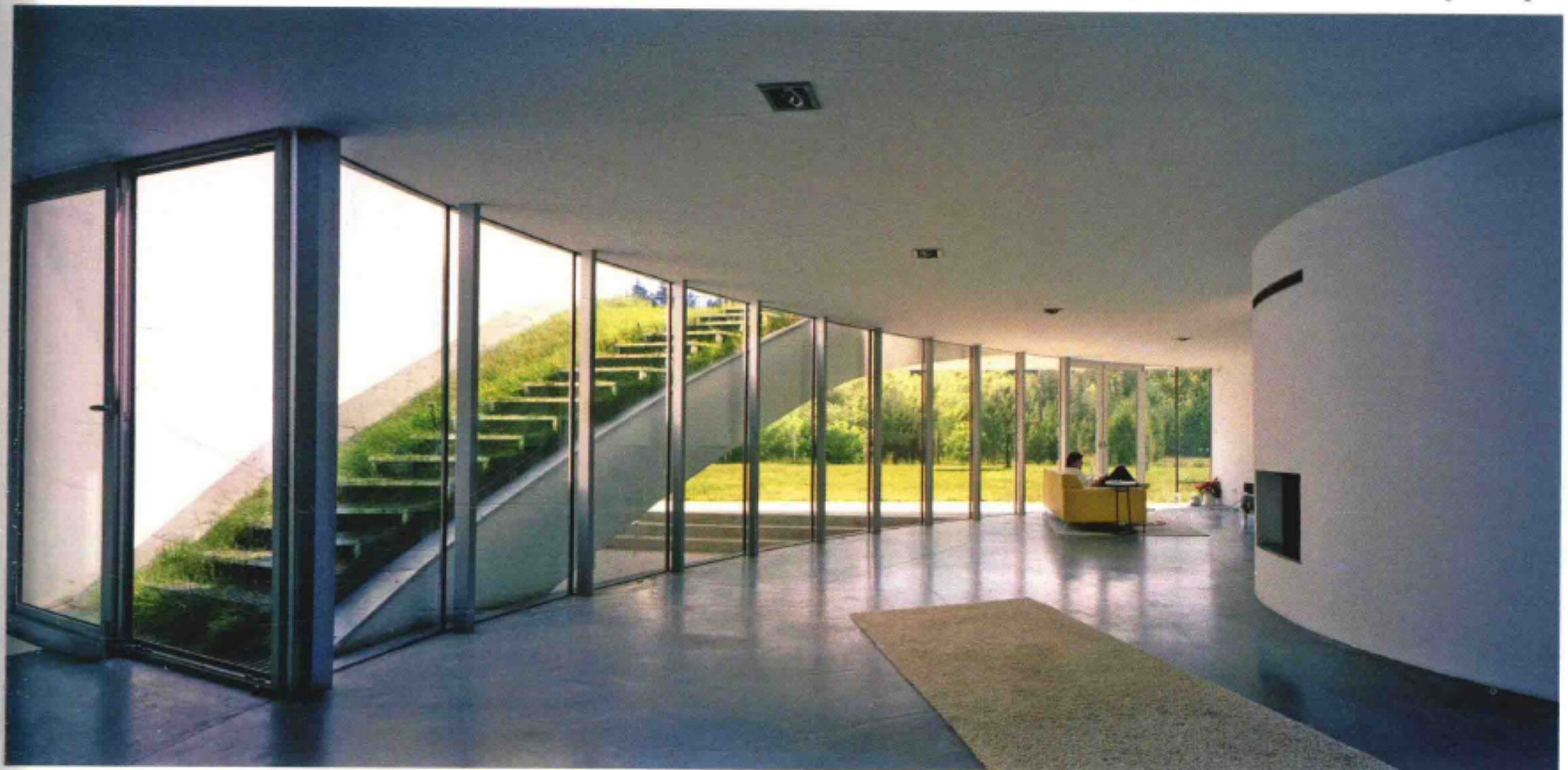
客厅通过楼梯与绿色屋顶相连 Living room with stairs leading to the green roof