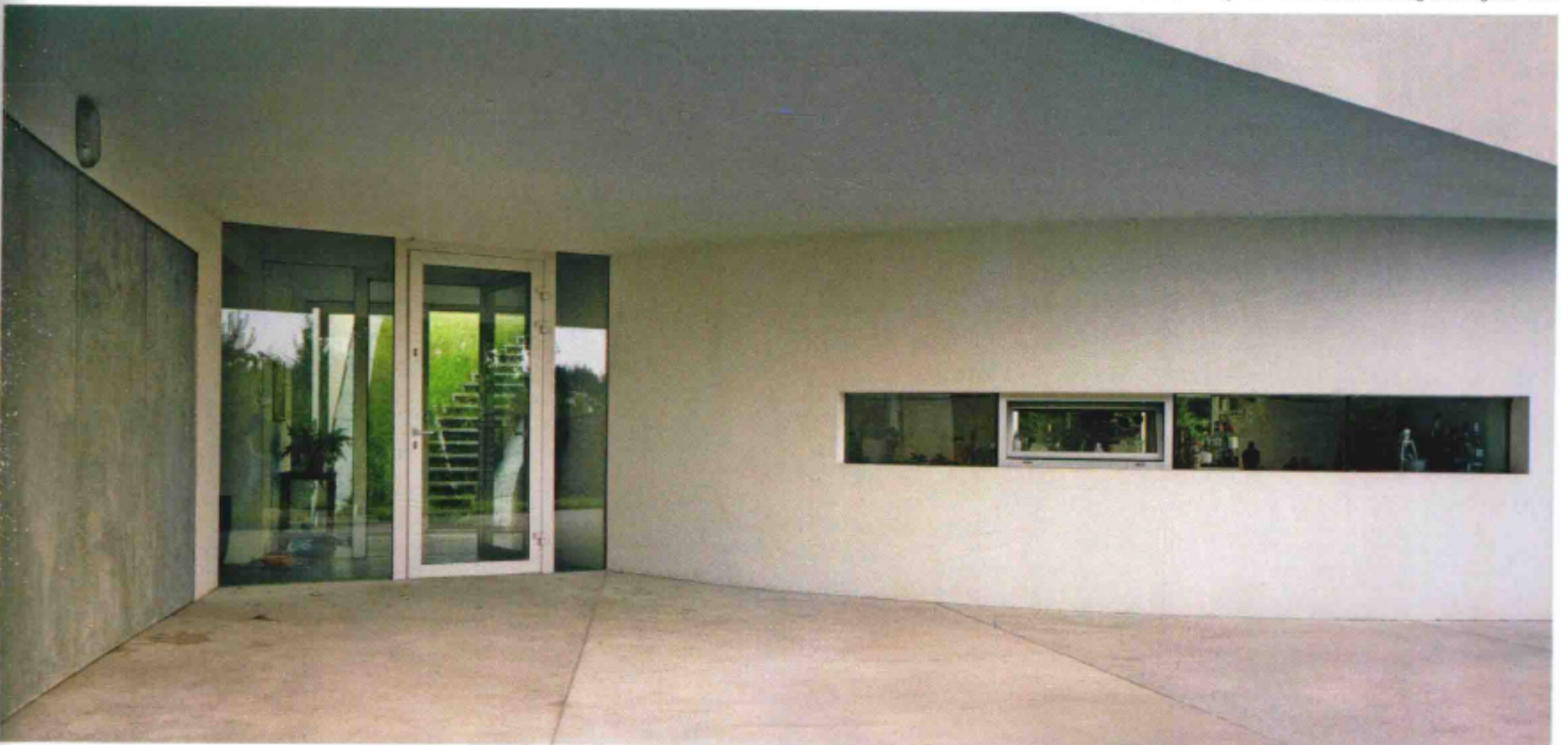
住宅主入口 Main entrance to the house