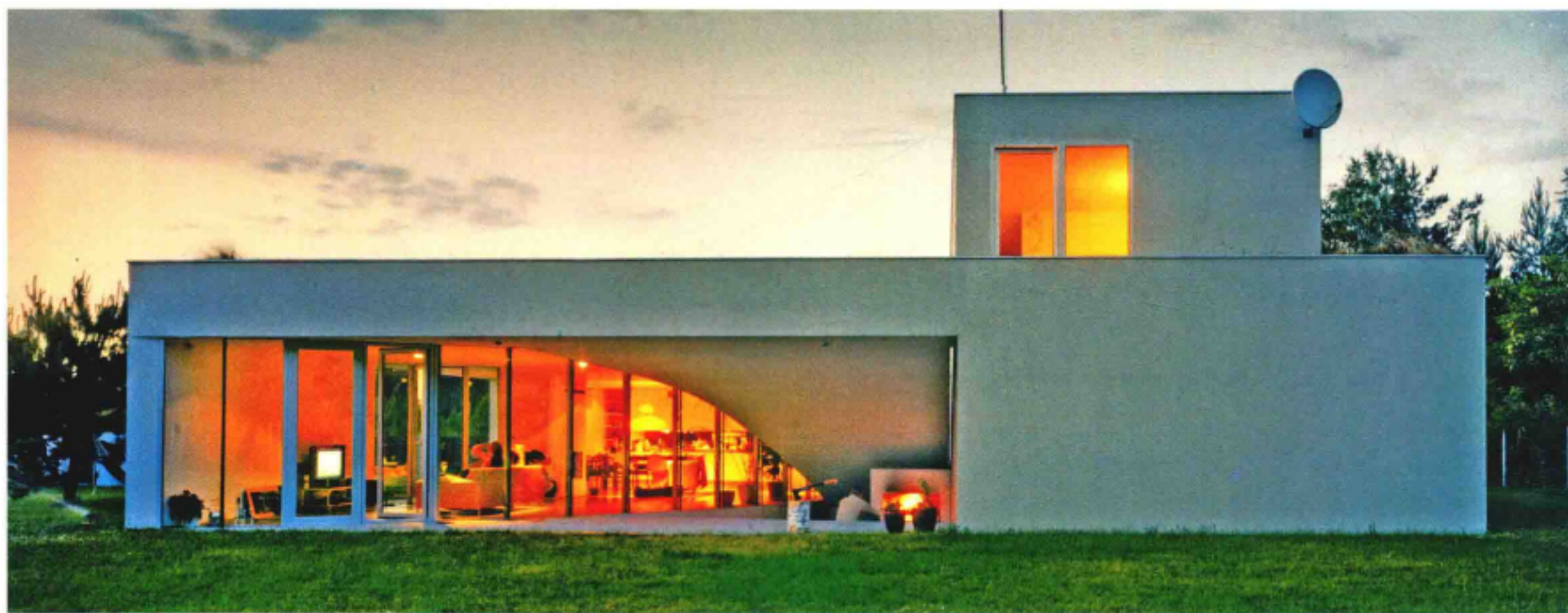
The southwest façade 建筑西南立面

工艺技术的选择完全依据业主要求——他们需要简约的住宅。设计从这一点出发，室内外全部采用白色灰泥粉饰，绿色的屋顶构成了很好的屏障——冬天减少热量流失，夏天吸收热量，从而确保了室内的舒适环境。