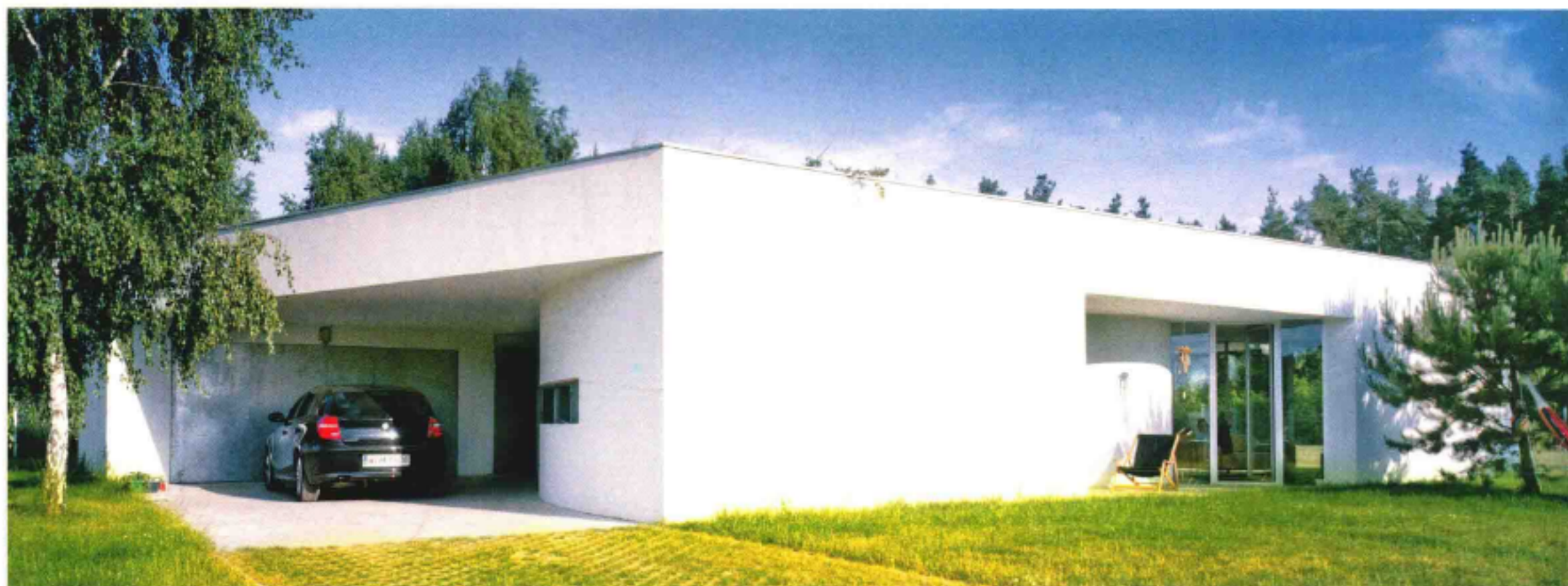
View of the house from the road 从路边看住宅