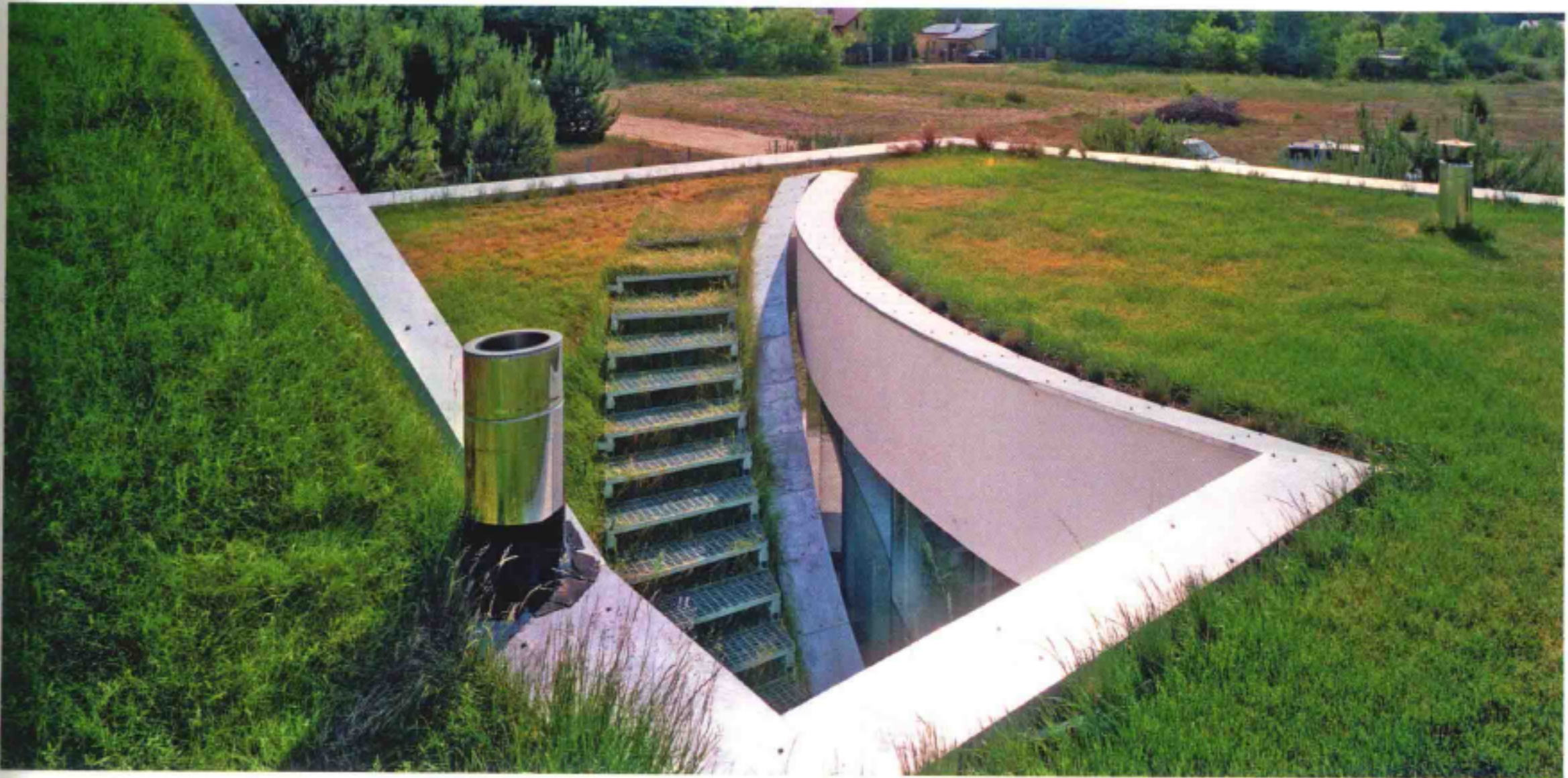
通往屋顶的台阶上长满了青草 The stairs leading to the roof with one mesh across which grows the grass